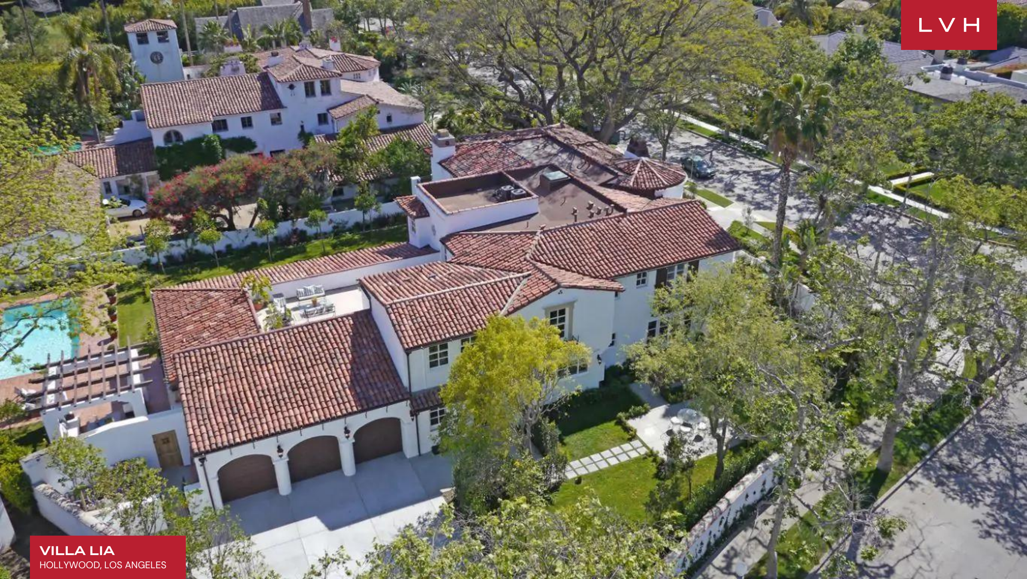
VILLA LIA HOLLYWOOD, LOS ANGELES