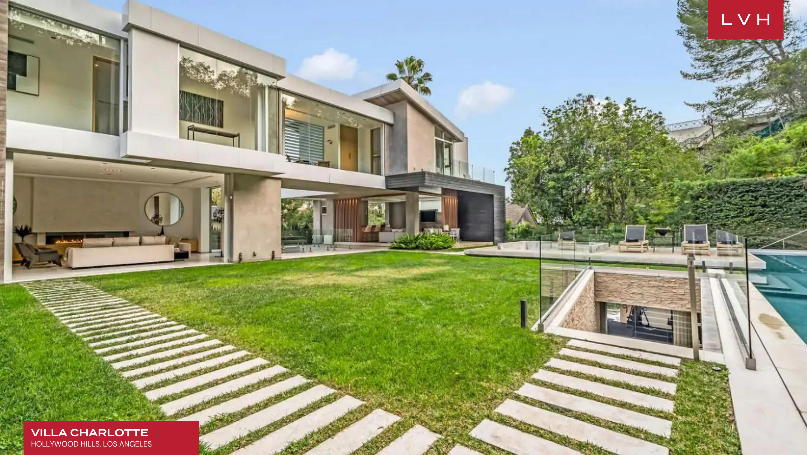
VILLA CHARLOTTE HOLLYWOOD HILLS, LOS ANGELES