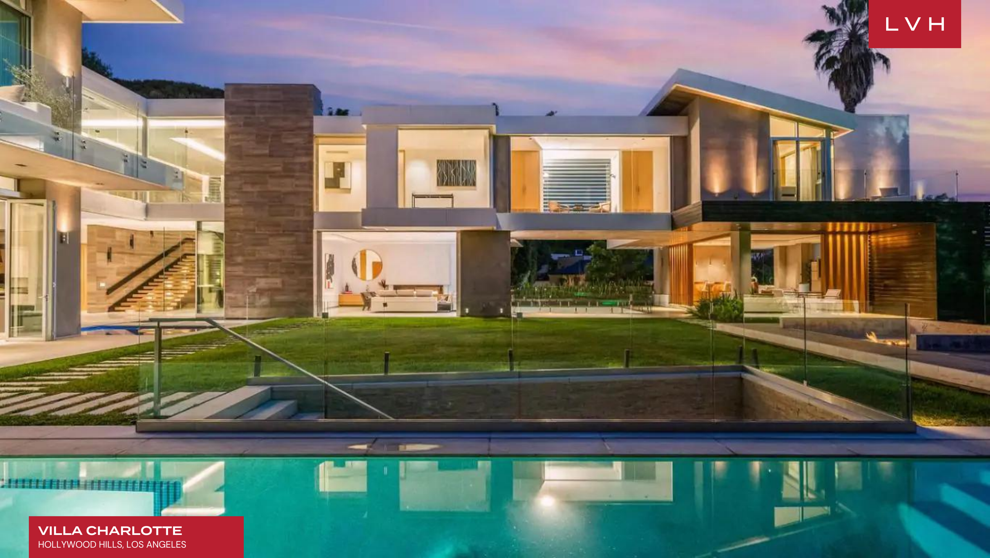
VILLA CHARLOTTE HOLLYWOOD HILLS, LOS ANGELES