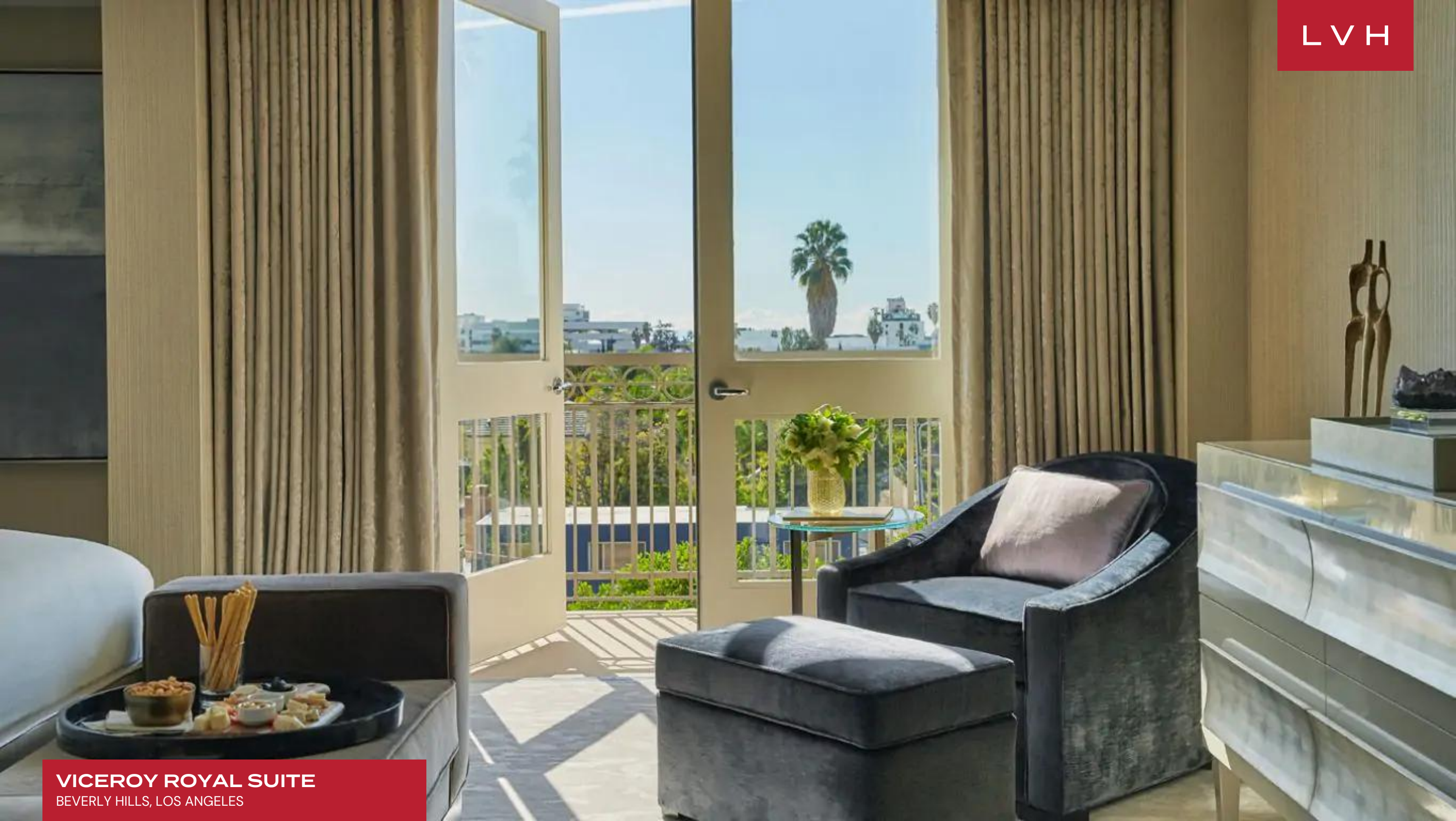
VICEROY ROYAL SUITE BEVERLY HILLS, LOS ANGELES