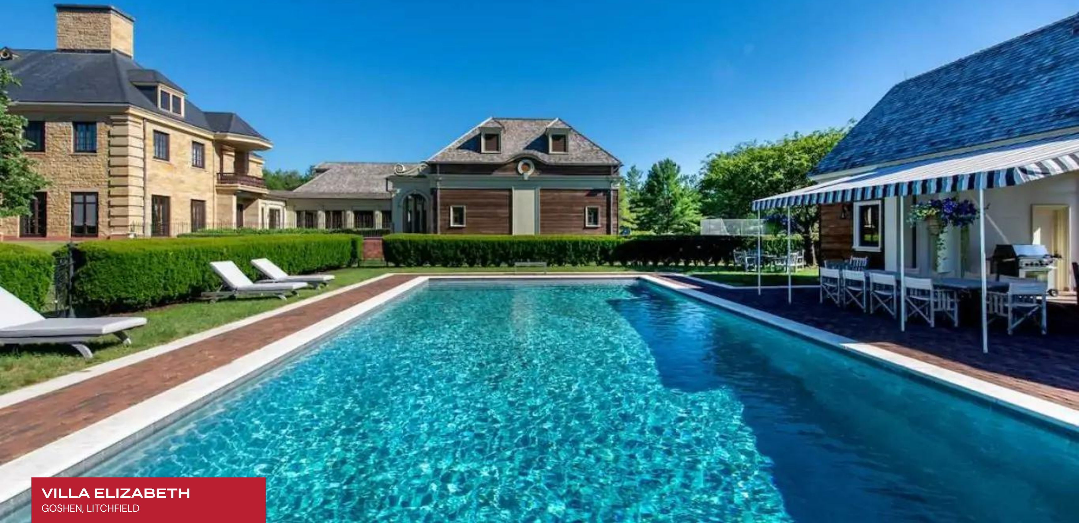
VILLA ELIZABETH GOSHEN, LITCHFIELD