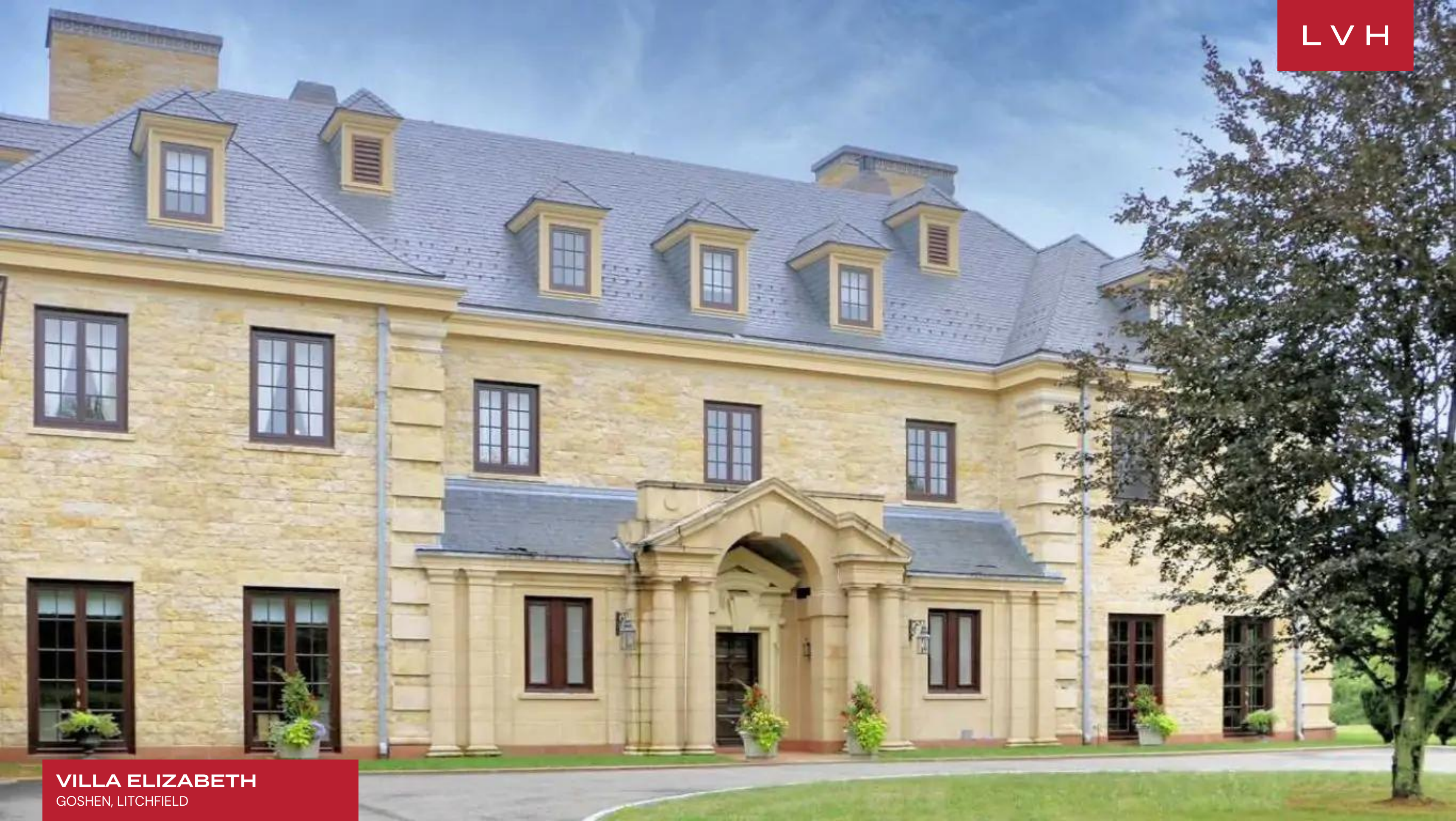
VILLA ELIZABETH GOSHEN, LITCHFIELD