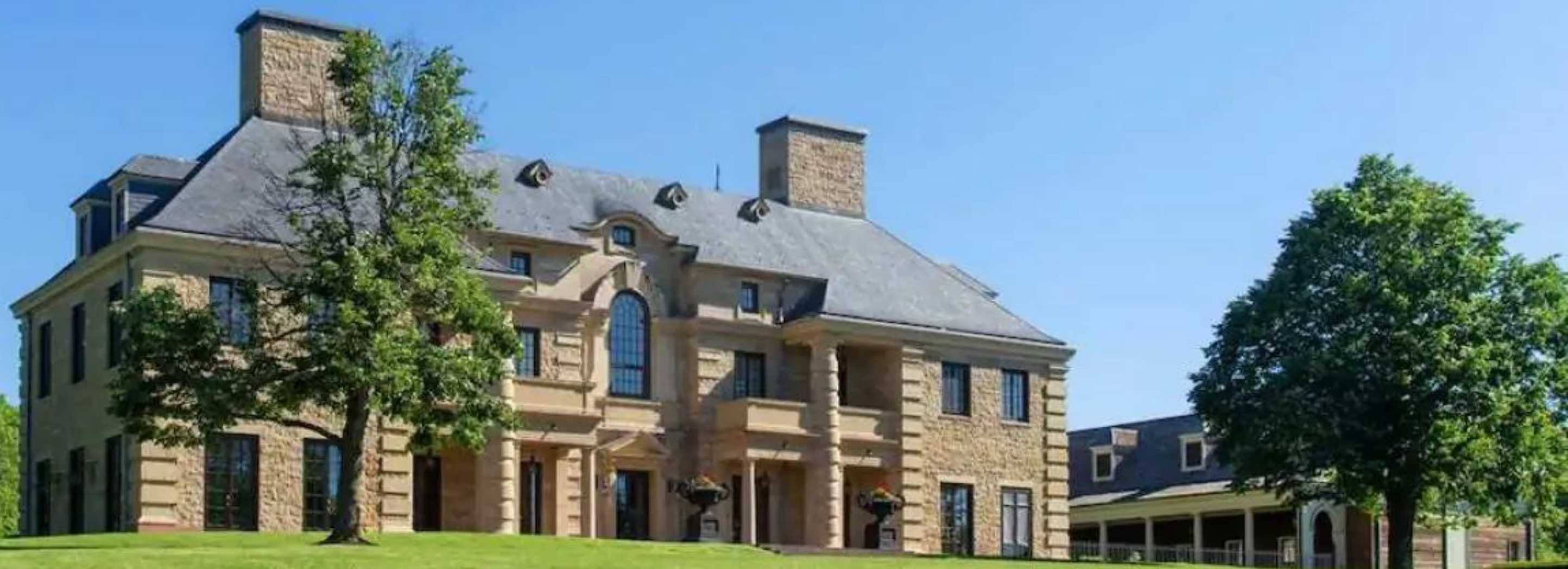
VILLA ELIZABETH GOSHEN, LITCHFIELD