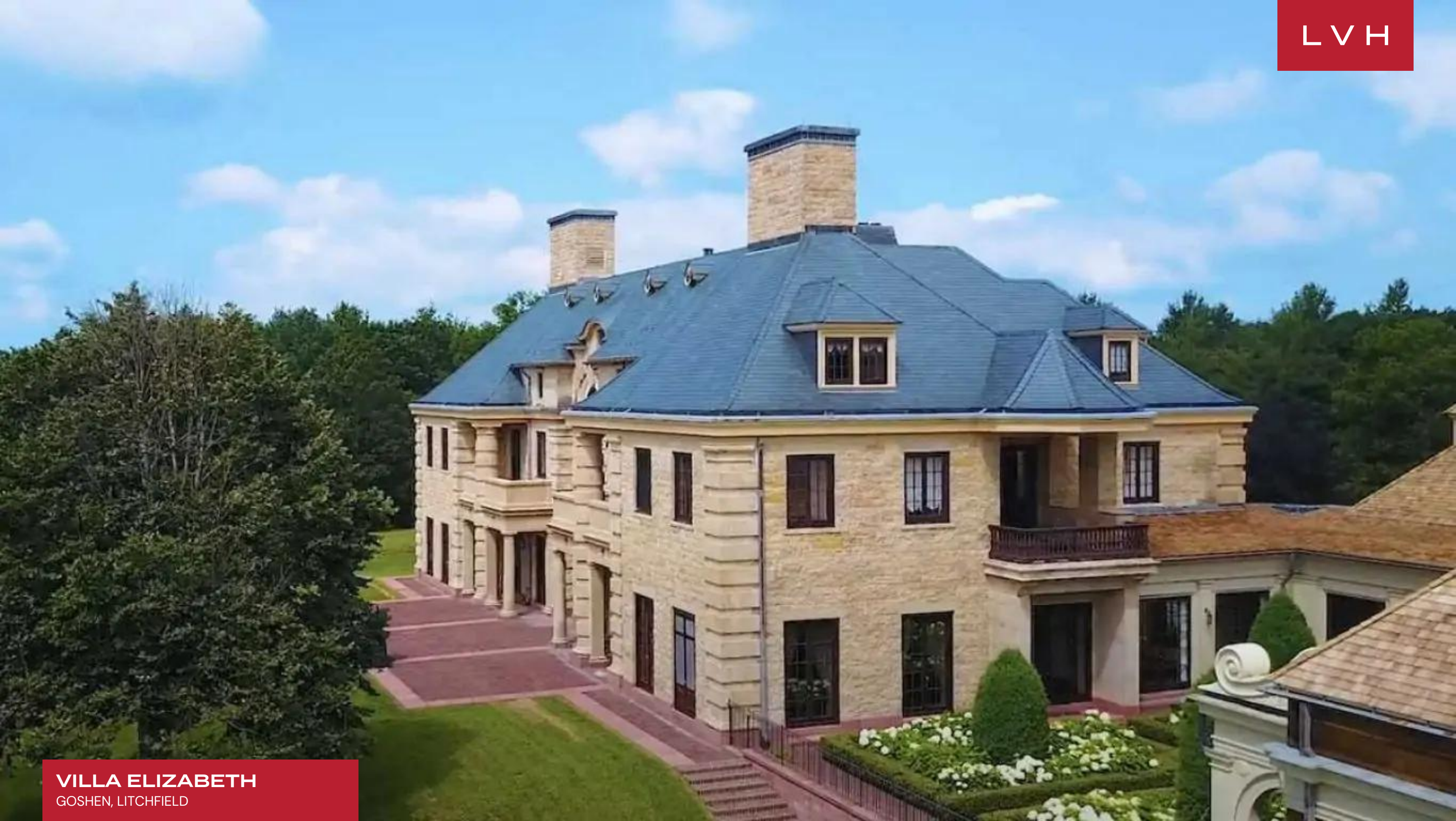
VILLA ELIZABETH GOSHEN, LITCHFIELD