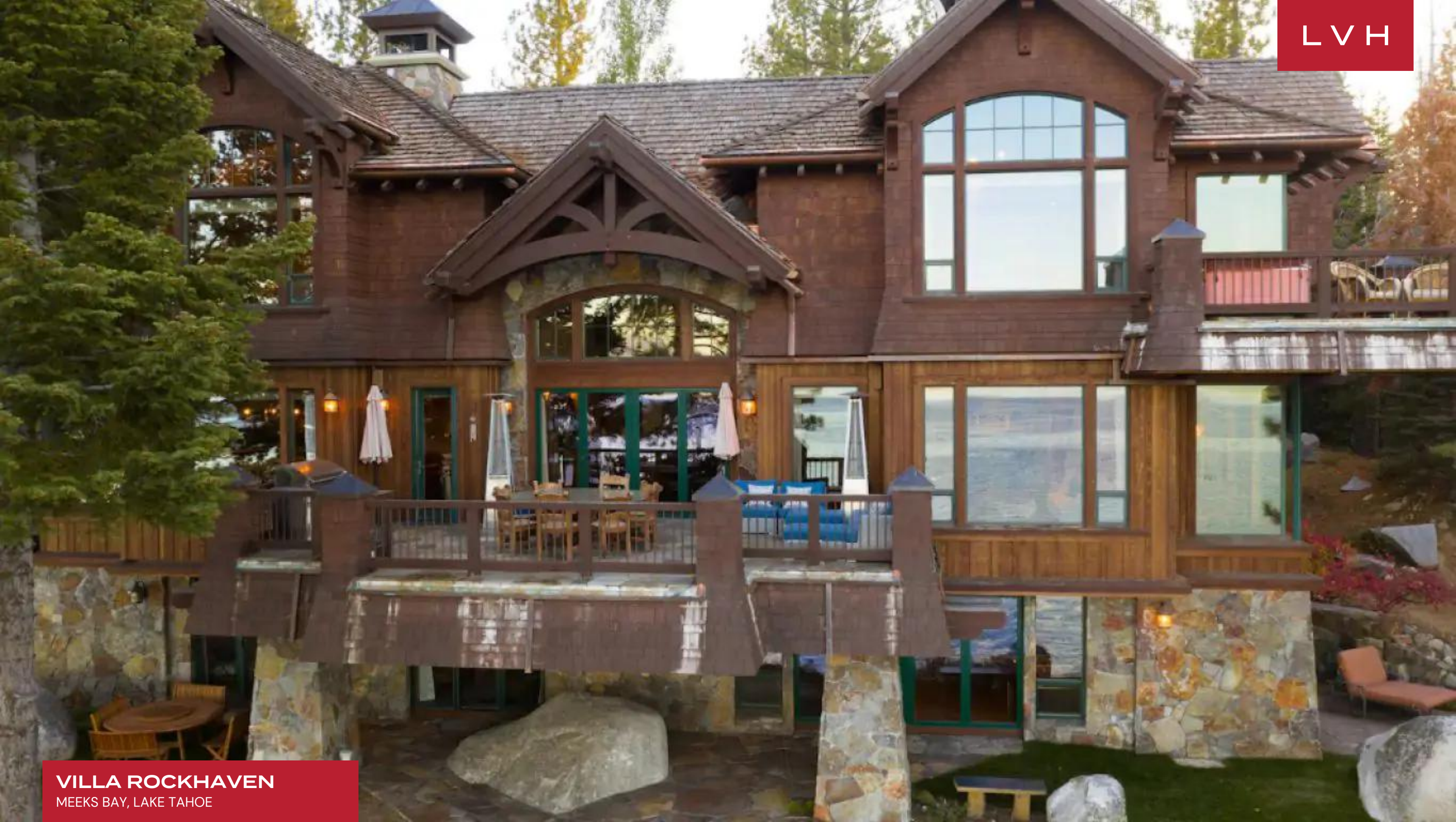
VILLA ROCKHAVEN MEEKS BAY, LAKE TAHOE