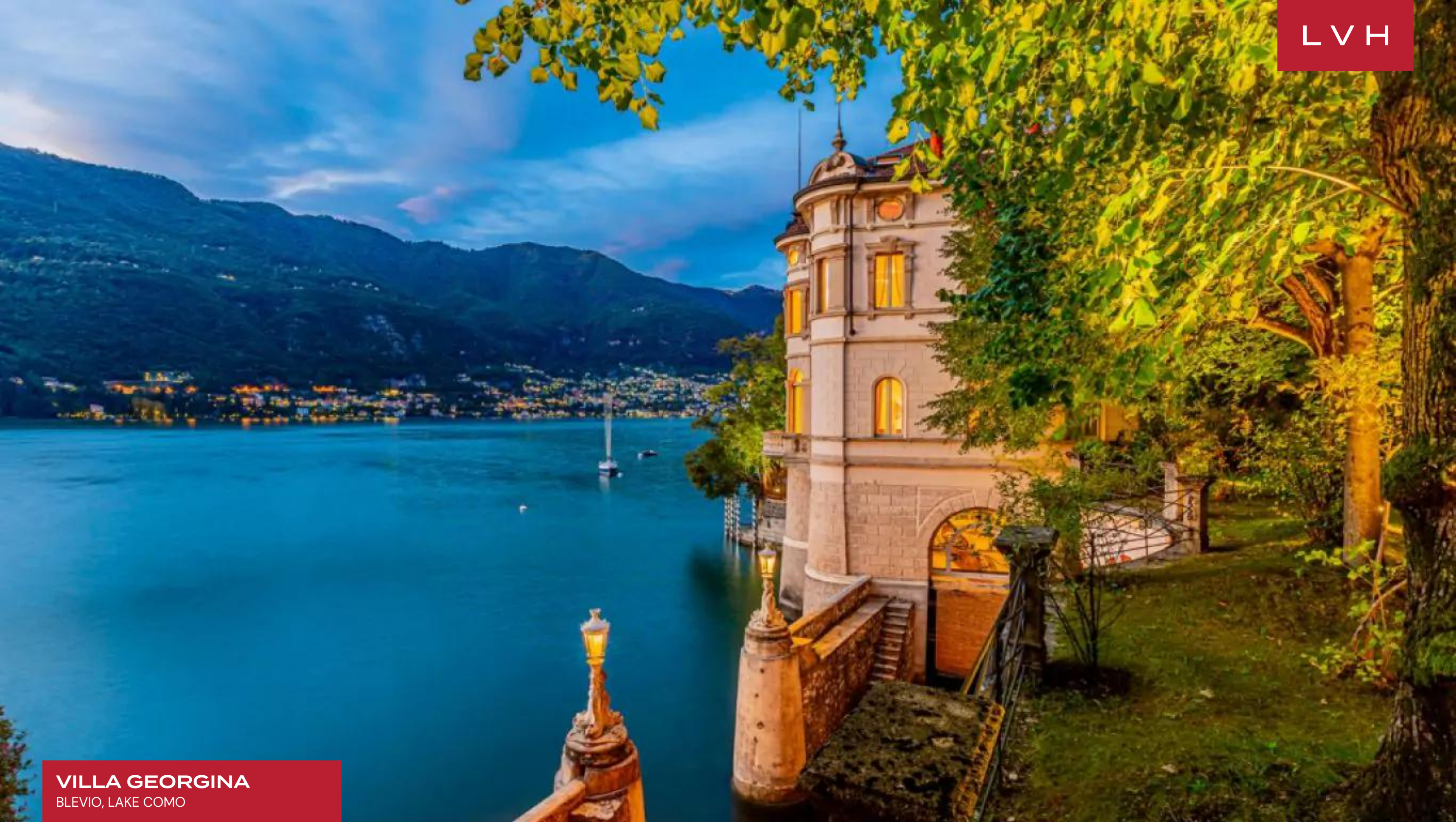
VILLA GEORGINA BLEVIO, LAKE COMO