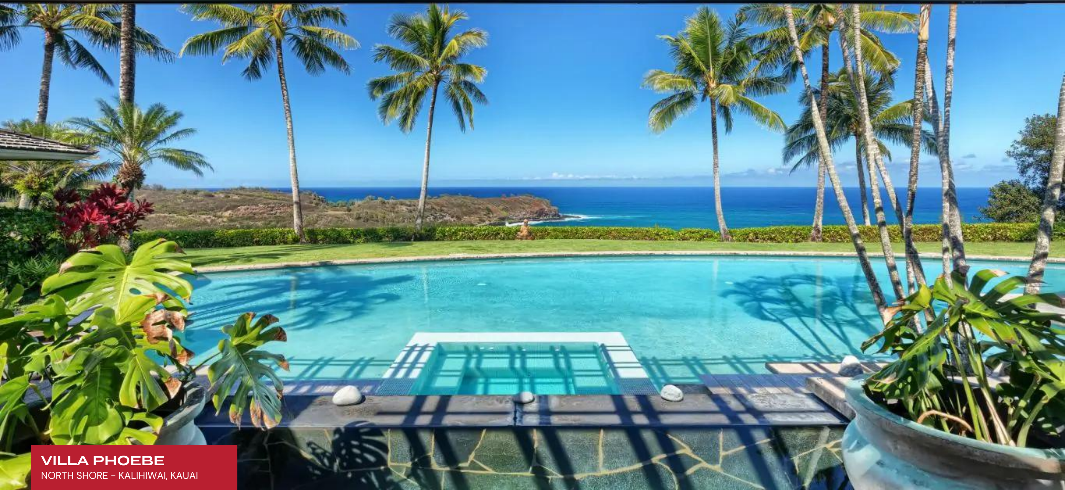
VILLA PHOEBE NORTH SHORE - KALIHIWAI, KAUAI