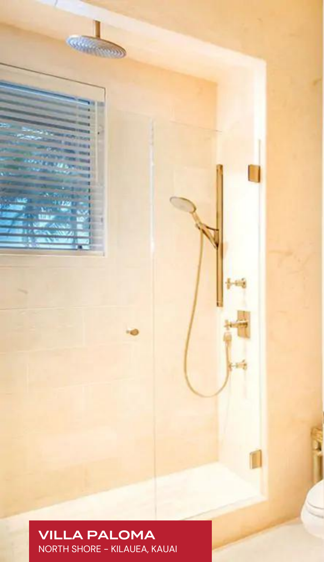
VILLA PALOMA NORTH SHORE - KILAUEA, KAUAI