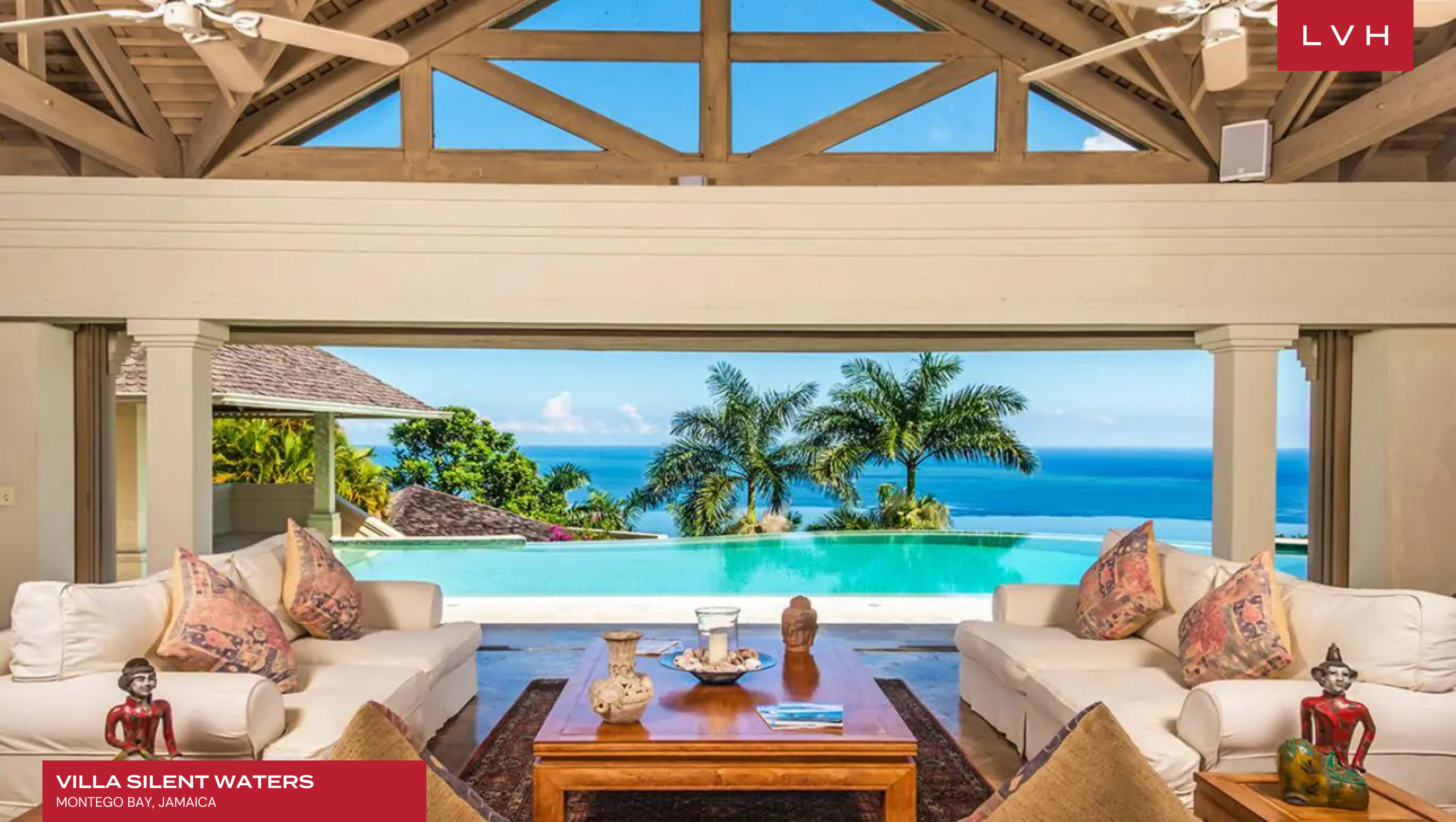
VILLA SILENT WATERS MONTEGO BAY, JAMAICA