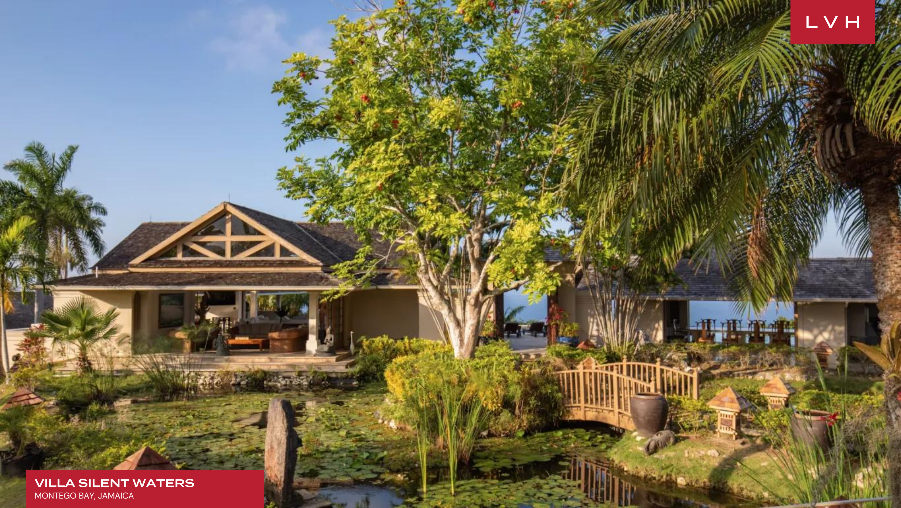
VILLA SILENT WATERS MONTEGO BAY, JAMAICA