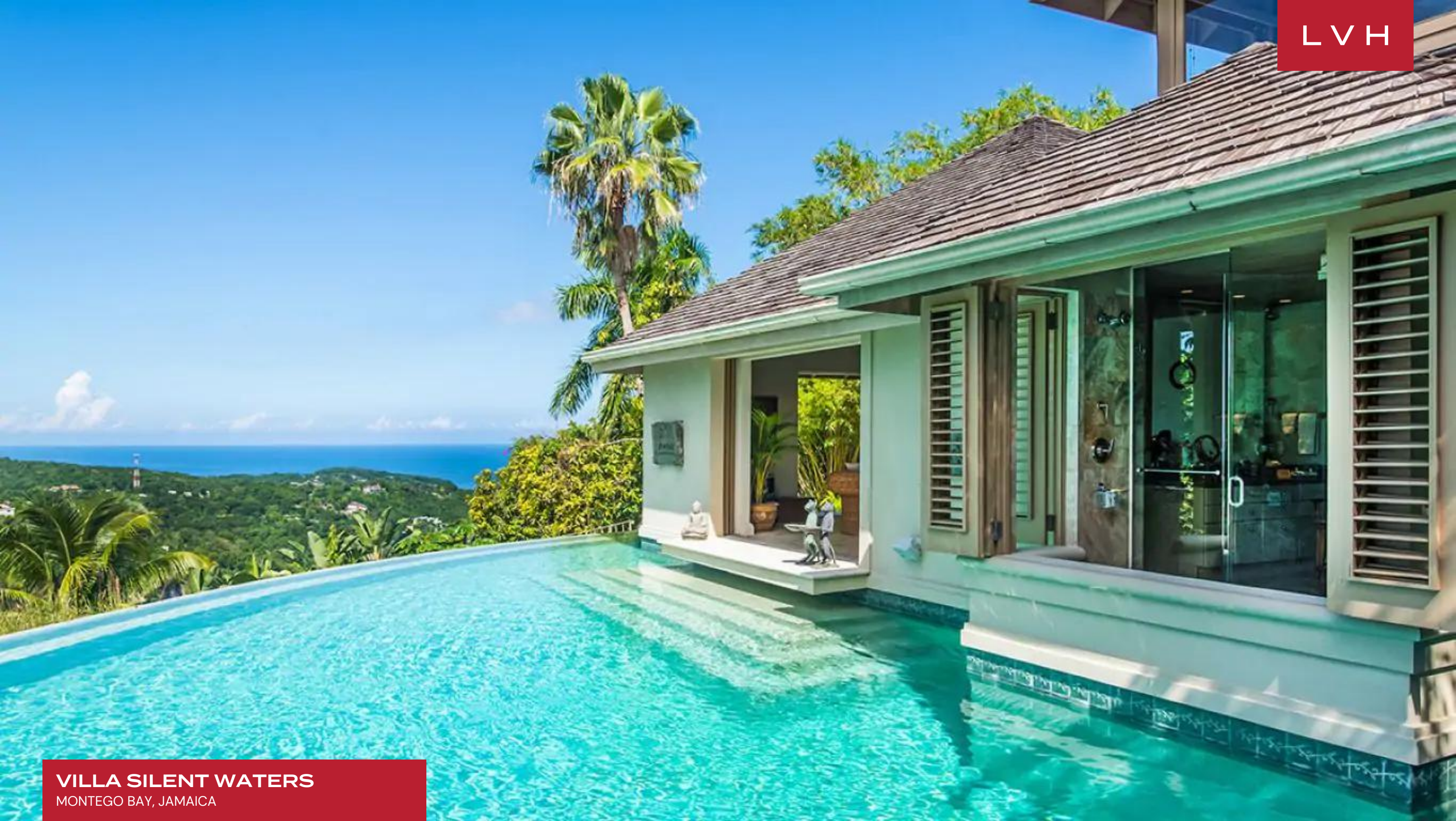
VILLA SILENT WATERS MONTEGO BAY, JAMAICA