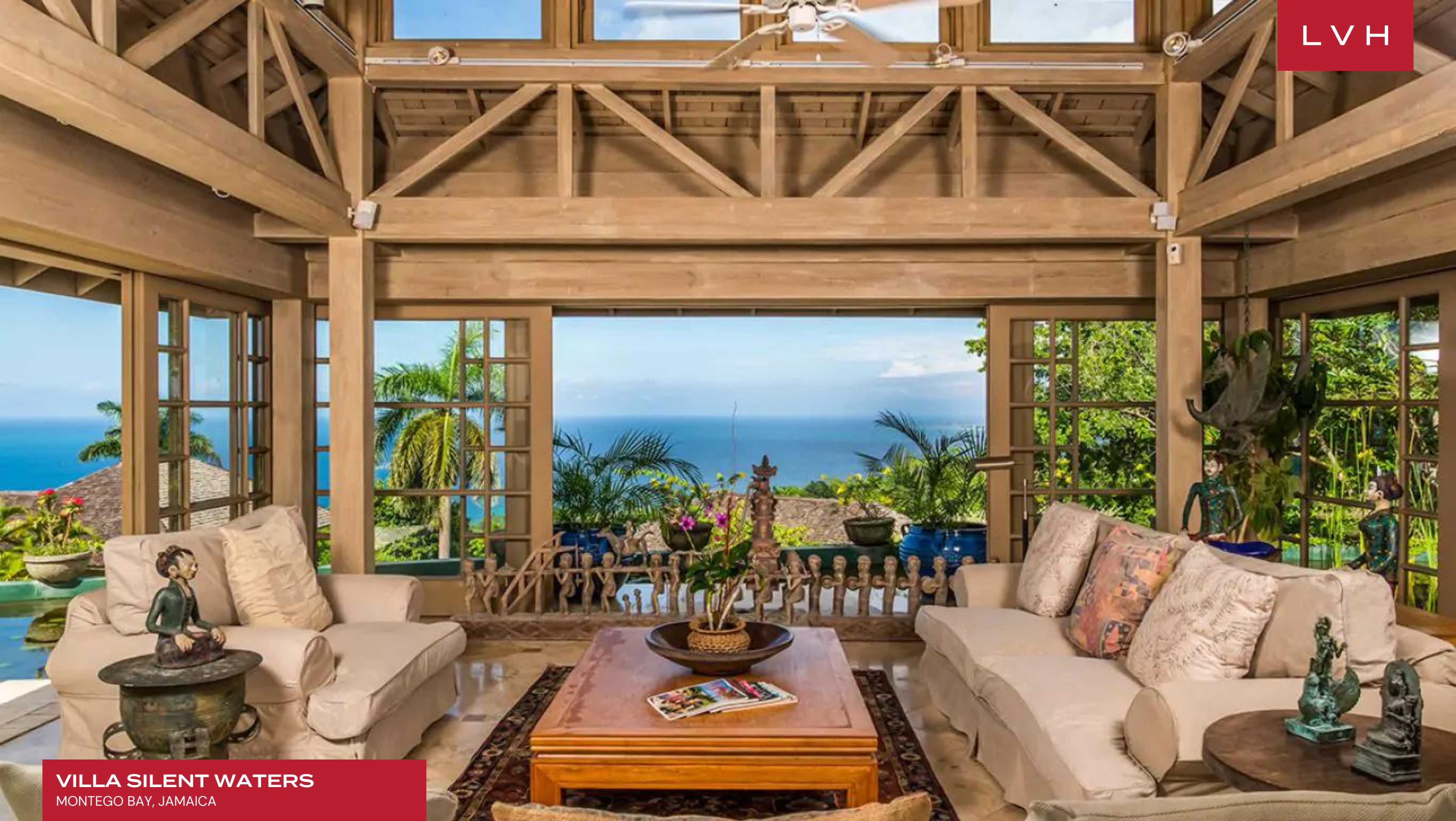
VILLA SILENT WATERS MONTEGO BAY, JAMAICA