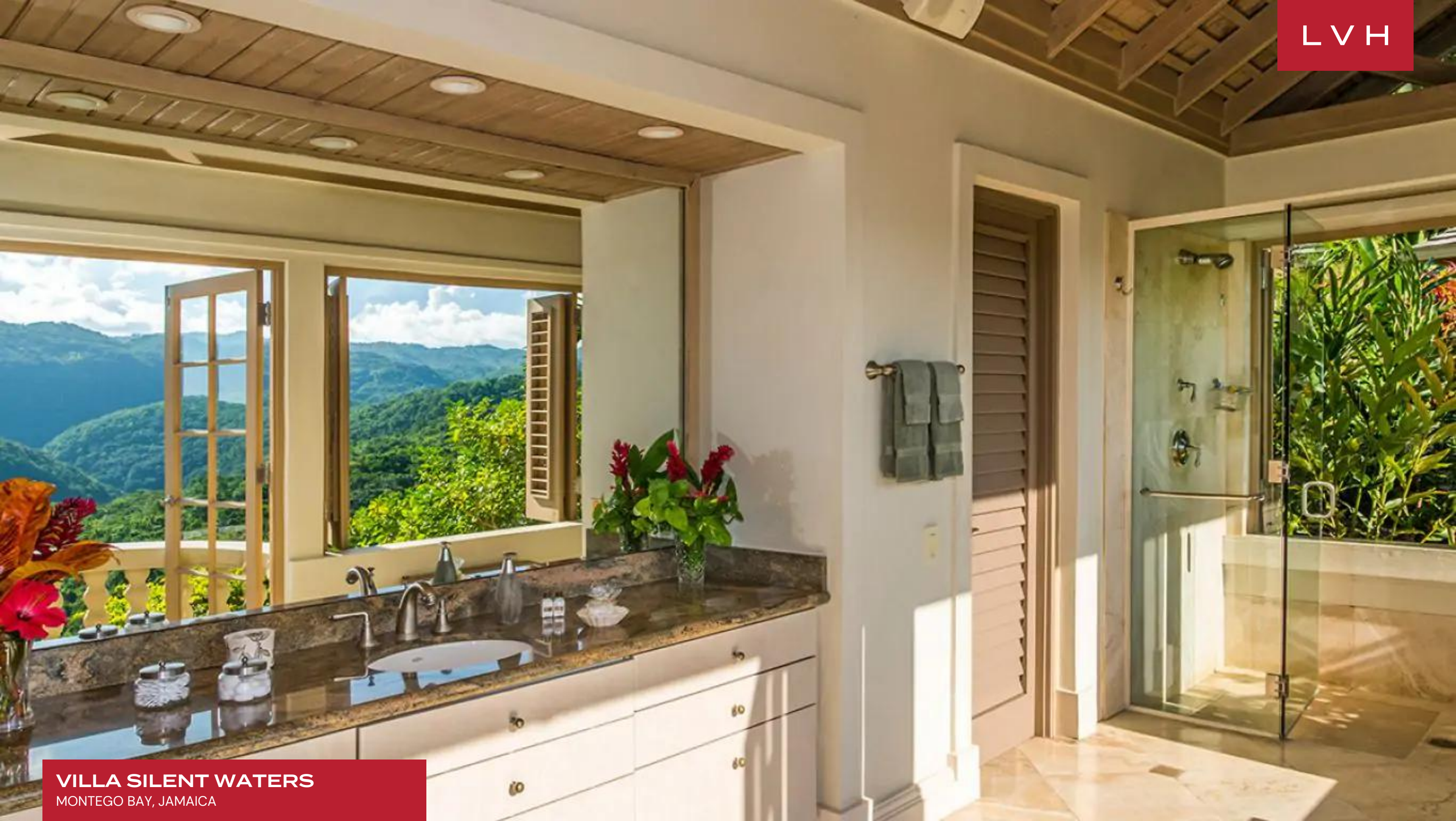
VILLA SILENT WATERS MONTEGO BAY, JAMAICA