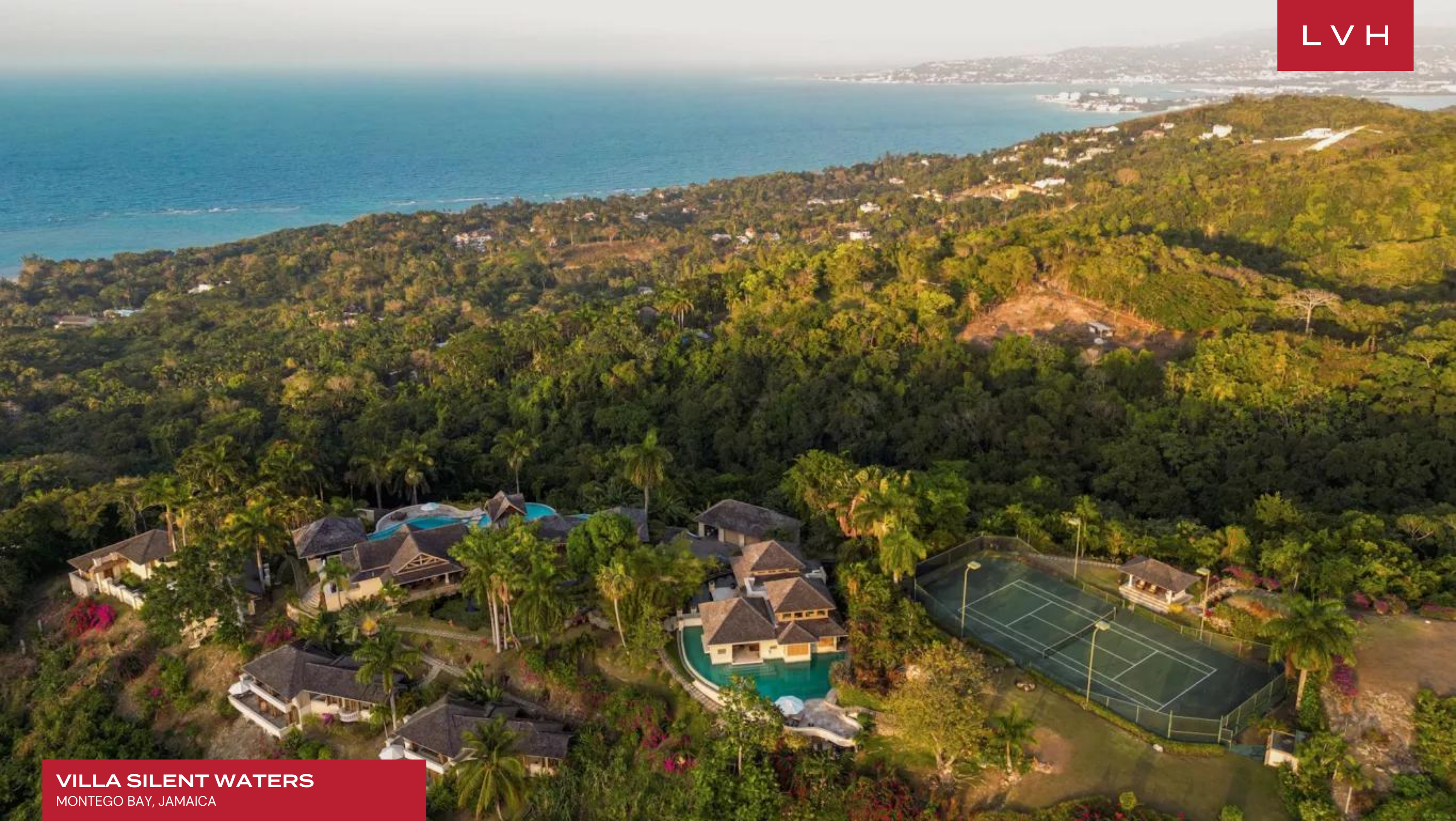
VILLA SILENT WATERS MONTEGO BAY, JAMAICA