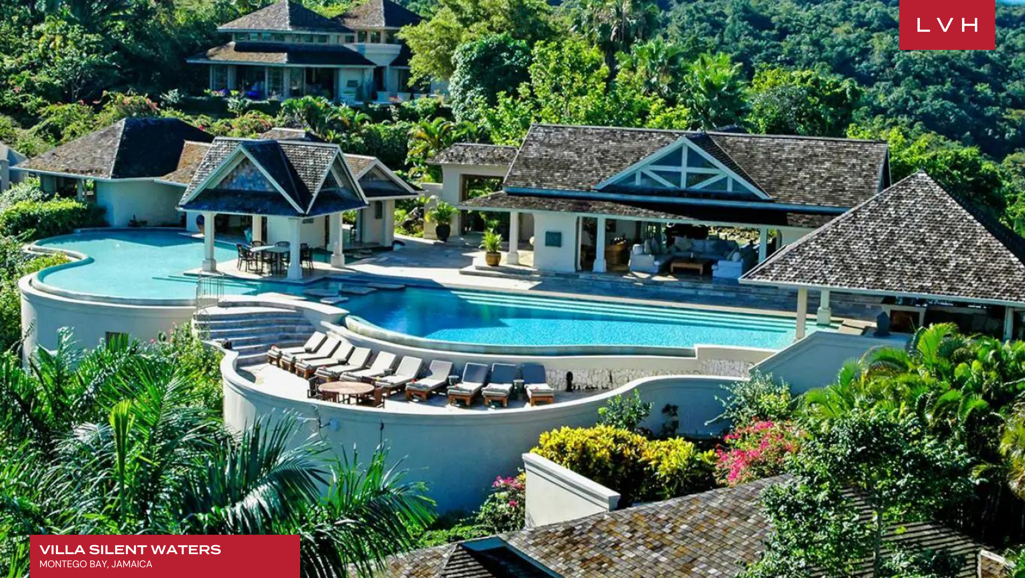
VILLA SILENT WATERS MONTEGO BAY, JAMAICA