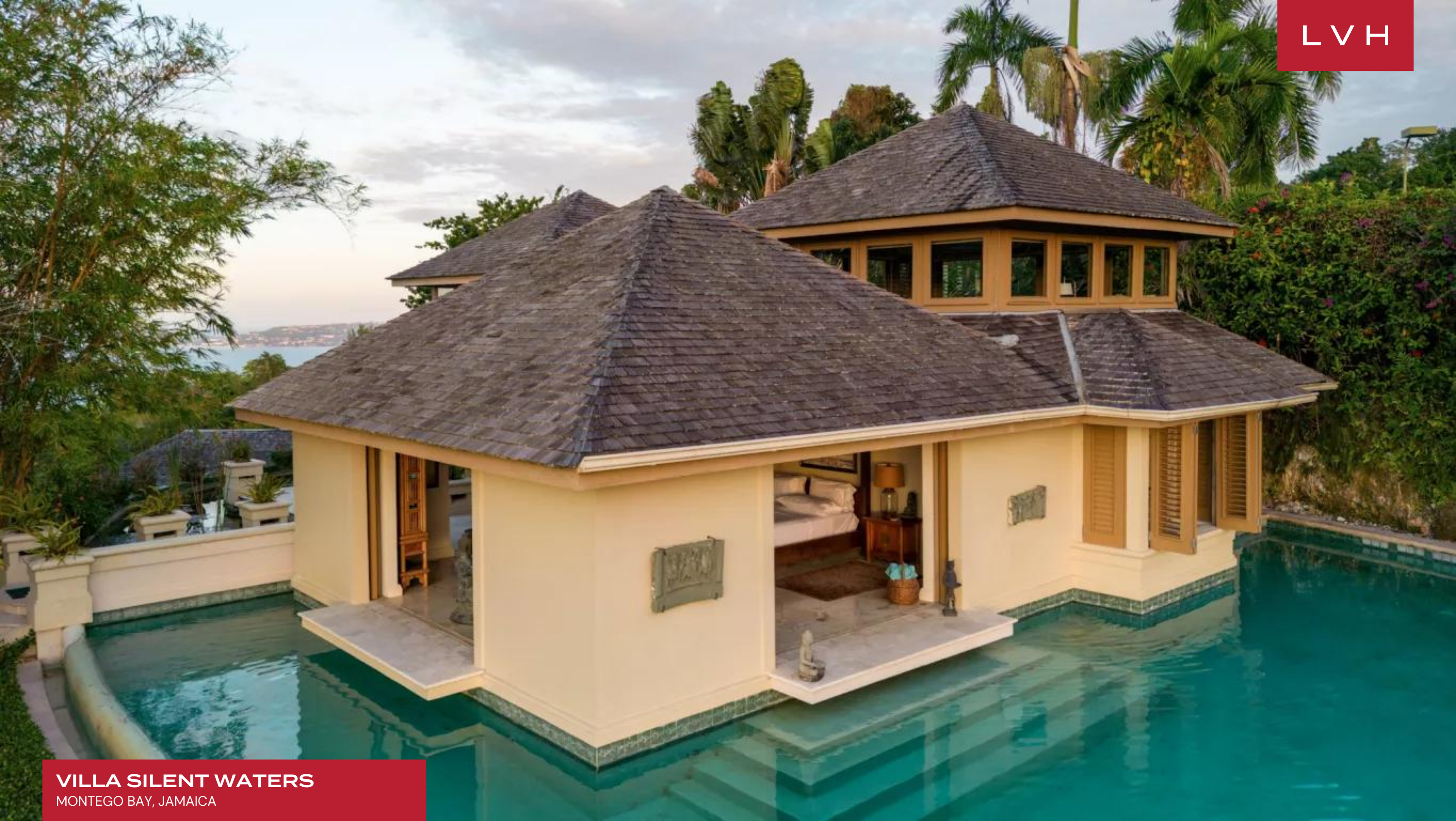
VILLA SILENT WATERS MONTEGO BAY, JAMAICA