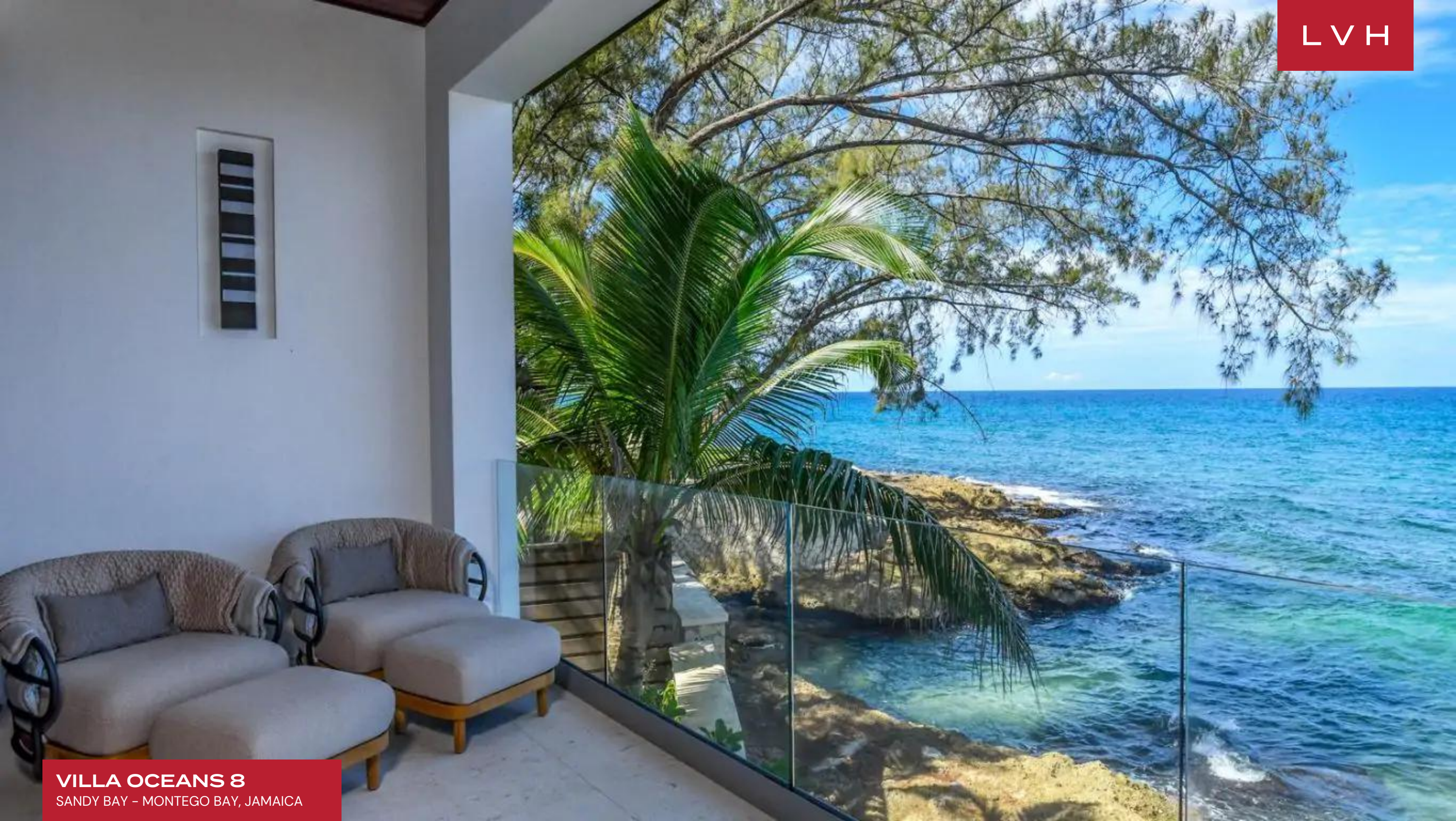
VILLA OCEANS 8 SANDY BAY - MONTEGO BAY, JAMAICA