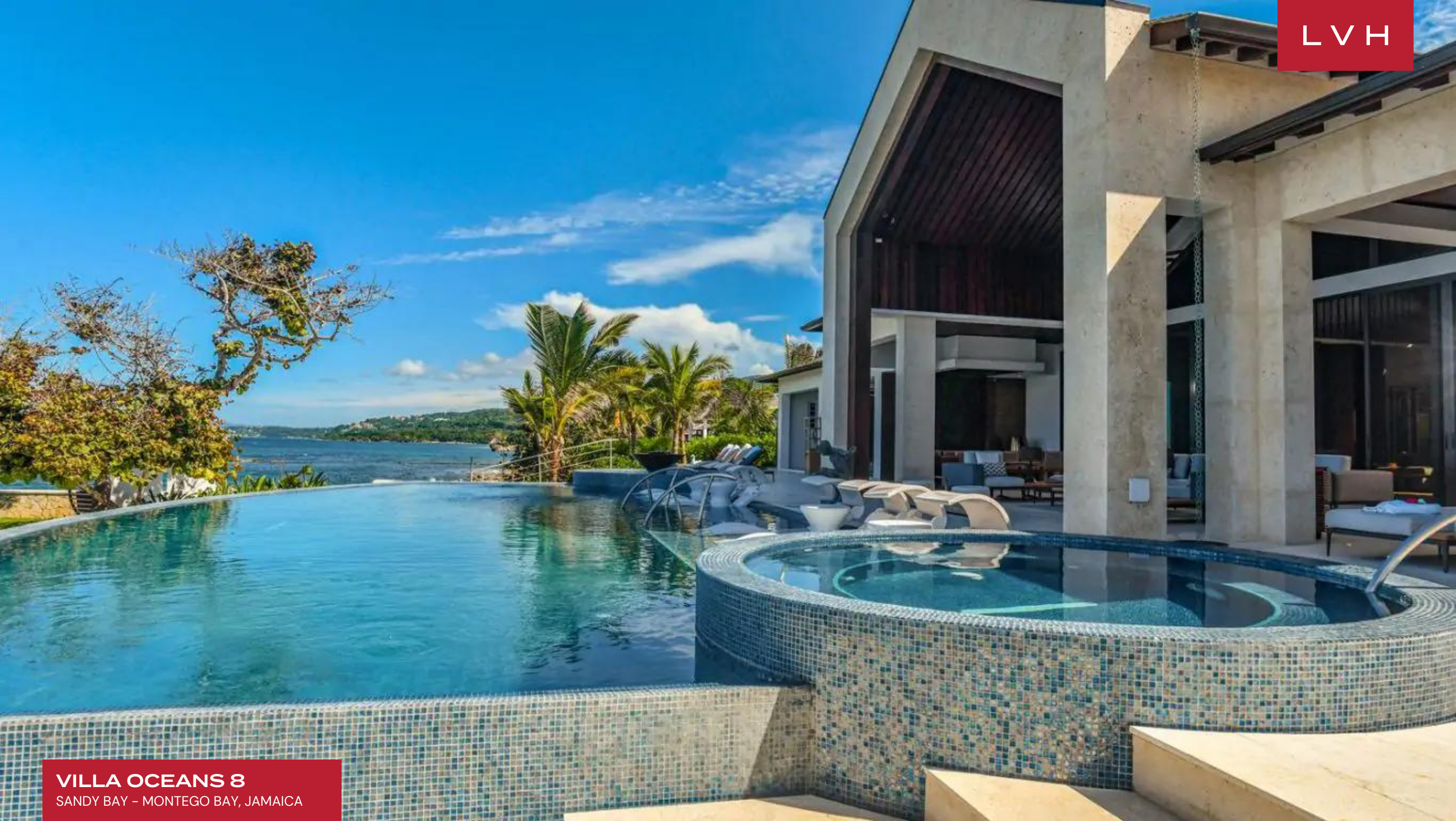
VILLA OCEANS 8 SANDY BAY - MONTEGO BAY, JAMAICA