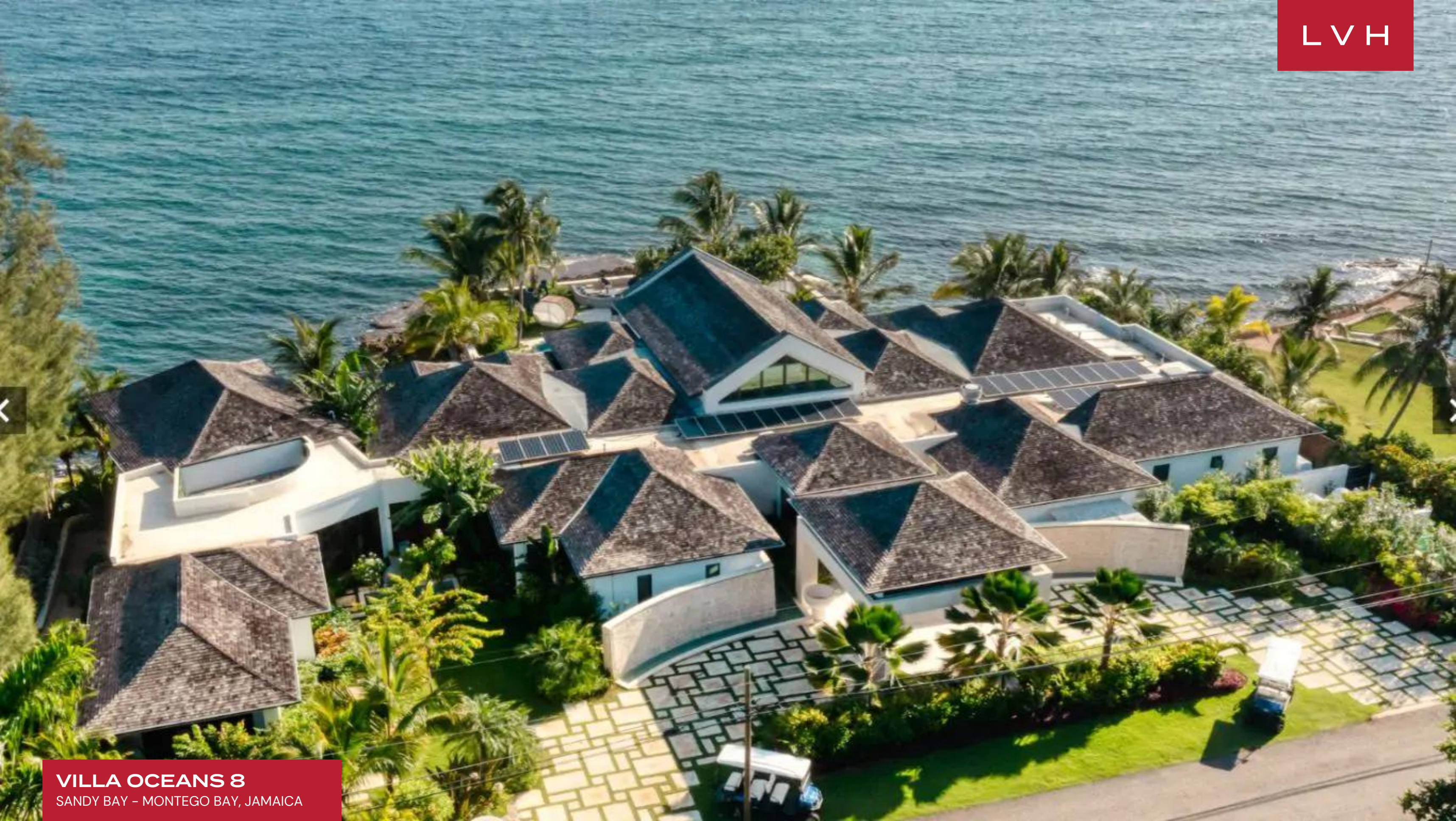
VILLA OCEANS 8 SANDY BAY - MONTEGO BAY, JAMAICA