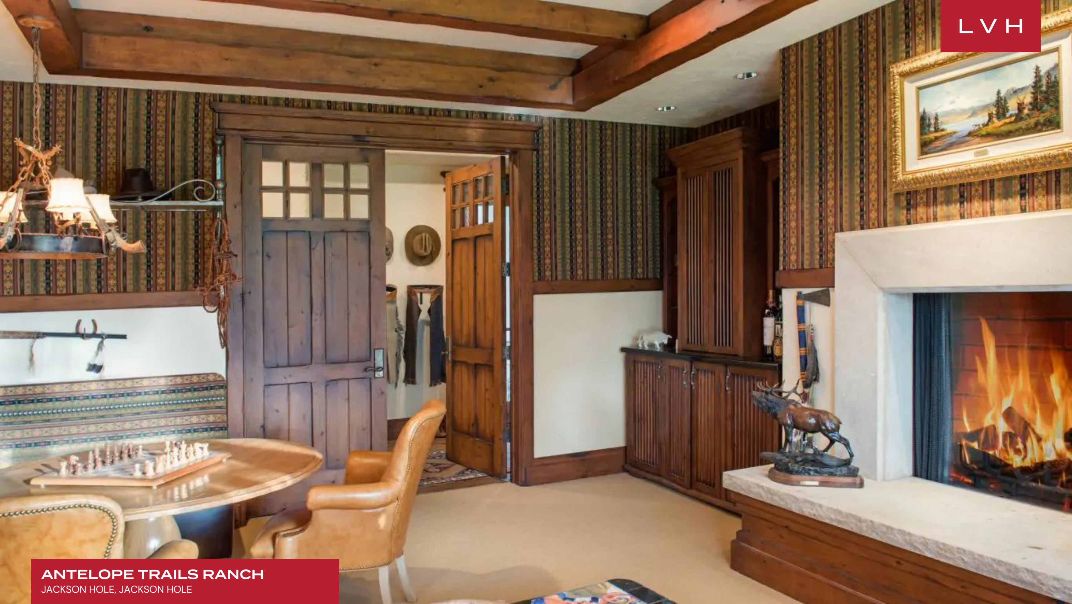
ANTELOPE TRAILS RANCH JACKSON HOLE, JACKSON HOLE