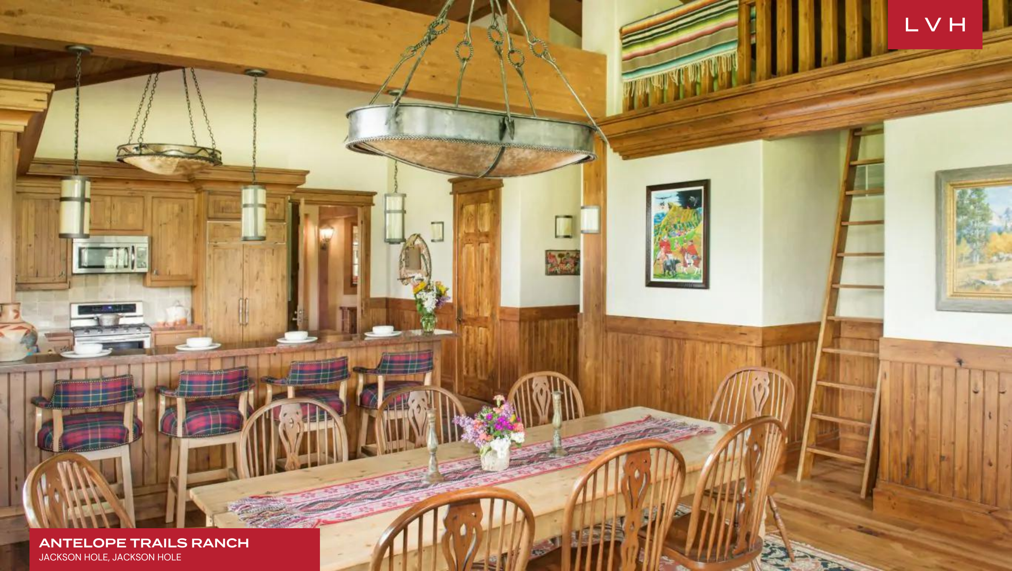
ANTELOPE TRAILS RANCH JACKSON HOLE, JACKSON HOLE