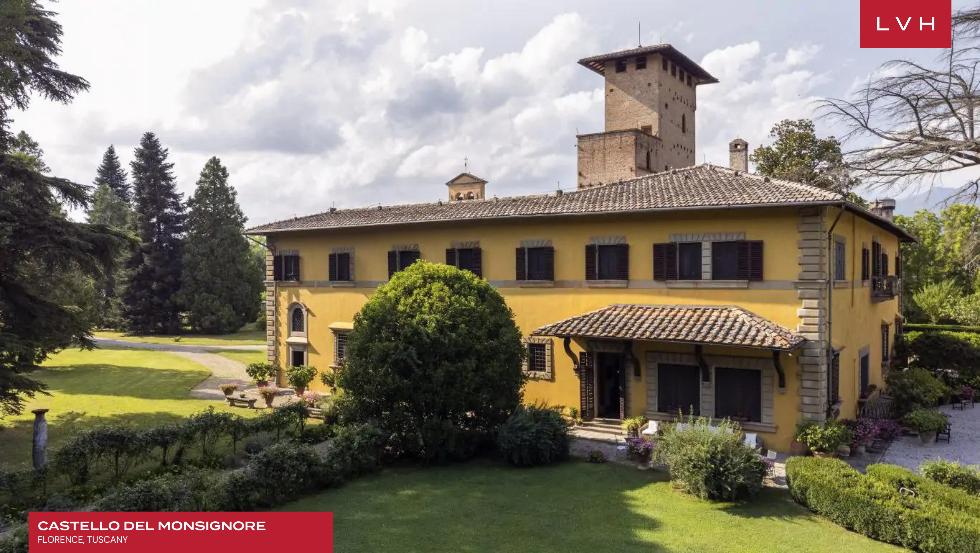
CASTELLO DEL MONSIGNORE FLORENCE, TUSCANY