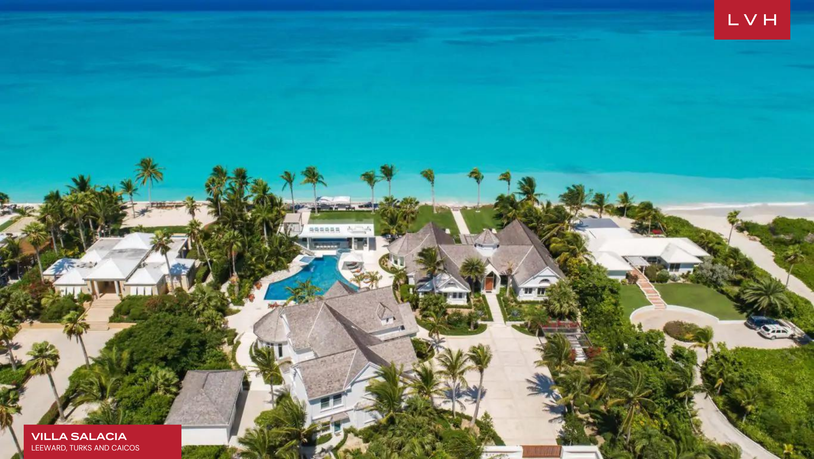
VILLA SALACIA LEEWARD, TURKS AND CAICOS