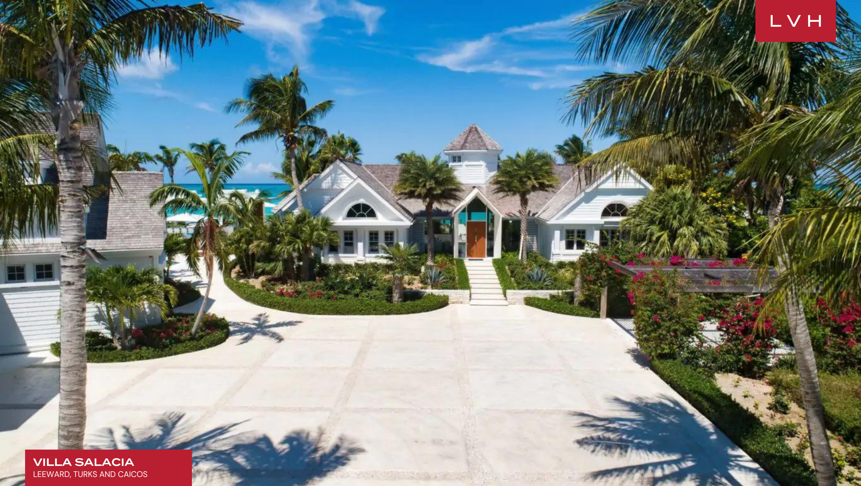
VILLA SALACIA LEEWARD, TURKS AND CAICOS