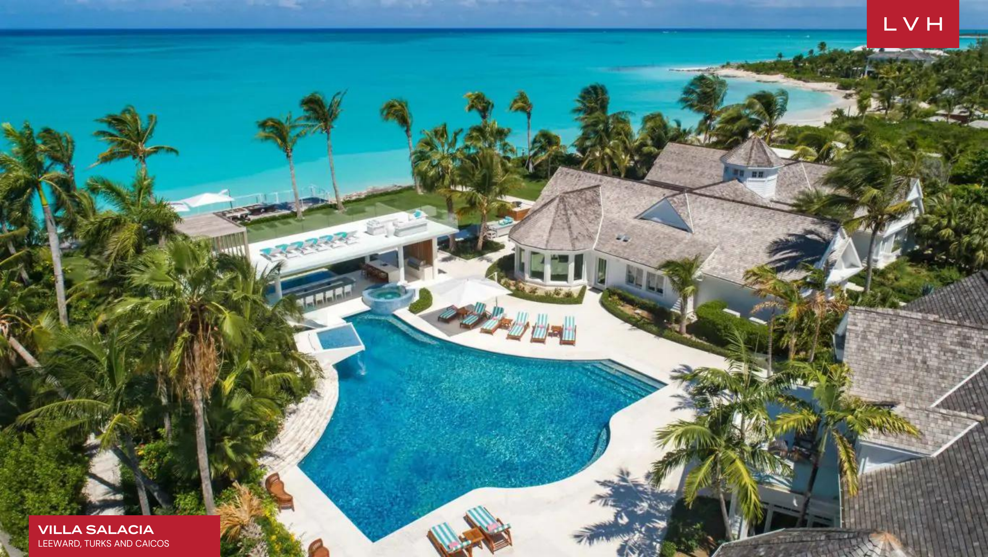
VILLA SALACIA LEEWARD, TURKS AND CAICOS