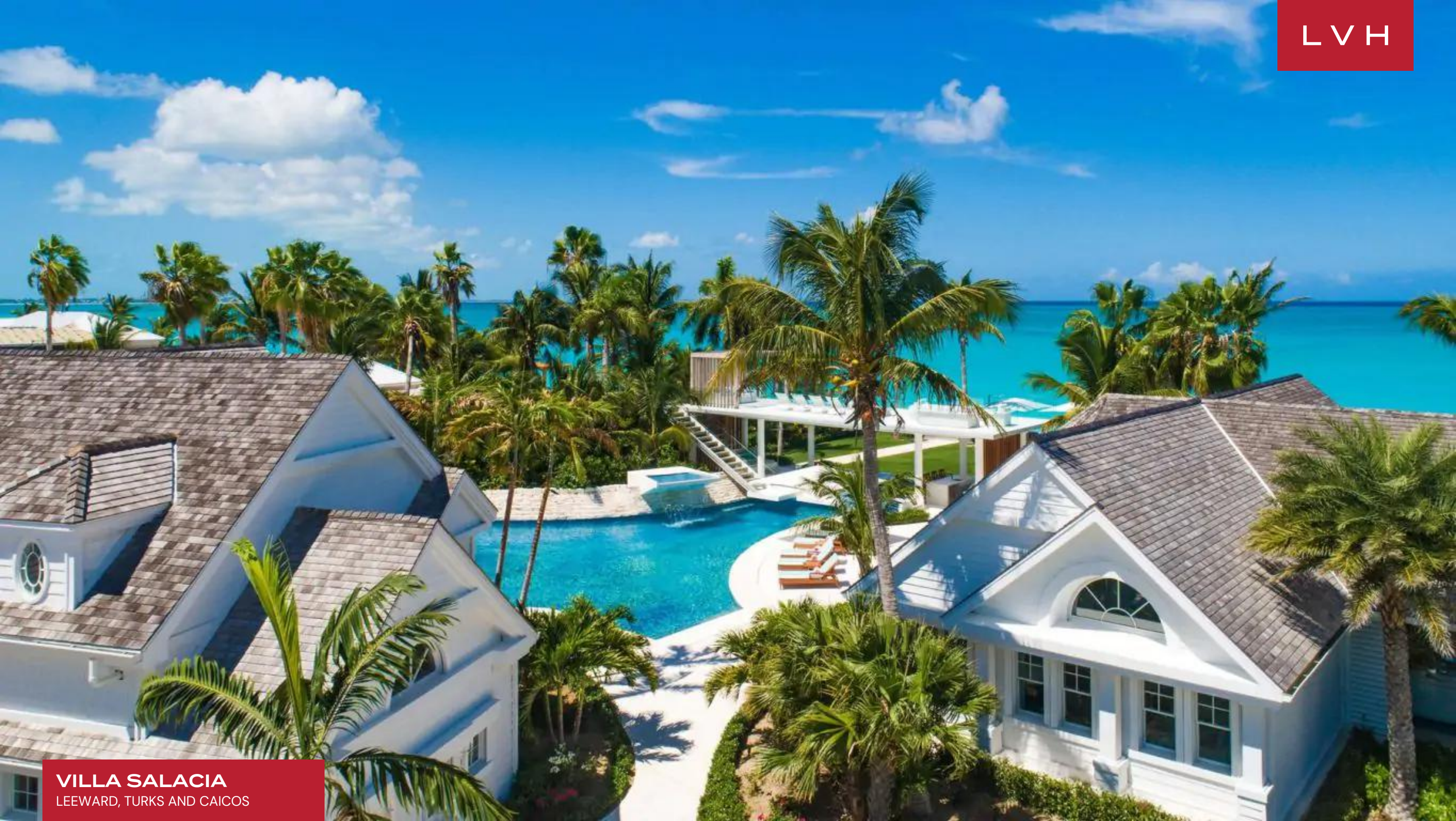
VILLA SALACIA LEEWARD, TURKS AND CAICOS