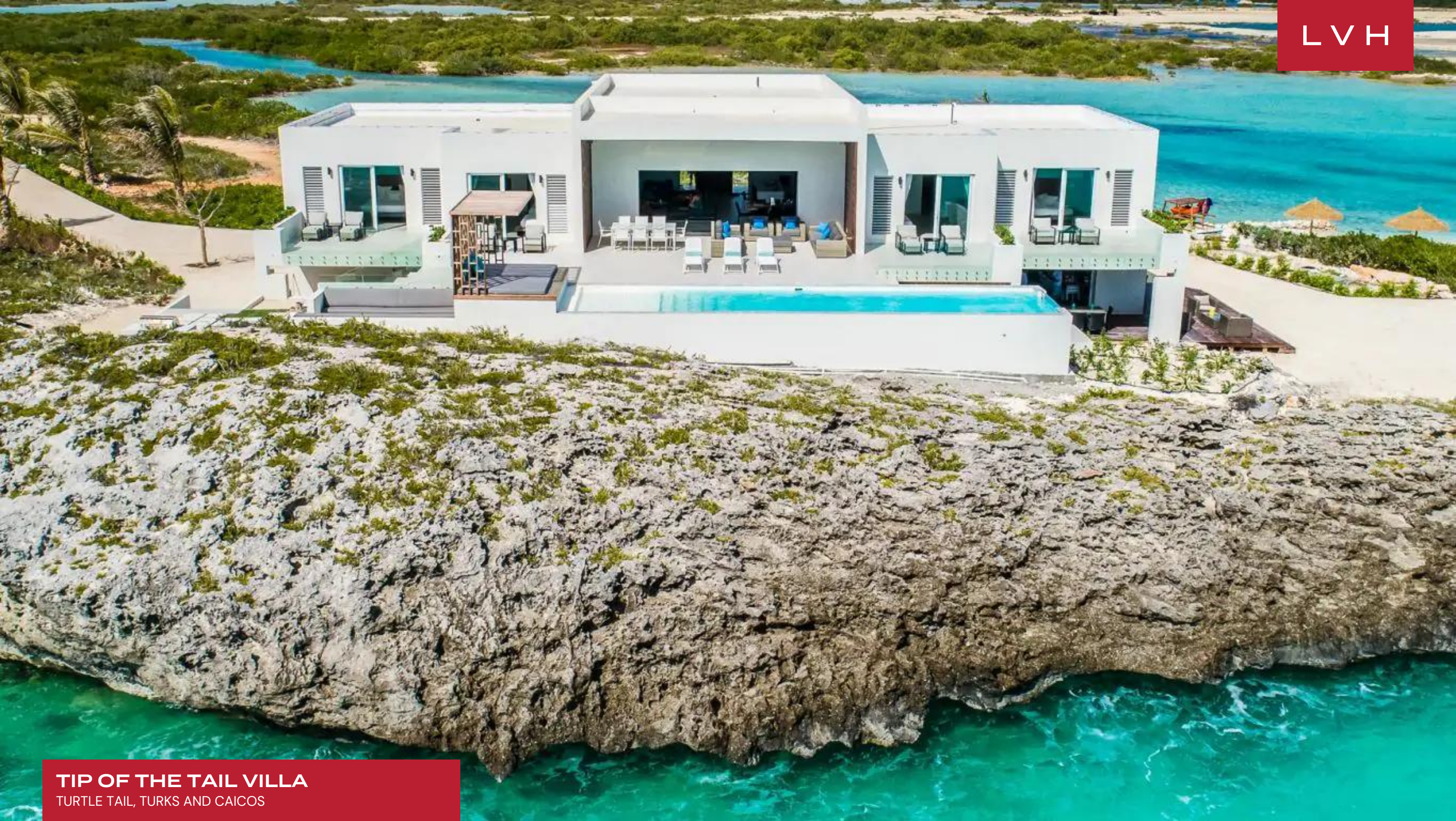
TIP OF THE TAIL VILLA TURTLE TAIL, TURKS AND CAICOS