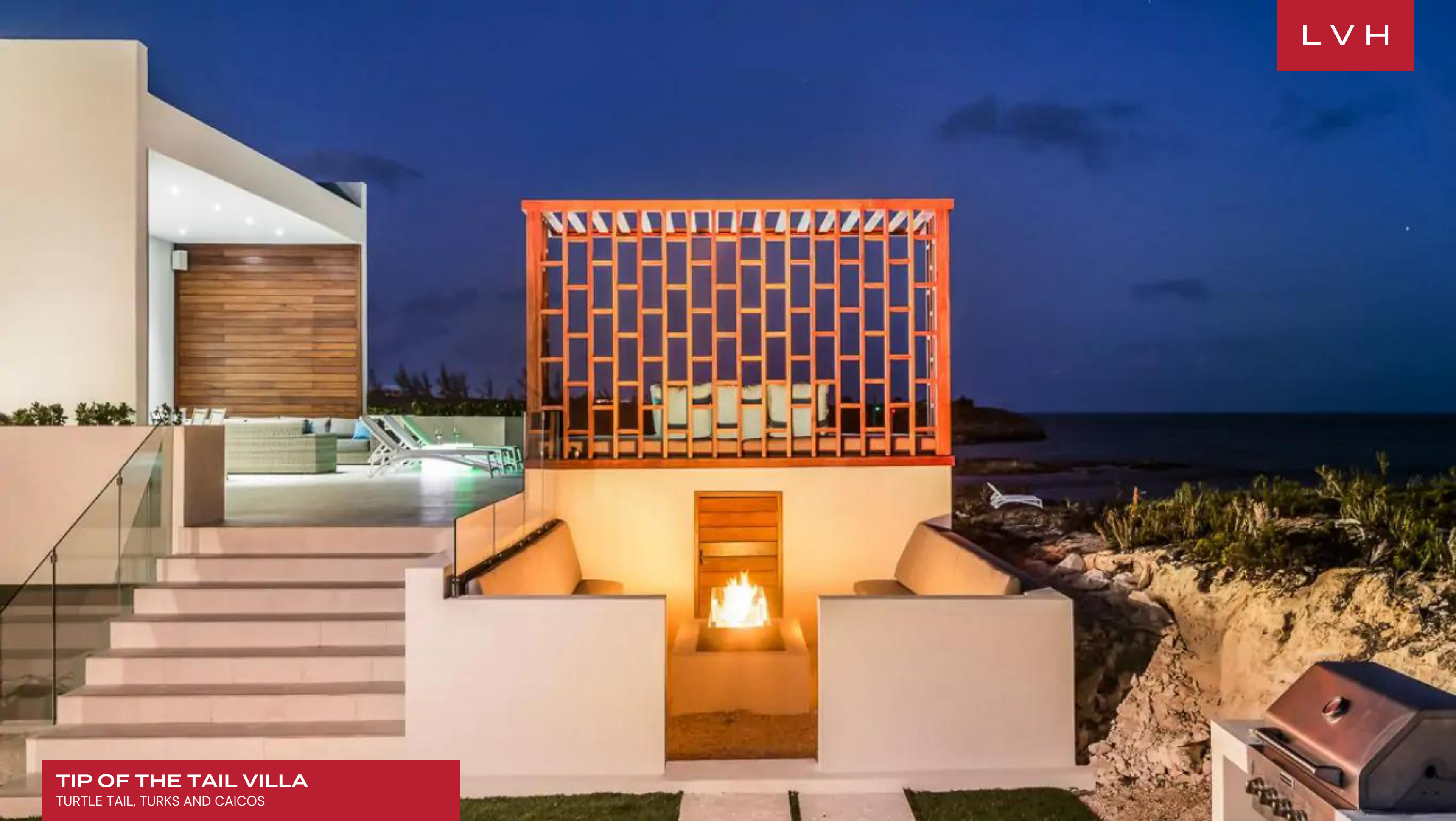
TIP OF THE TAIL VILLA TURTLE TAIL, TURKS AND CAICOS