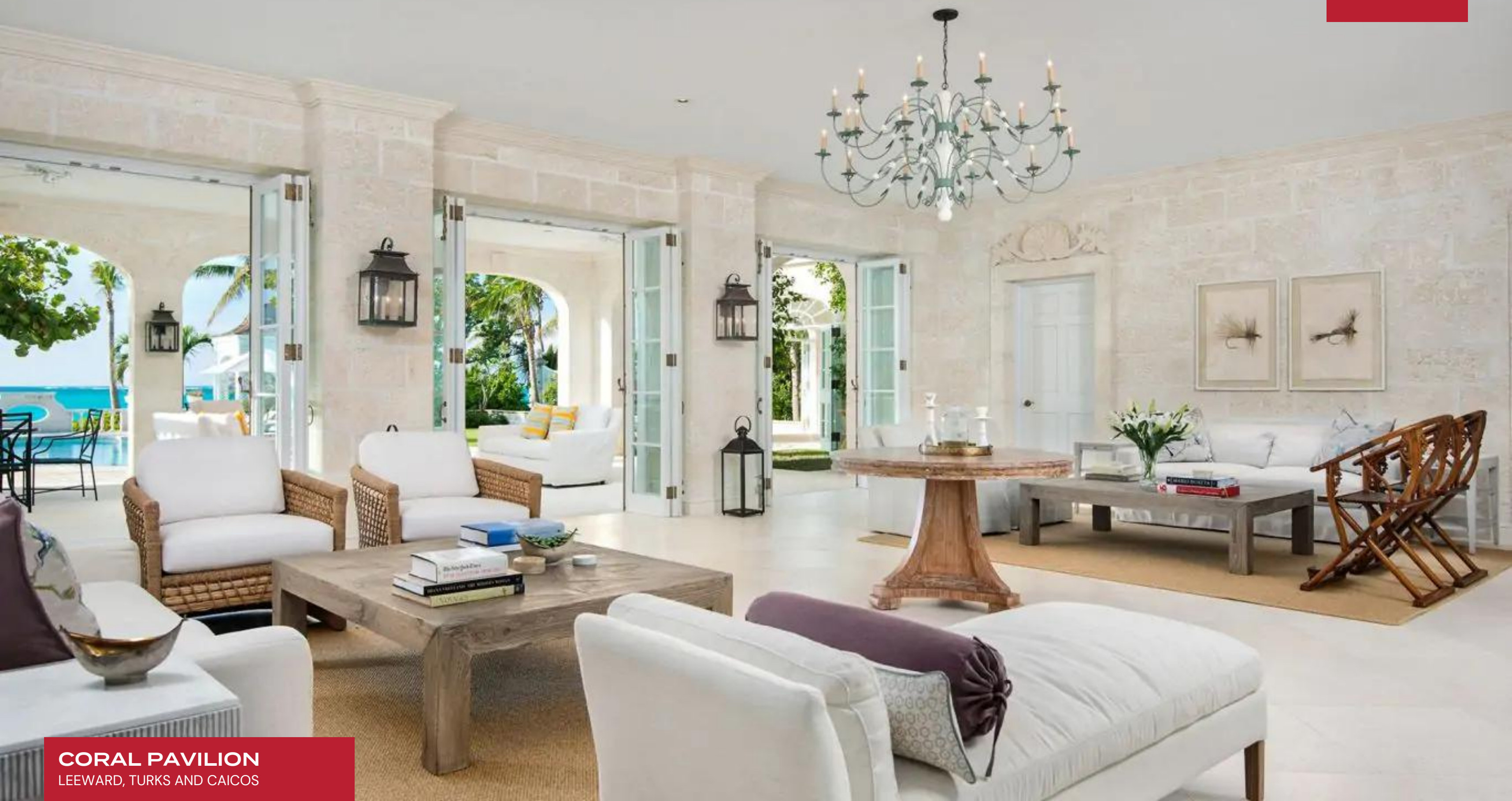
CORAL PAVILION LEEWARD, TURKS AND CAICOS