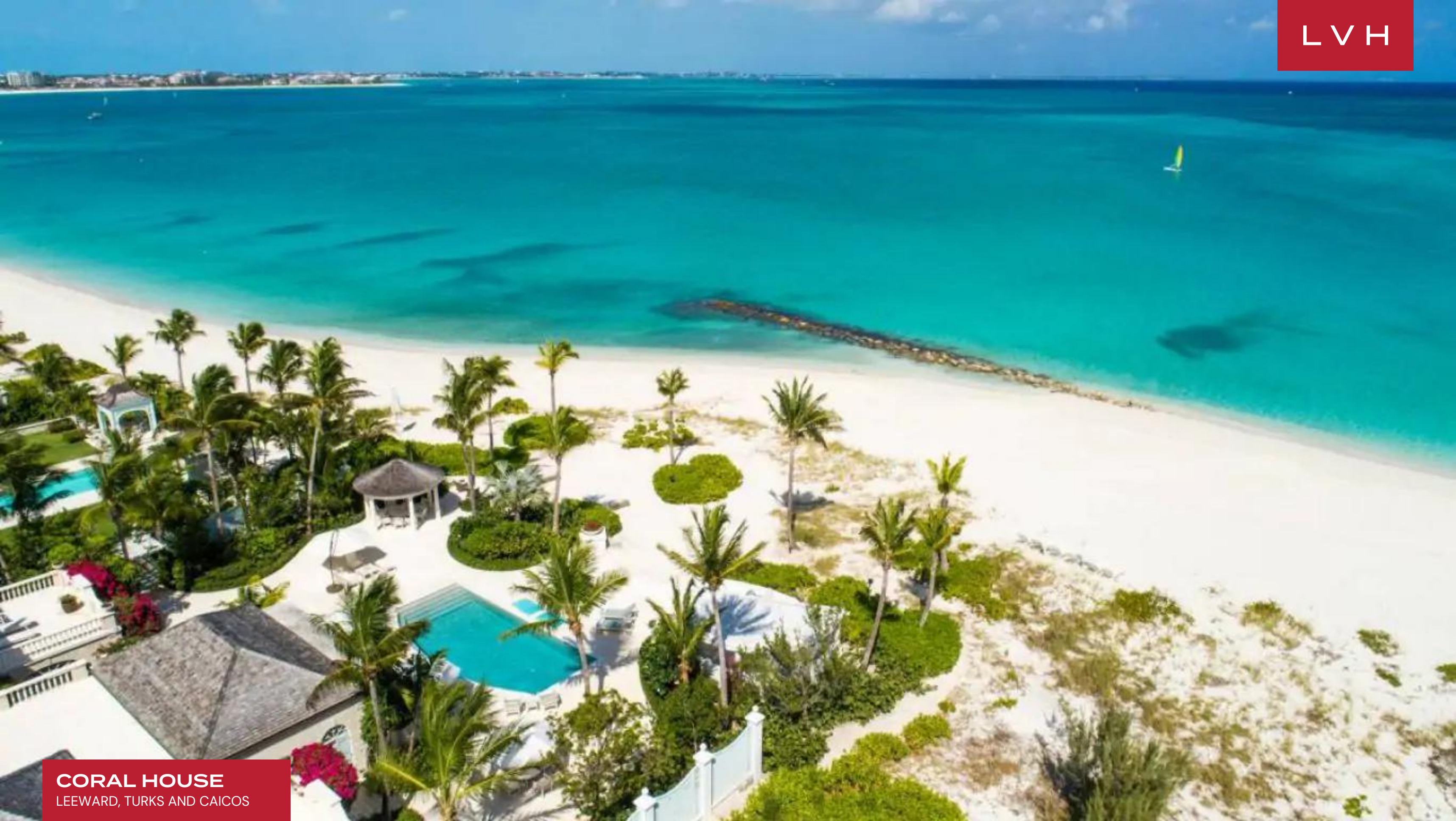
CORAL HOUSE LEEWARD, TURKS AND CAICOS