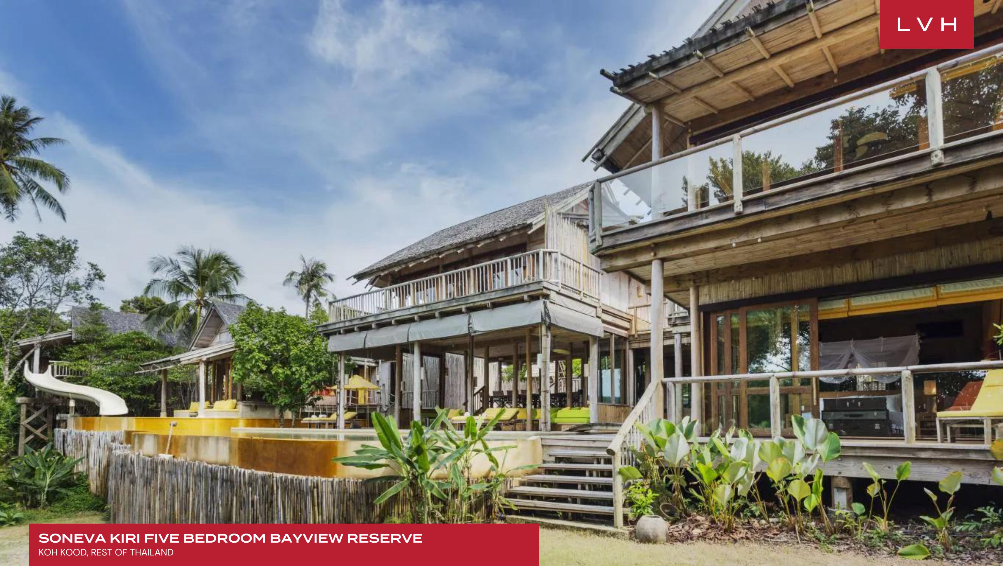
SONEVA KIRI FIVE BEDROOM BAYVIEW RESERVE KOH KOOD, REST OF THAILAND