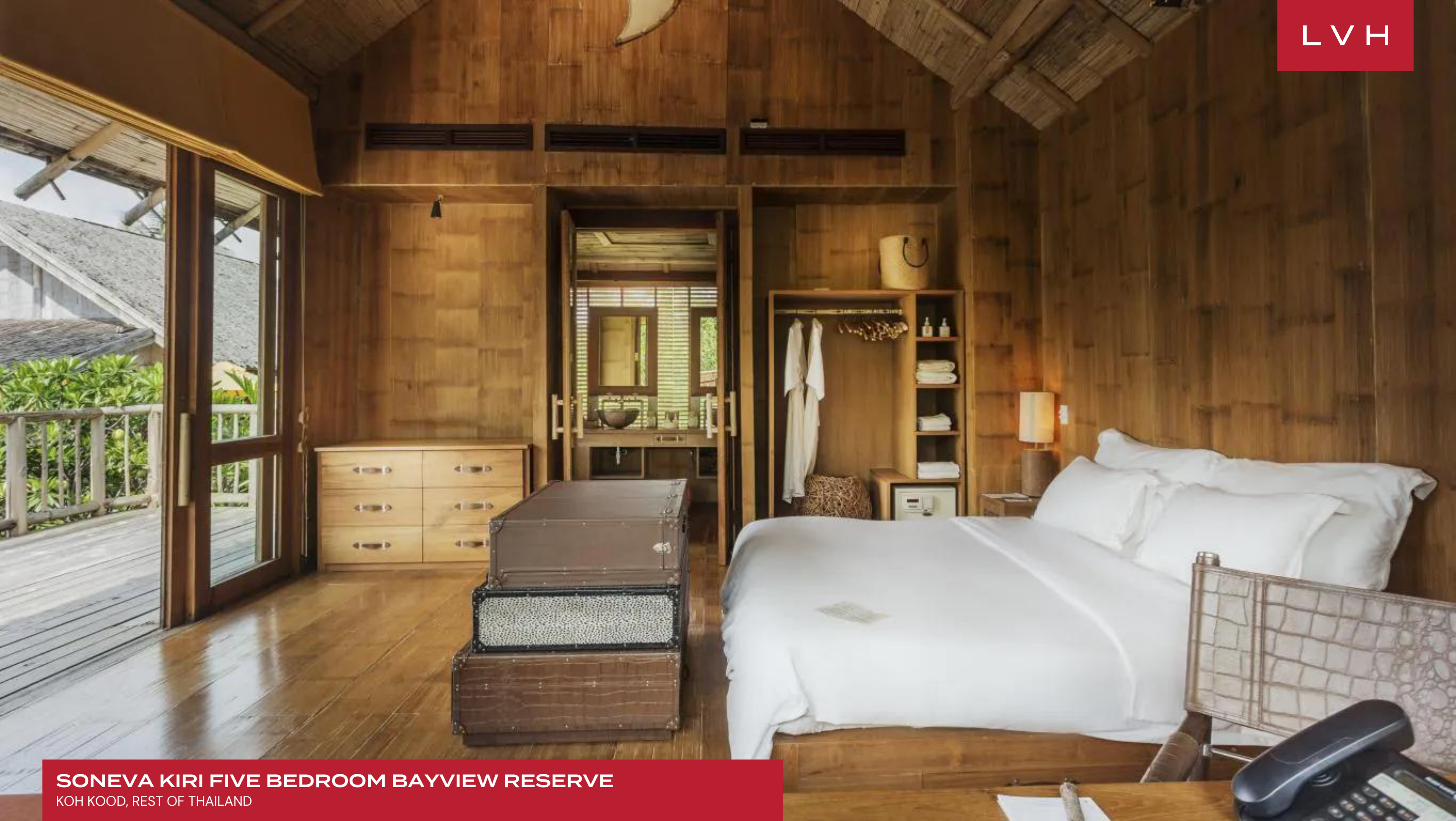
SONEVA KIRI FIVE BEDROOM BAYVIEW RESERVE KOH KOOD, REST OF THAILAND