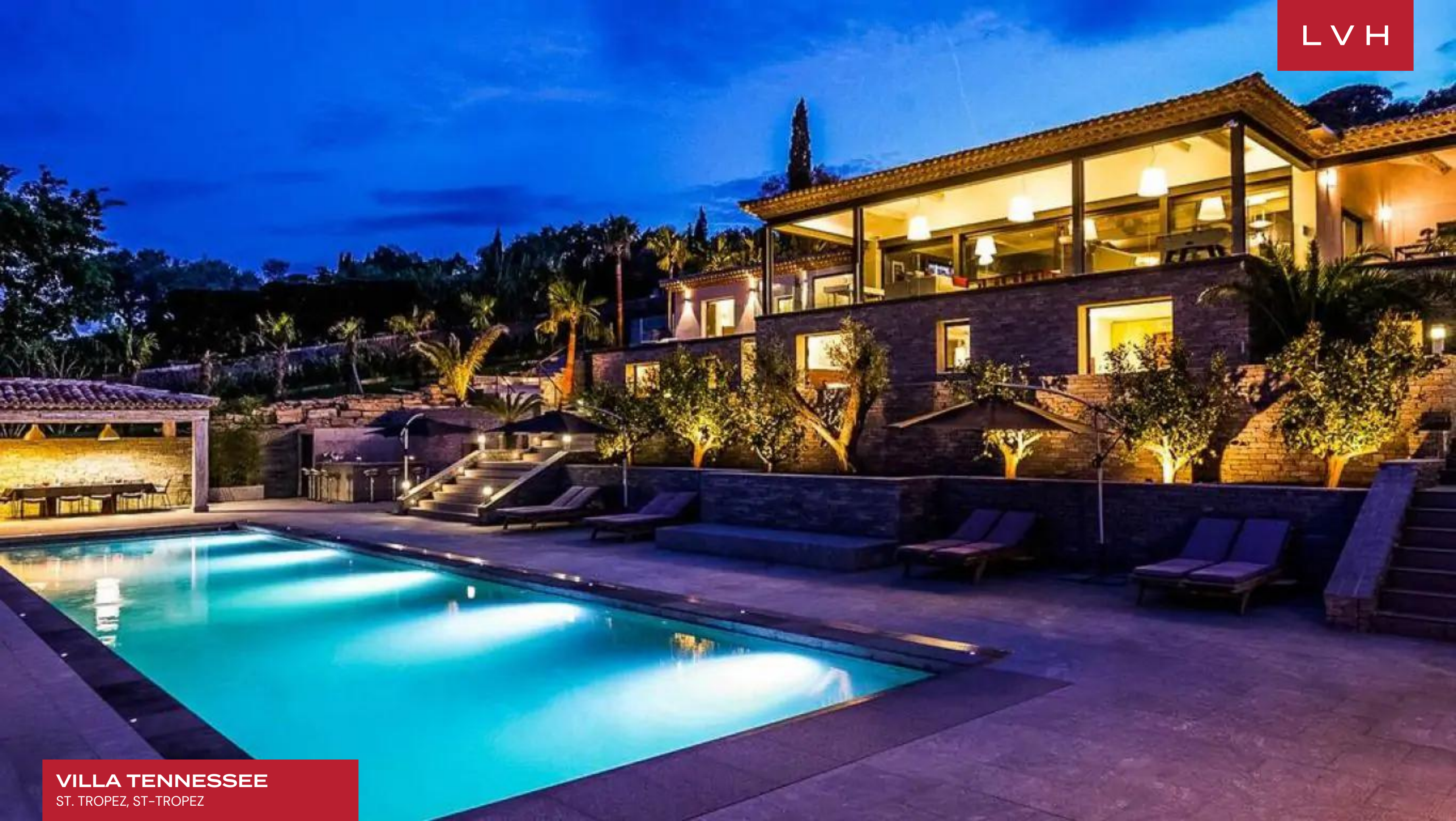
VILLA TENNESSEE ST. TROPEZ, ST-TROPEZ