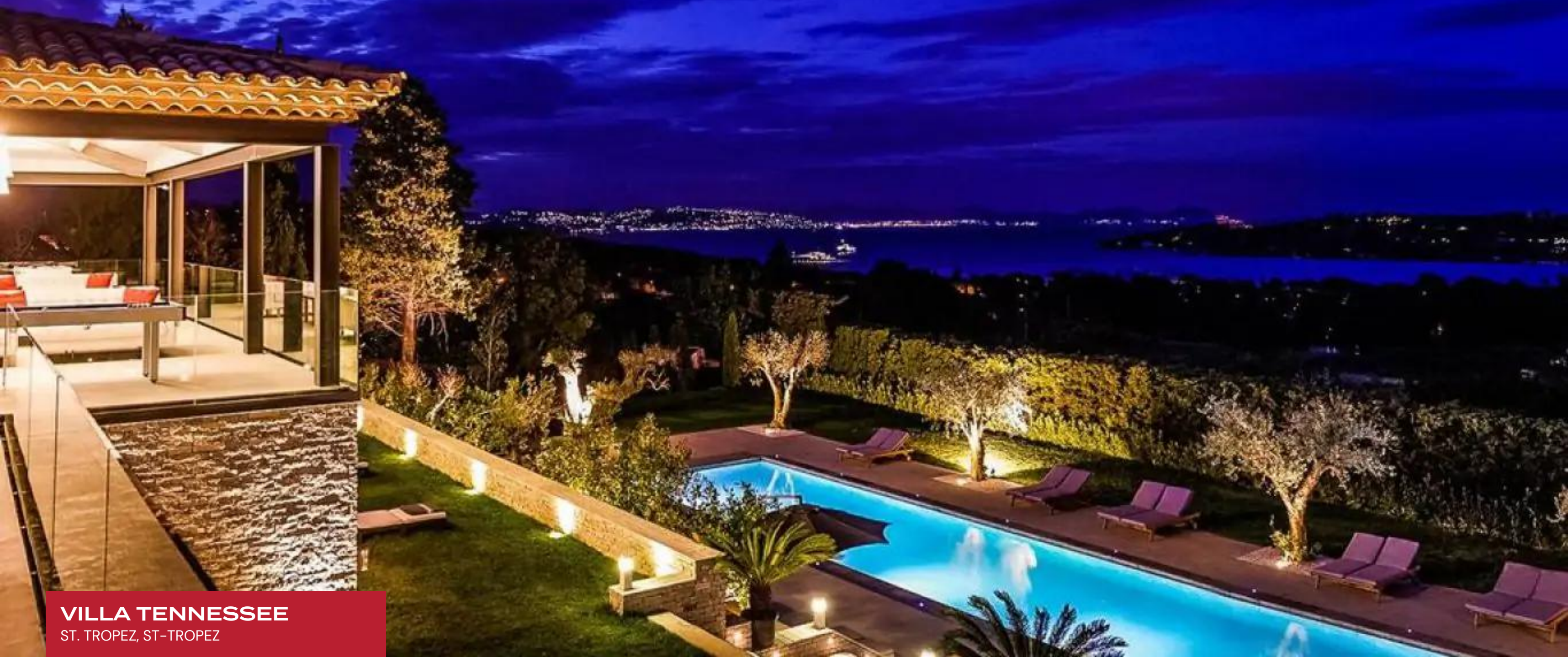
VILLA TENNESSEE ST. TROPEZ, ST-TROPEZ