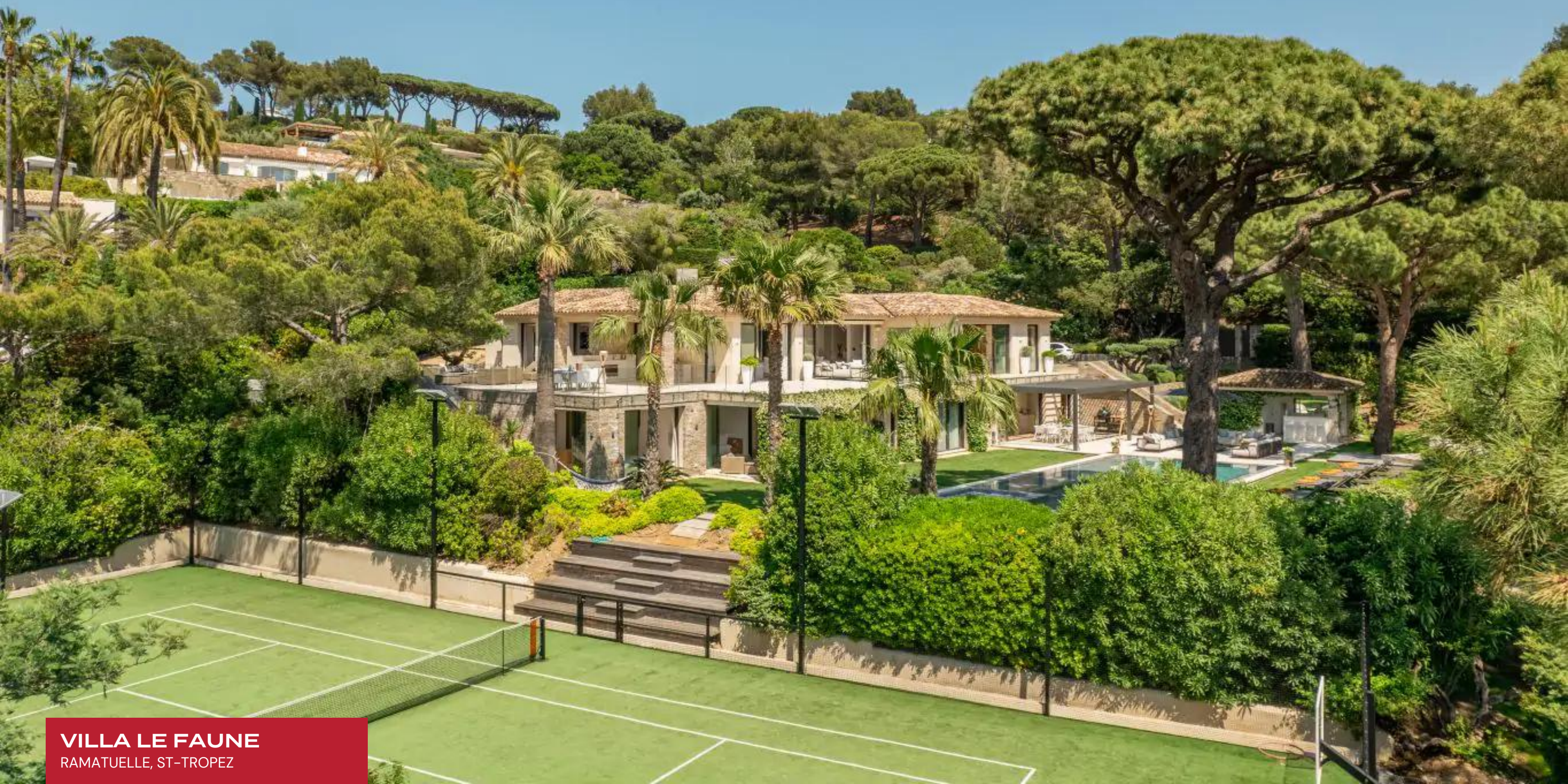
VILLA LE FAUNE RAMATUELLE, ST-TROPEZ