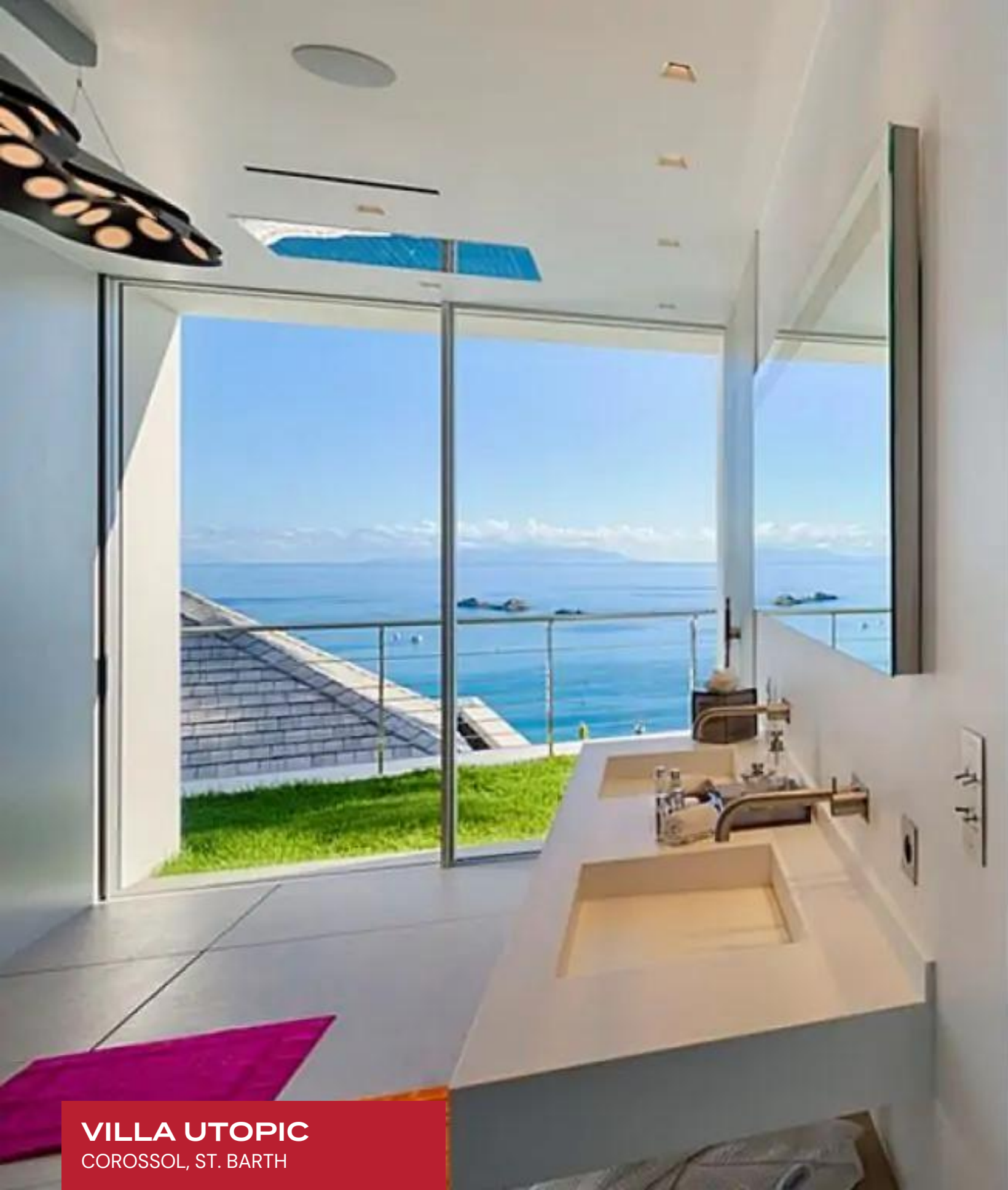
VILLA UTOPIC COROSSOL, ST. BARTH