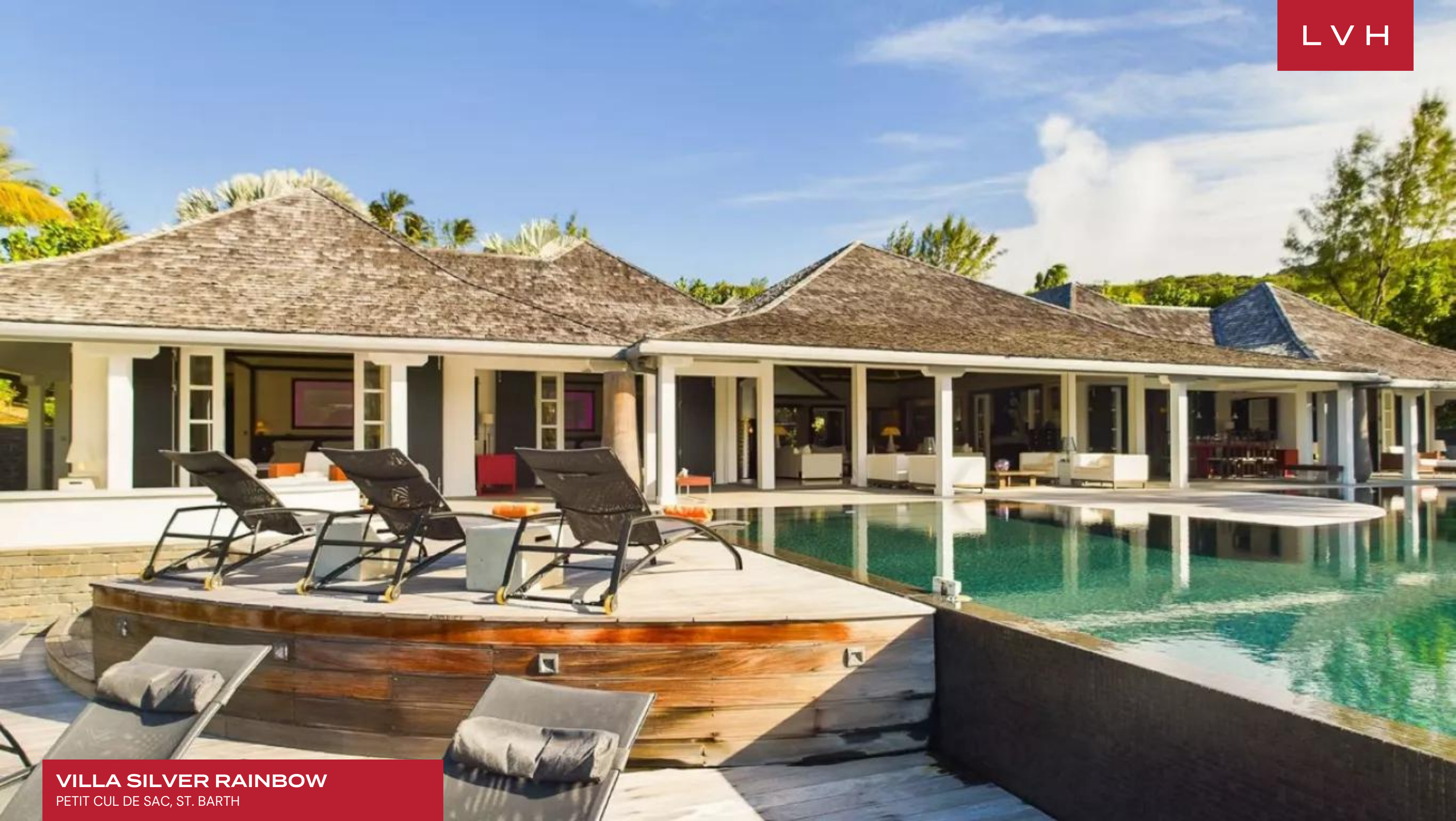
VILLA SILVER RAINBOW PETIT CUL DE SAC, ST. BARTH