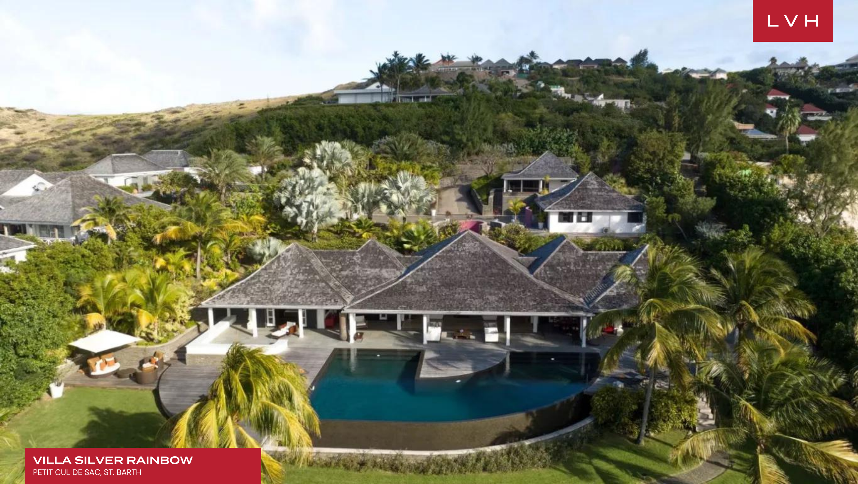
VILLA SILVER RAINBOW PETIT CUL DE SAC, ST. BARTH