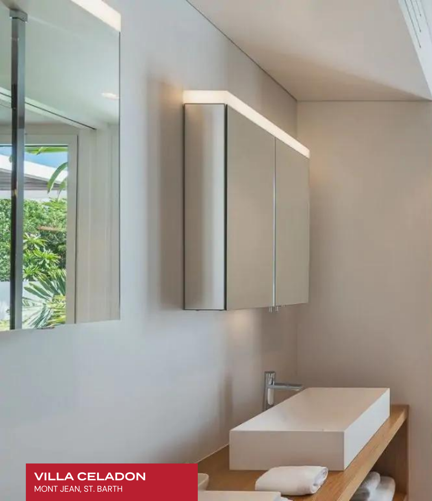
VILLA CELADON MONT JEAN, ST. BARTH