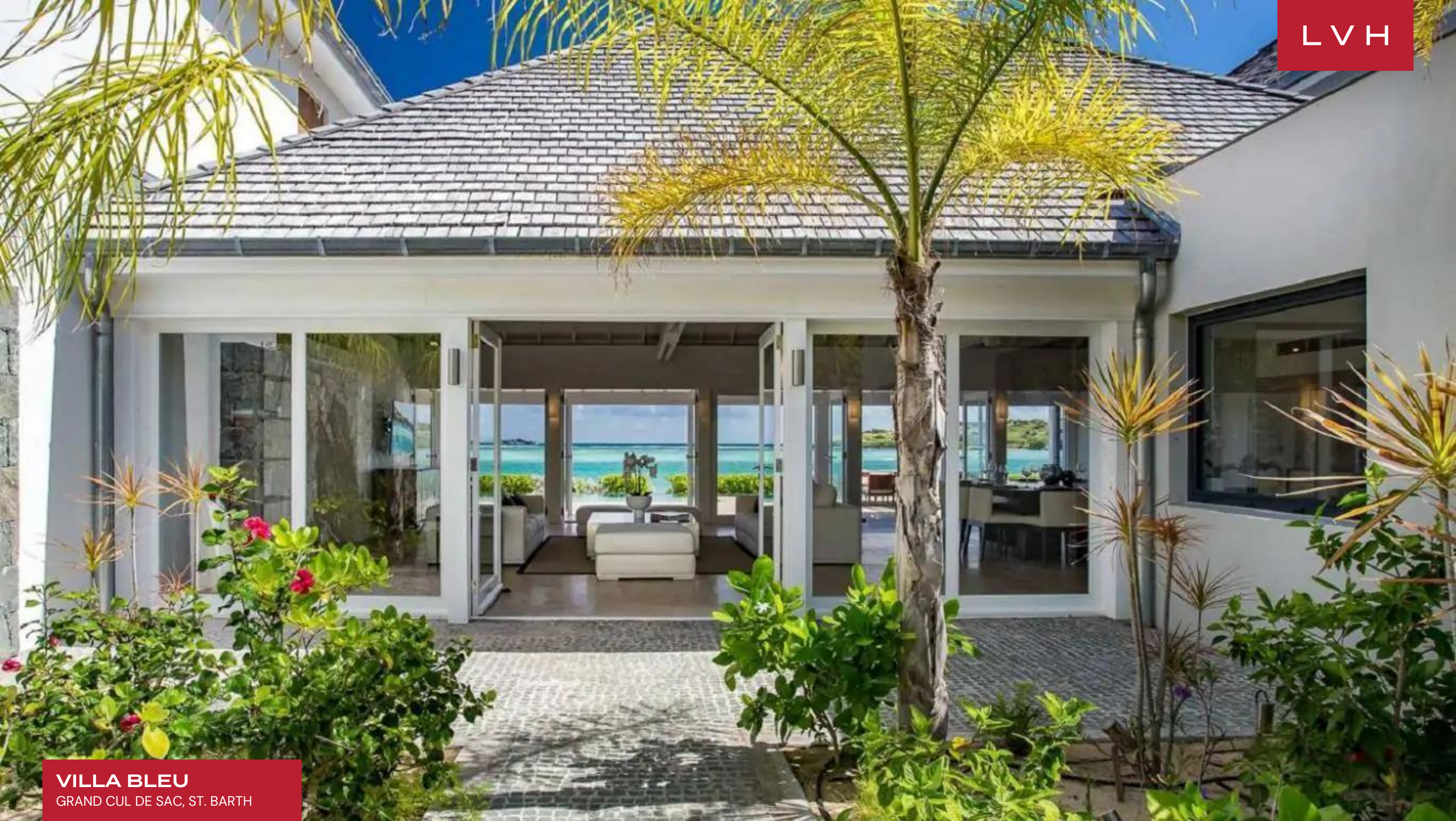
VILLA BLEU GRAND CUL DE SAC, ST. BARTH