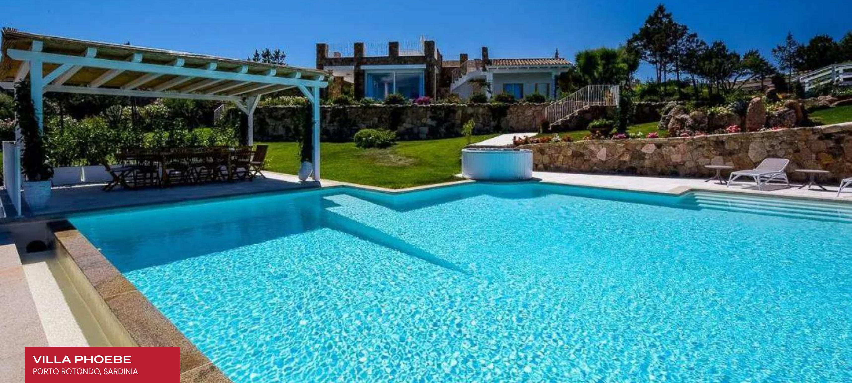
VILLA PHOEBE PORTO ROTONDO, SARDINIA