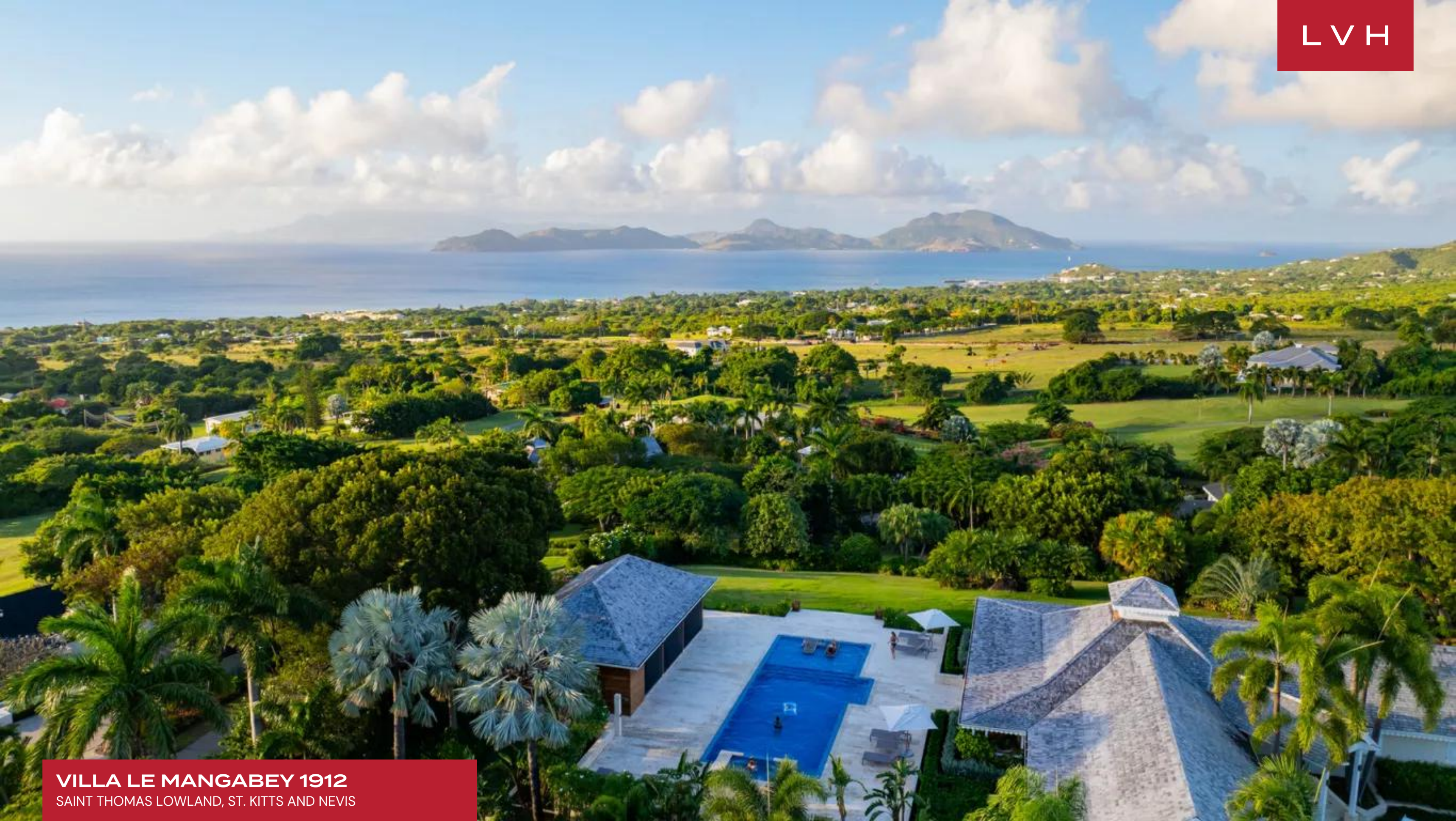
VILLA LE MANGABEY 1912 SAINT THOMAS LOWLAND, ST. KITTS AND NEVIS