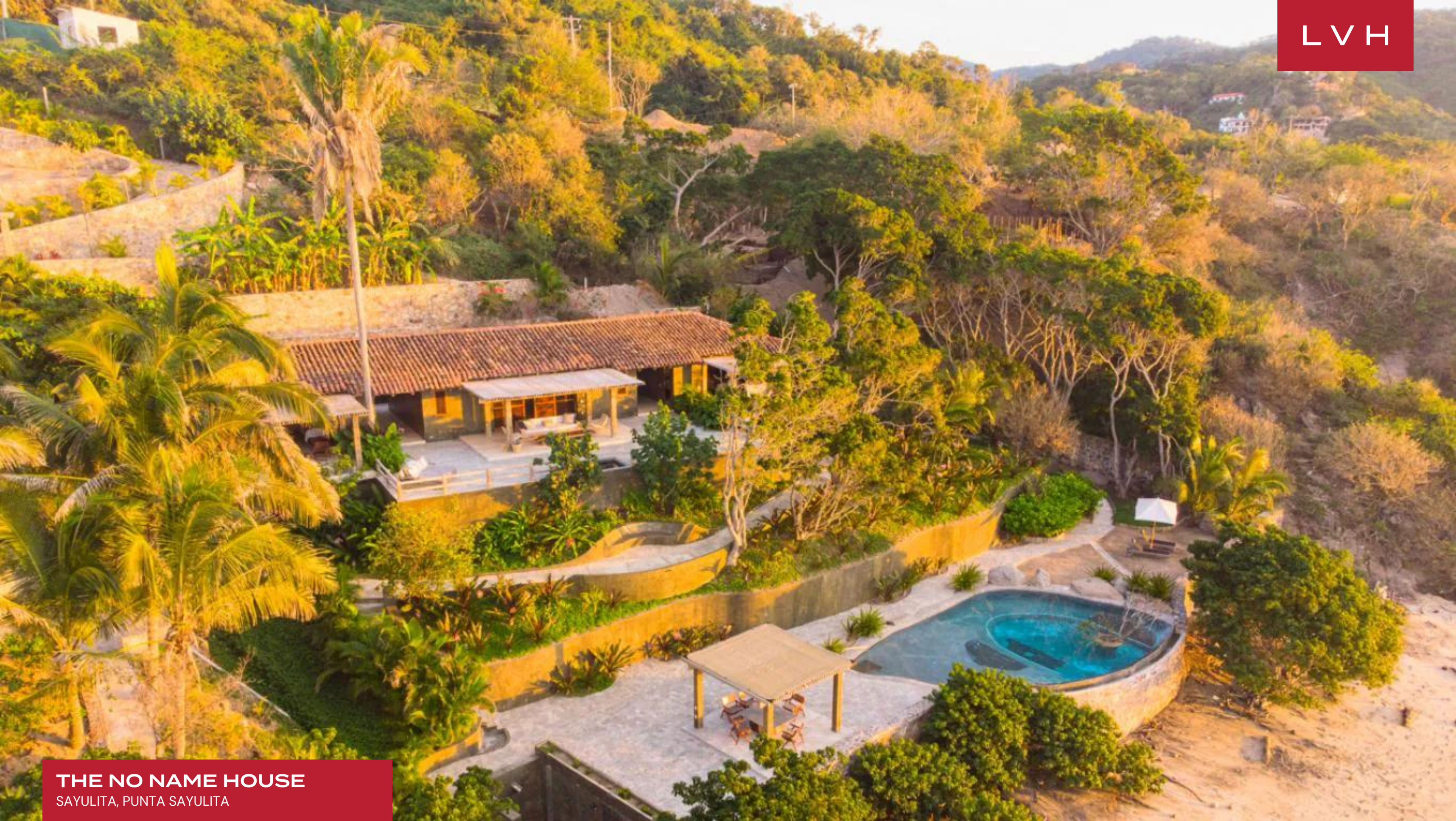
THE NO NAME HOUSE SAYULITA, PUNTA SAYULITA