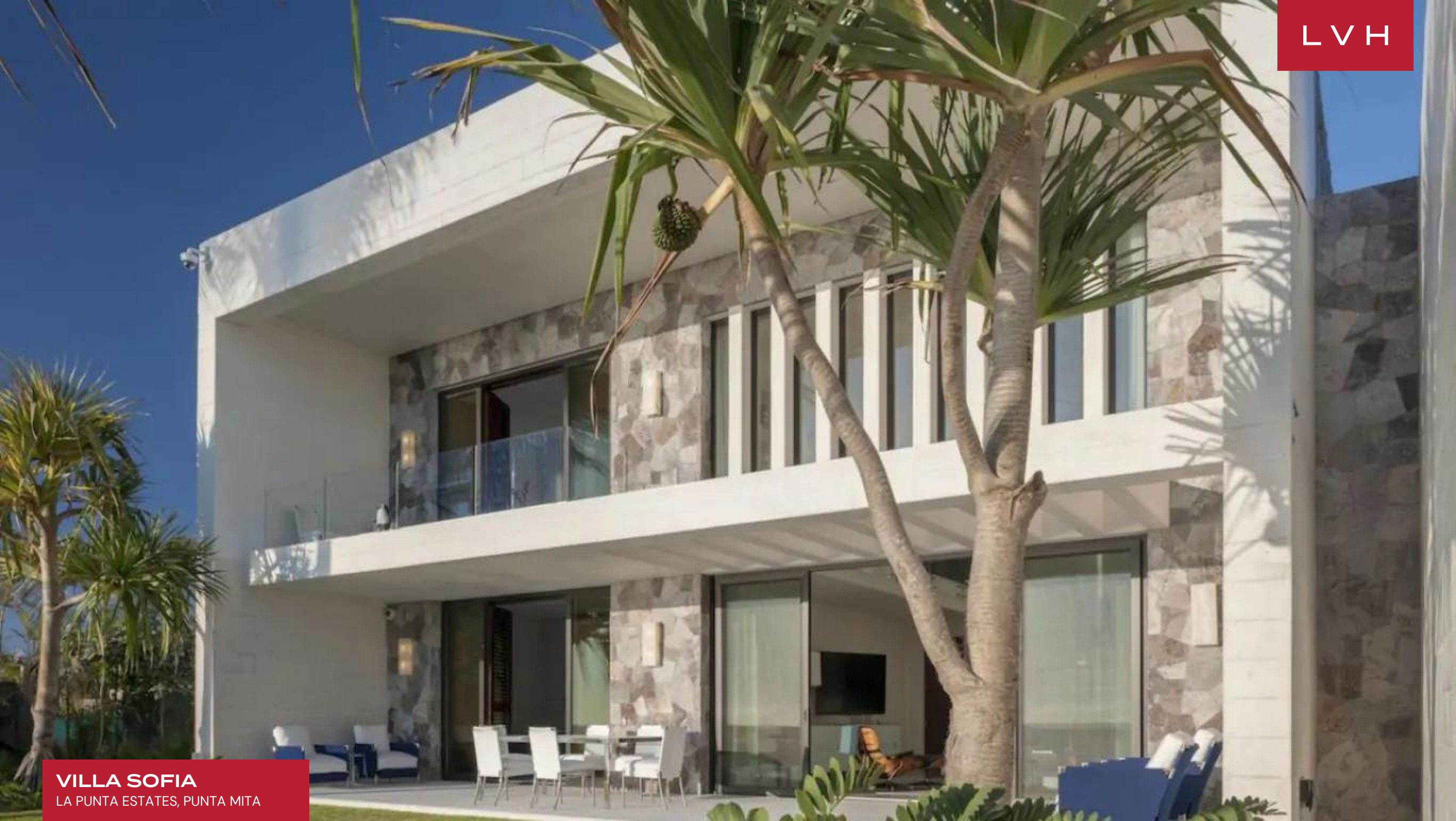
VILLA SOFIA LA PUNTA ESTATES, PUNTA MITA