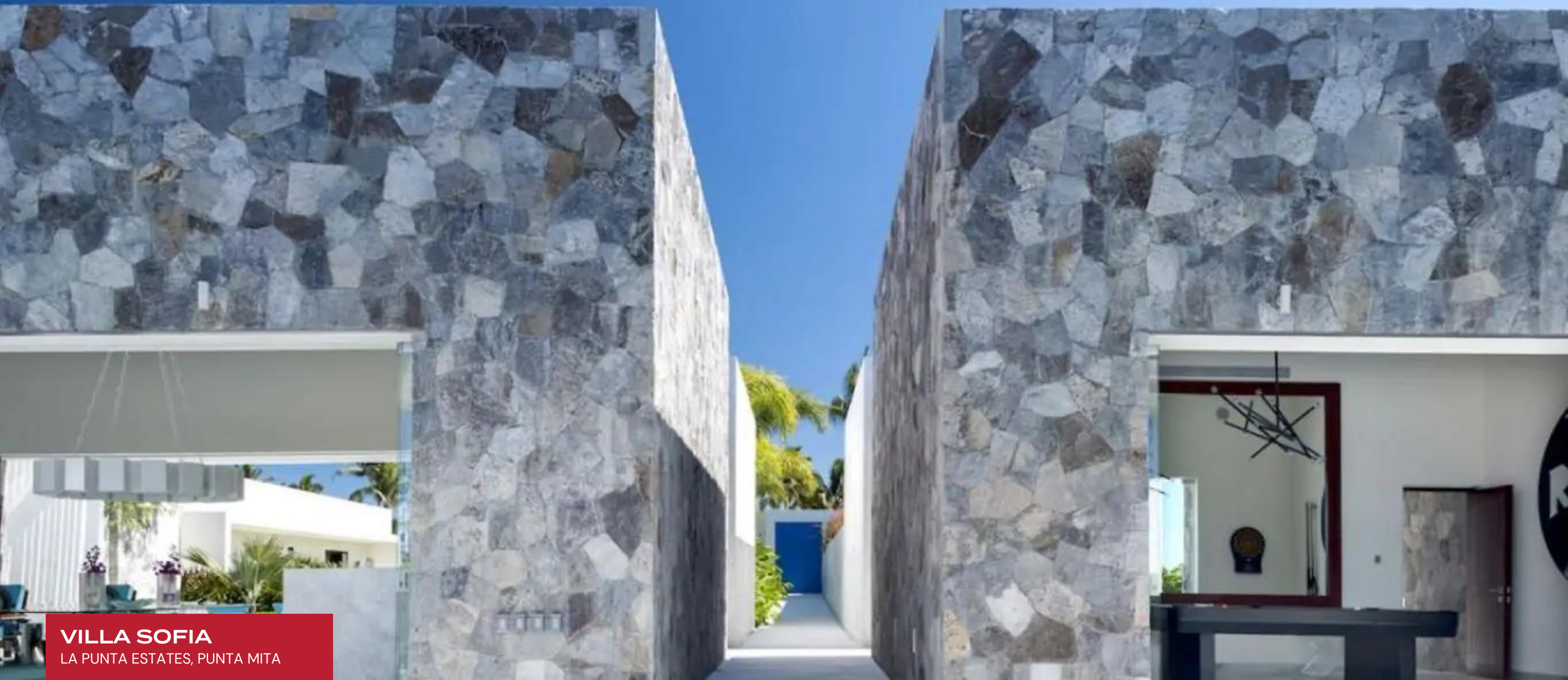
VILLA SOFIA LA PUNTA ESTATES, PUNTA MITA