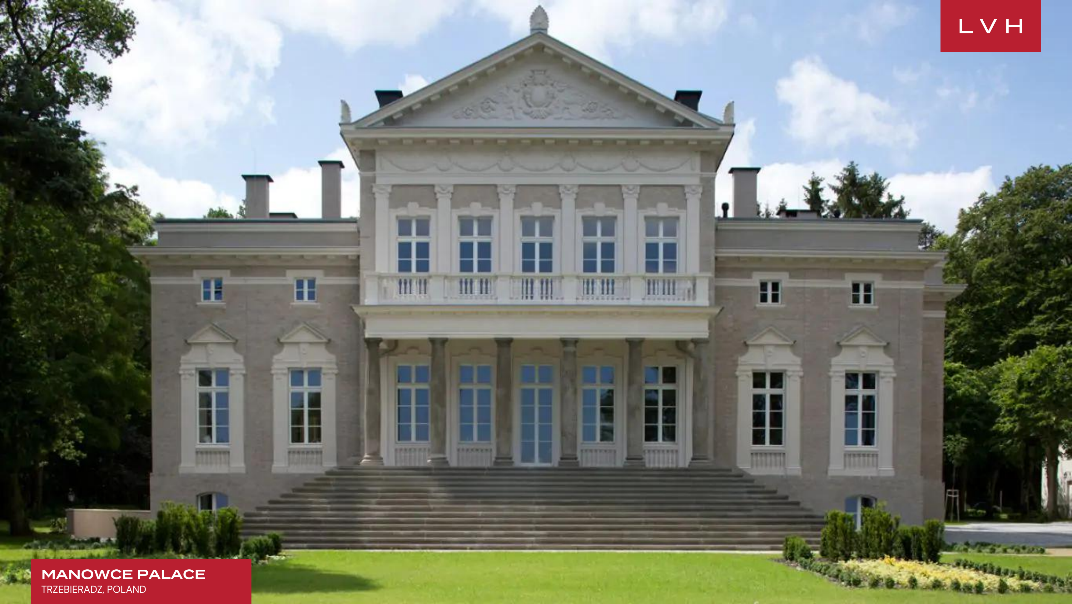
MANOWCE PALACE TRZEBIERADZ, POLAND