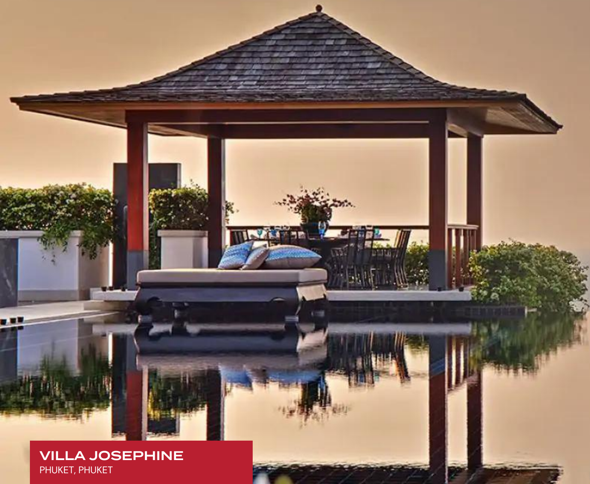
VILLA JOSEPHINE PHUKET, PHUKET