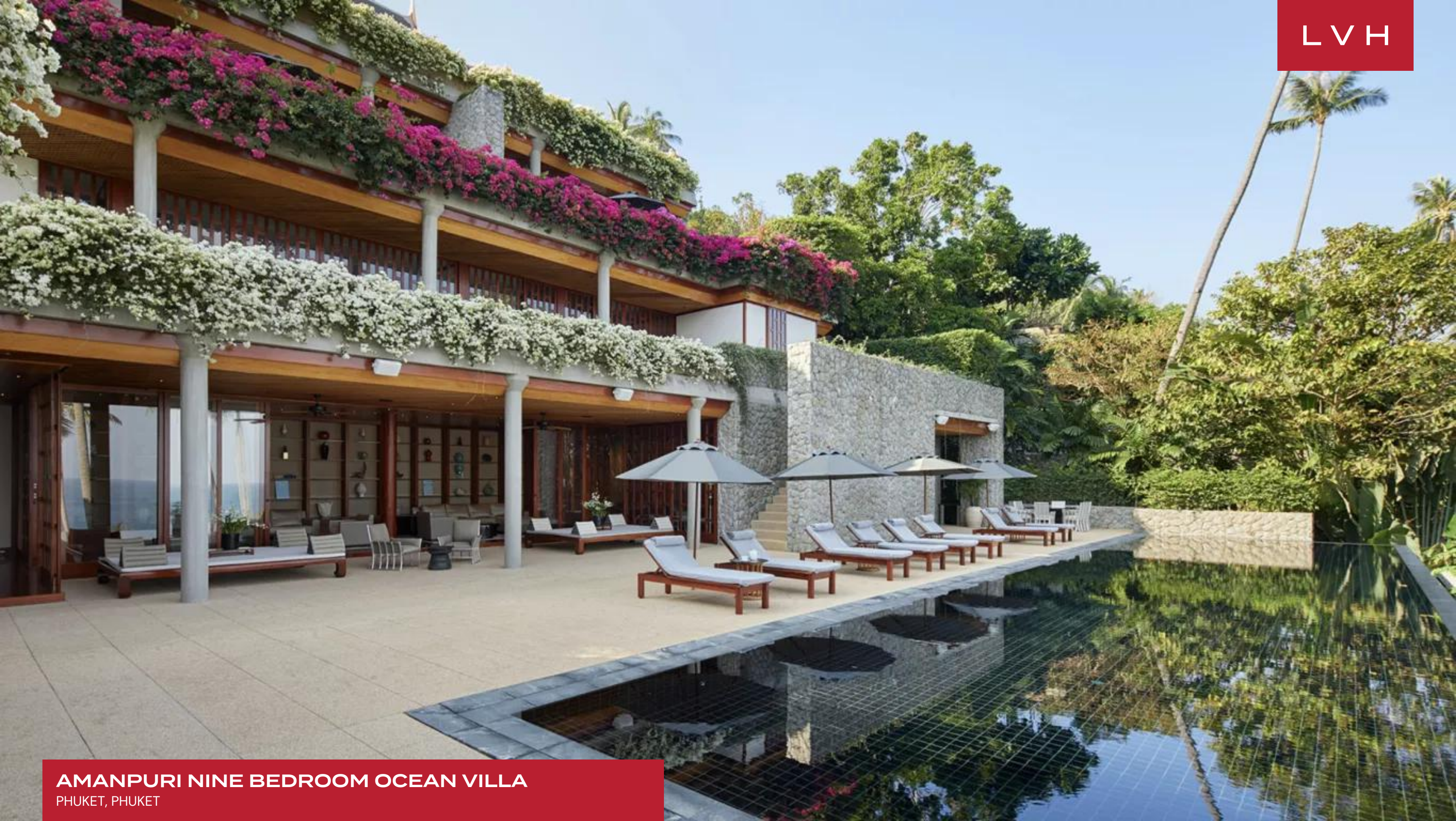
AMANPURI NINE BEDROOM OCEAN VILLA PHUKET, PHUKET