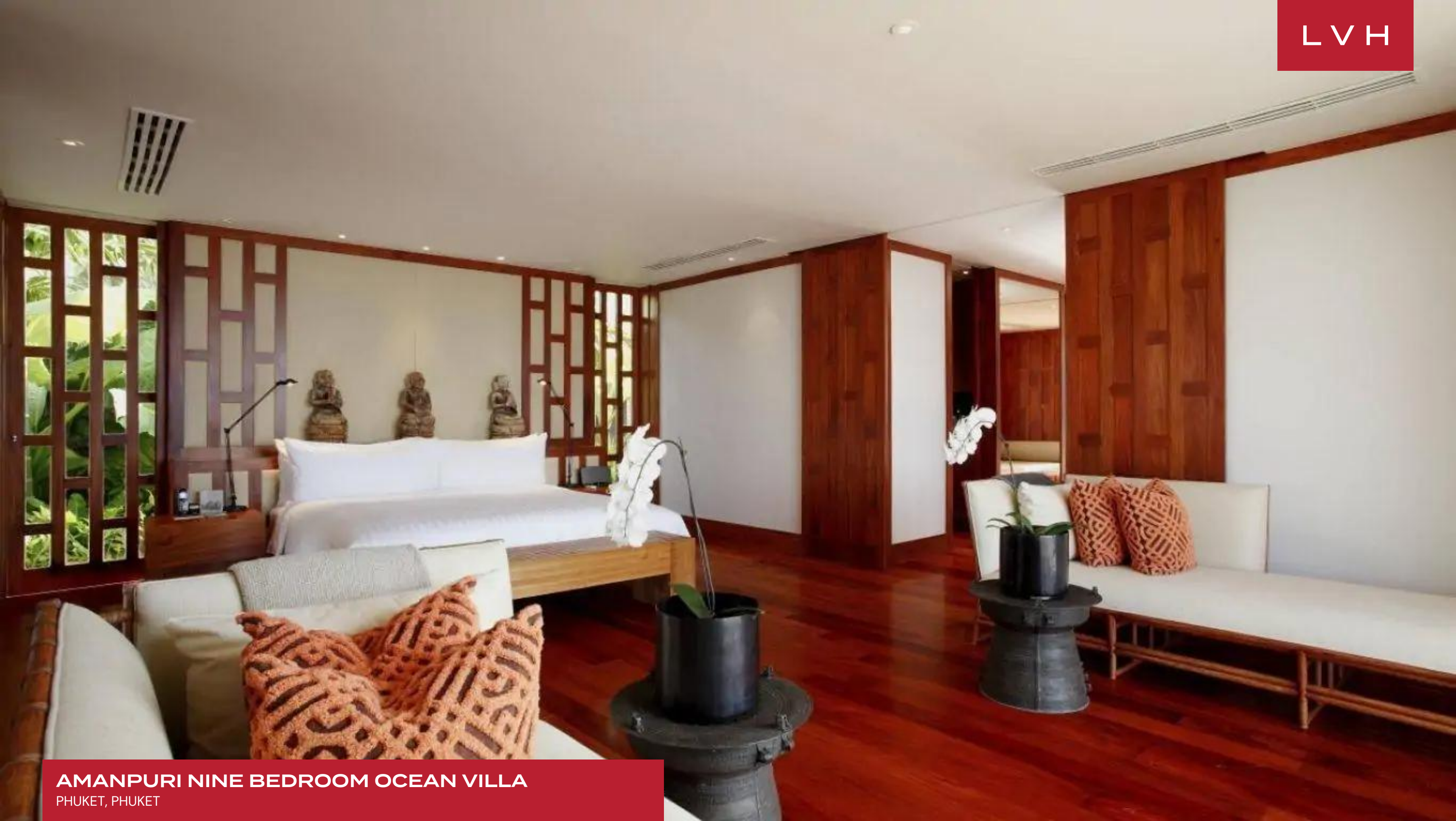
AMANPURI NINE BEDROOM OCEAN VILLA PHUKET, PHUKET