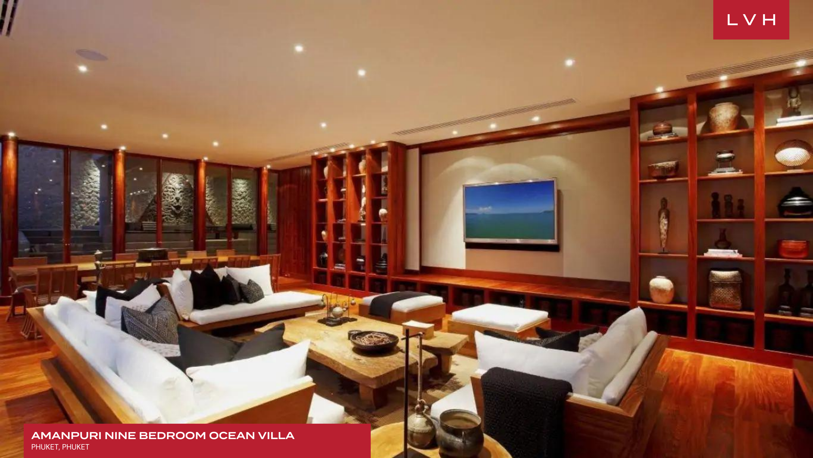
AMANPURI NINE BEDROOM OCEAN VILLA PHUKET, PHUKET