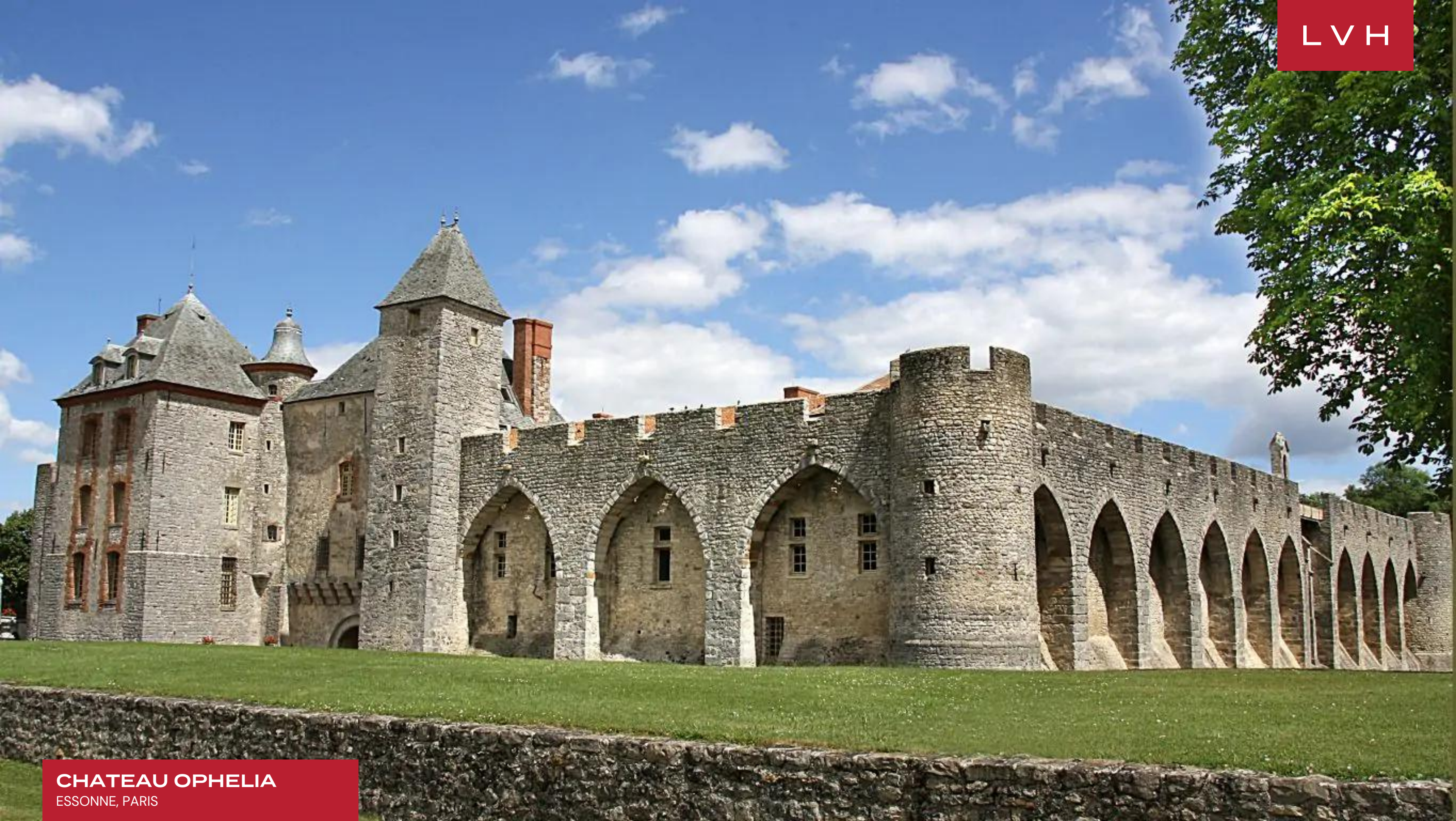
CHATEAU OPHELIA ESSONNE, PARIS