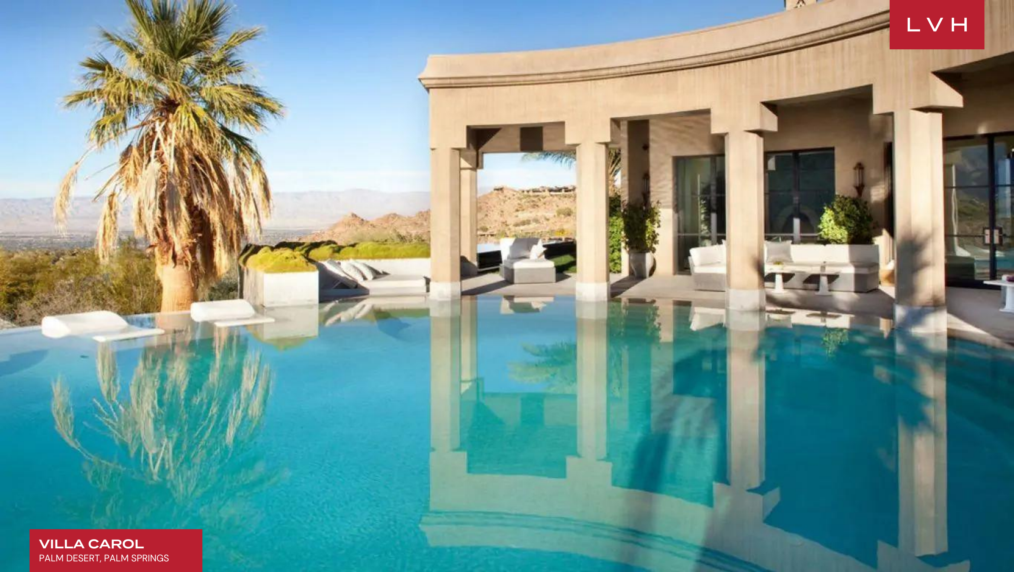
VILLA CAROL PALM DESERT, PALM SPRINGS