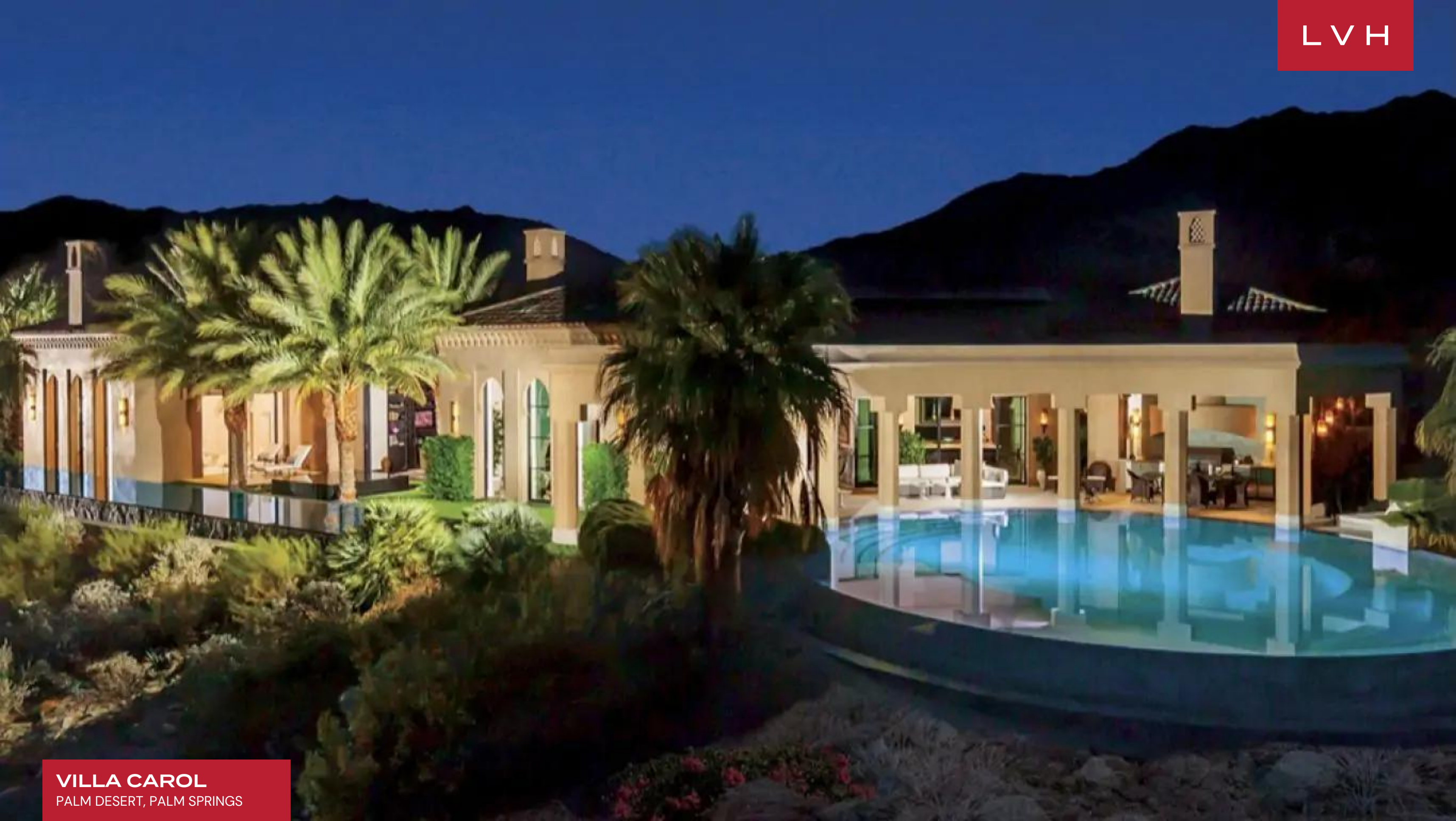
VILLA CAROL PALM DESERT, PALM SPRINGS