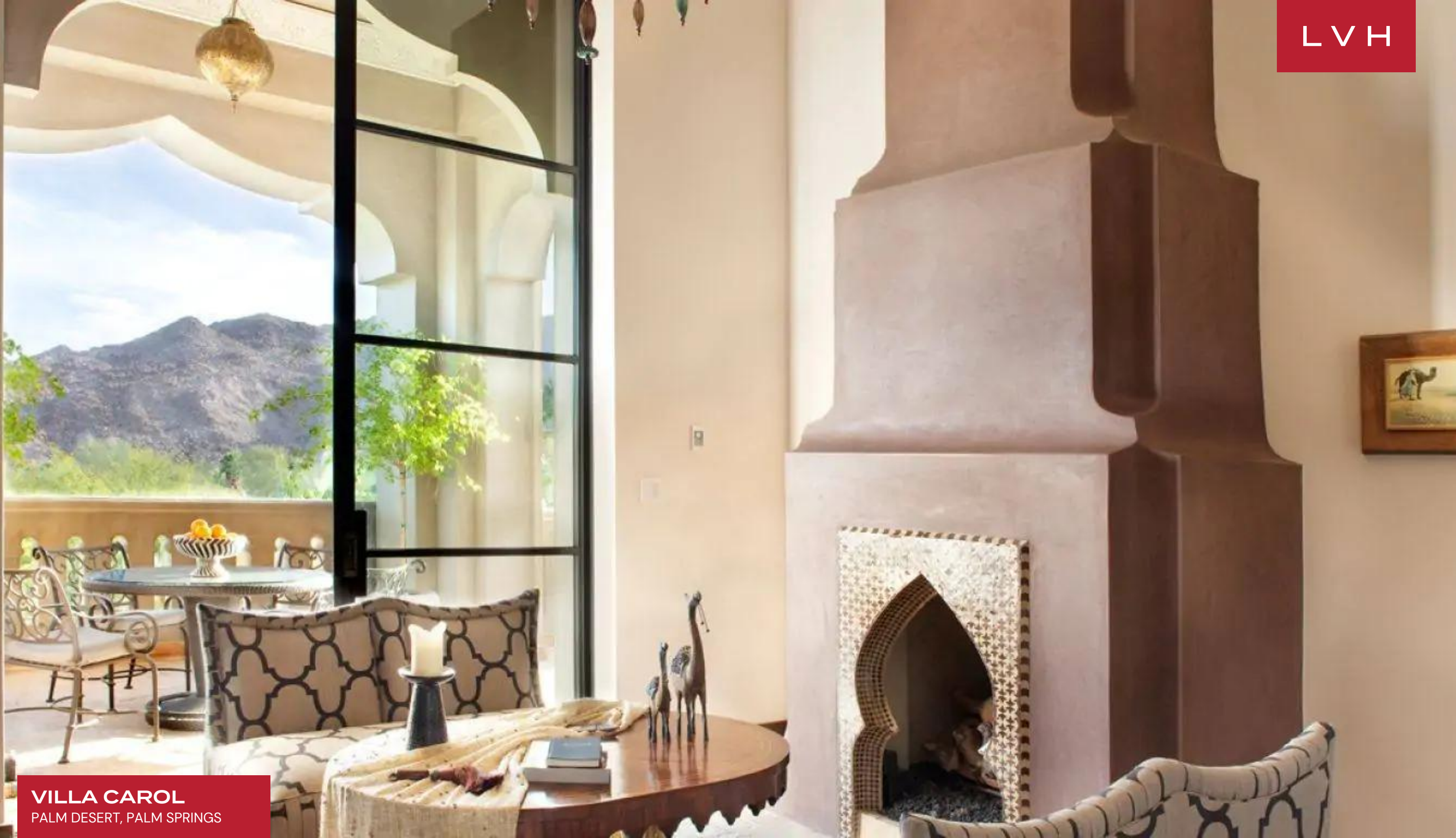
VILLA CAROL PALM DESERT, PALM SPRINGS