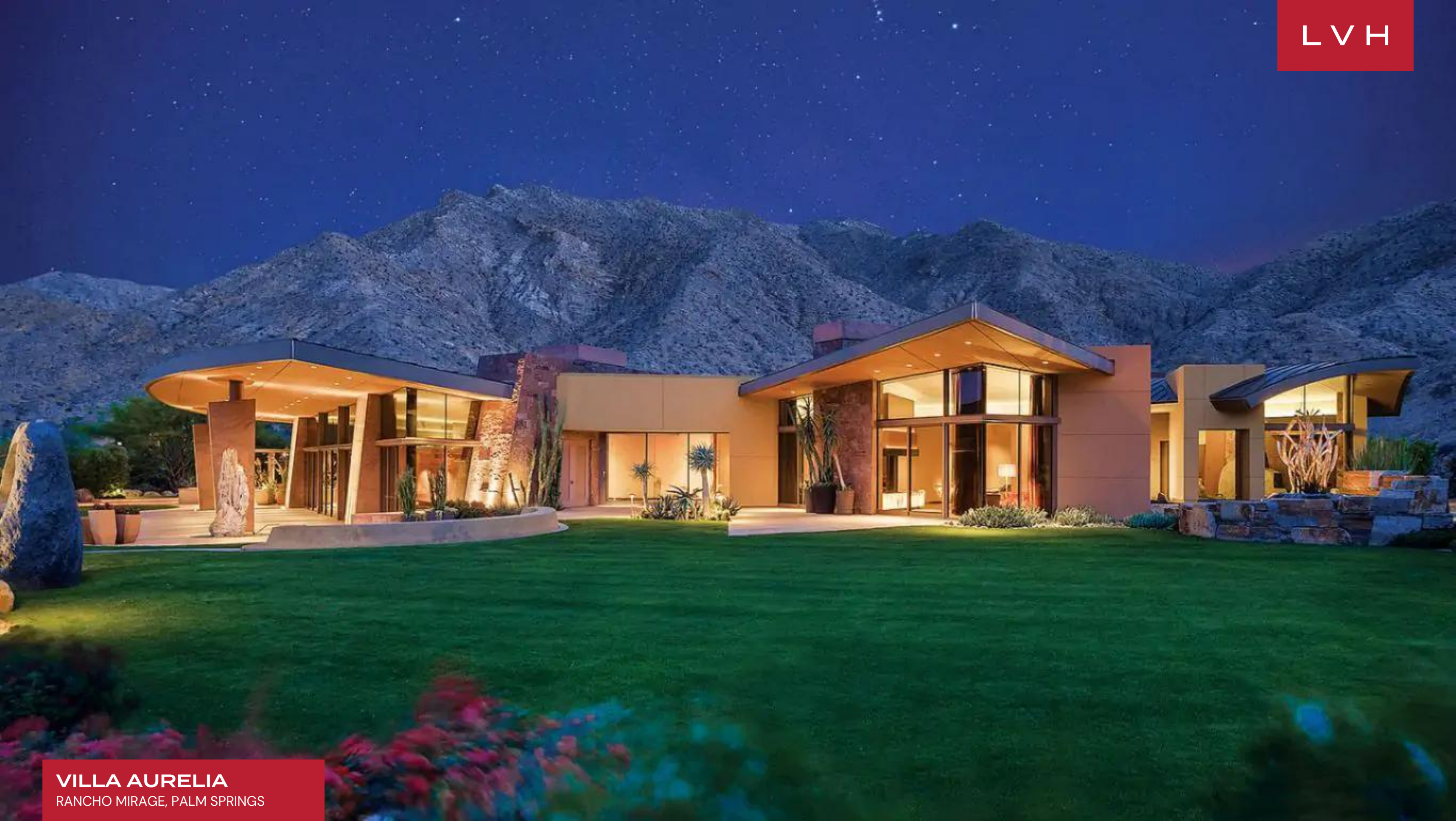
VILLA AURELIA RANCHO MIRAGE, PALM SPRINGS