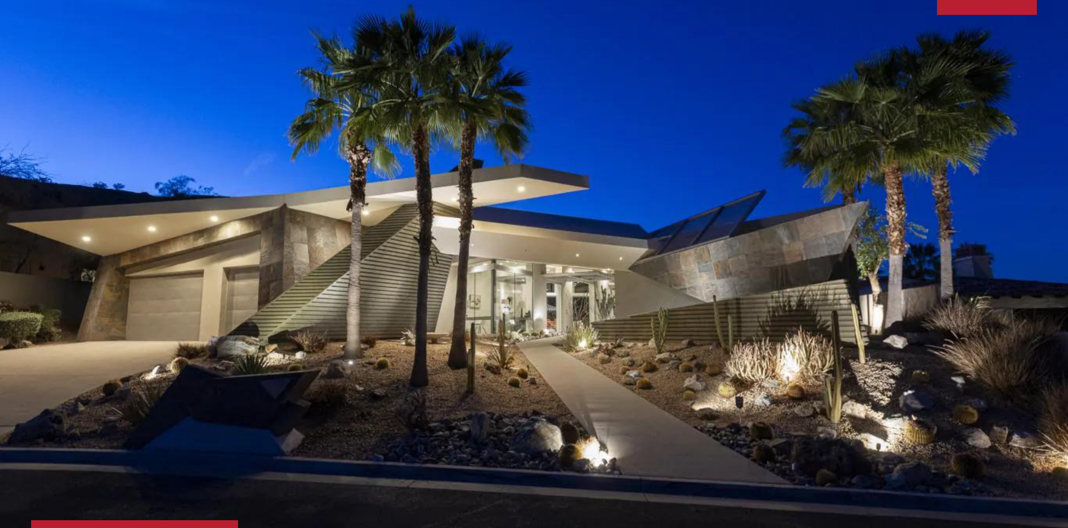
VILLA ABIGAIL RANCHO MIRAGE, PALM SPRINGS