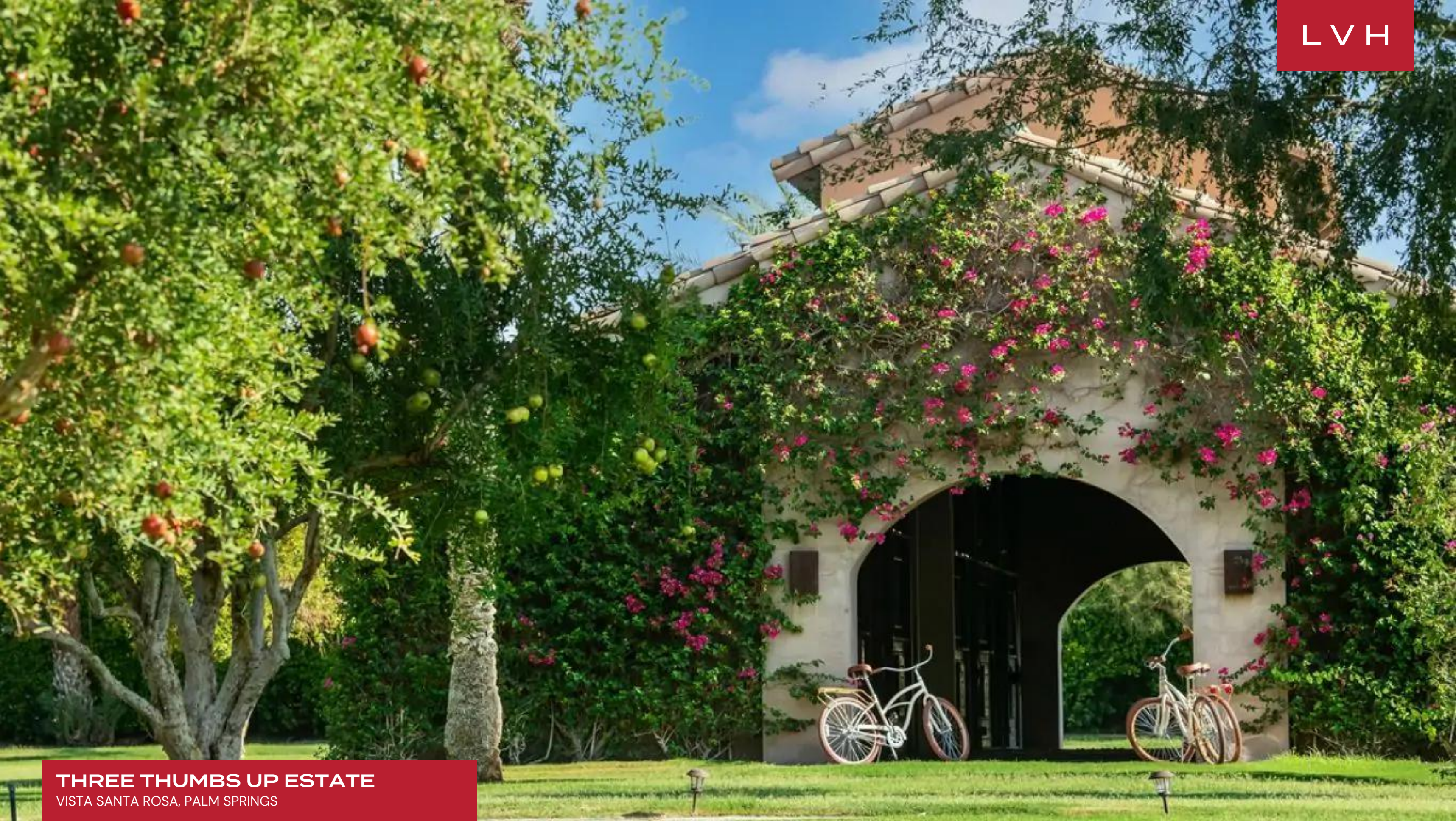
THREE THUMBS UP ESTATE VISTA SANTA ROSA, PALM SPRINGS