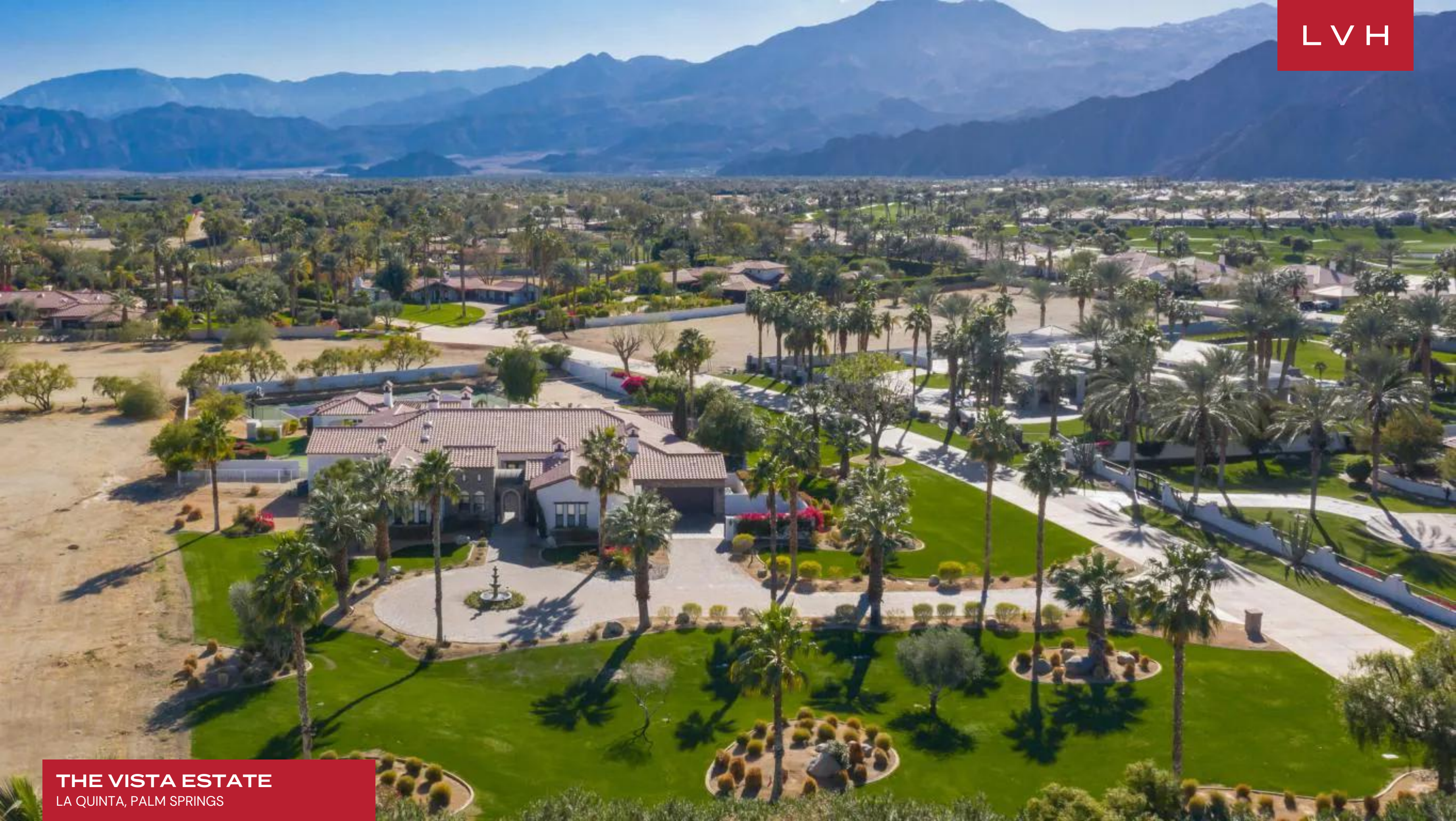
THE VISTA ESTATE LA QUINTA, PALM SPRINGS