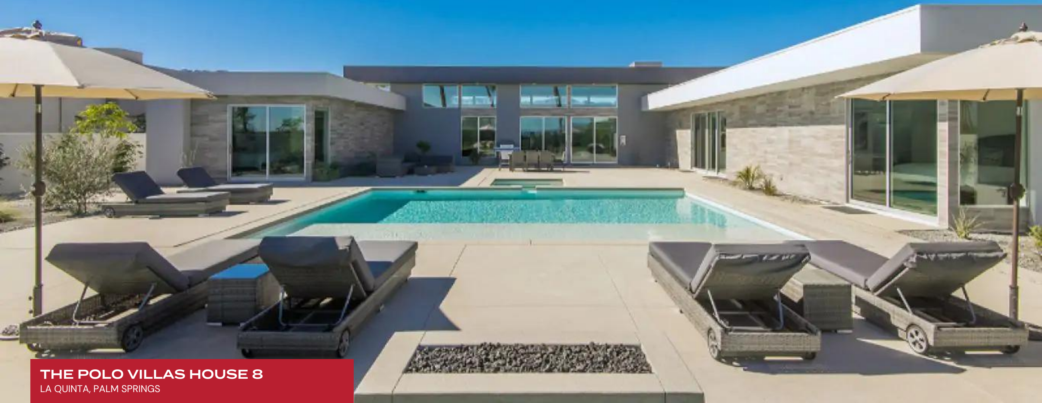
THE POLO VILLAS HOUSE 8 LA QUINTA, PALM SPRINGS