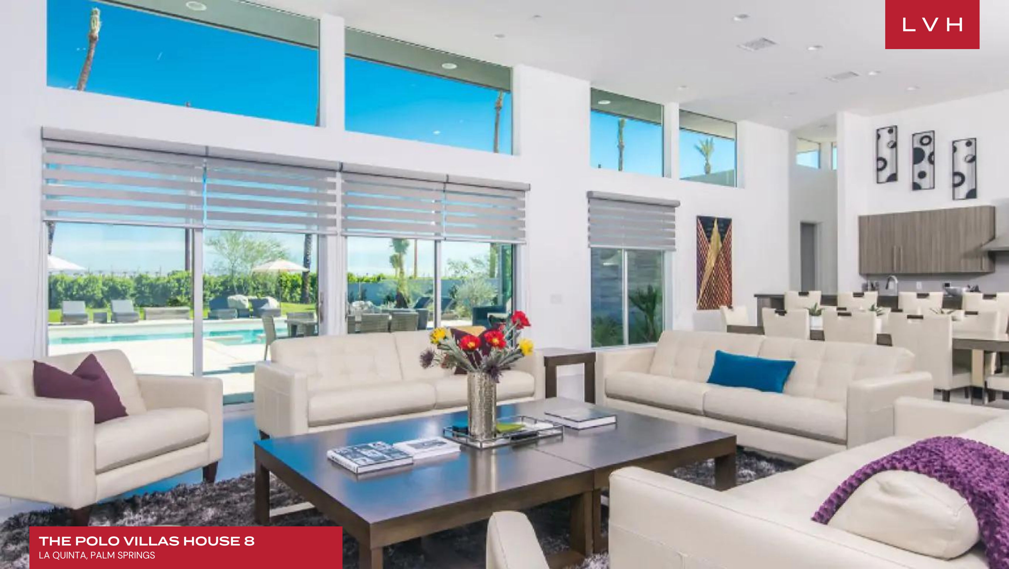
THE POLO VILLAS HOUSE 8 LA QUINTA, PALM SPRINGS