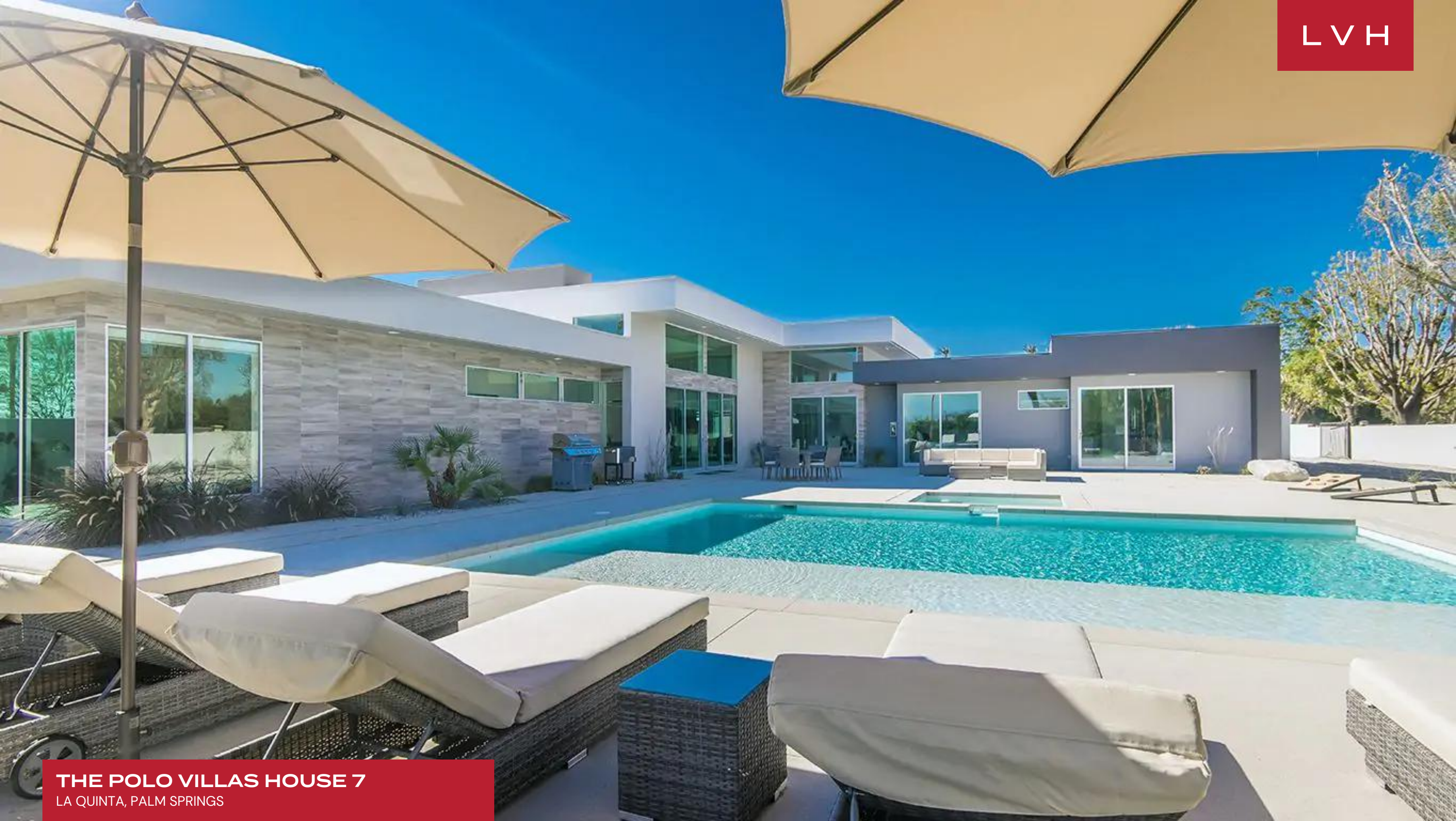
THE POLO VILLAS HOUSE 7 LA QUINTA, PALM SPRINGS