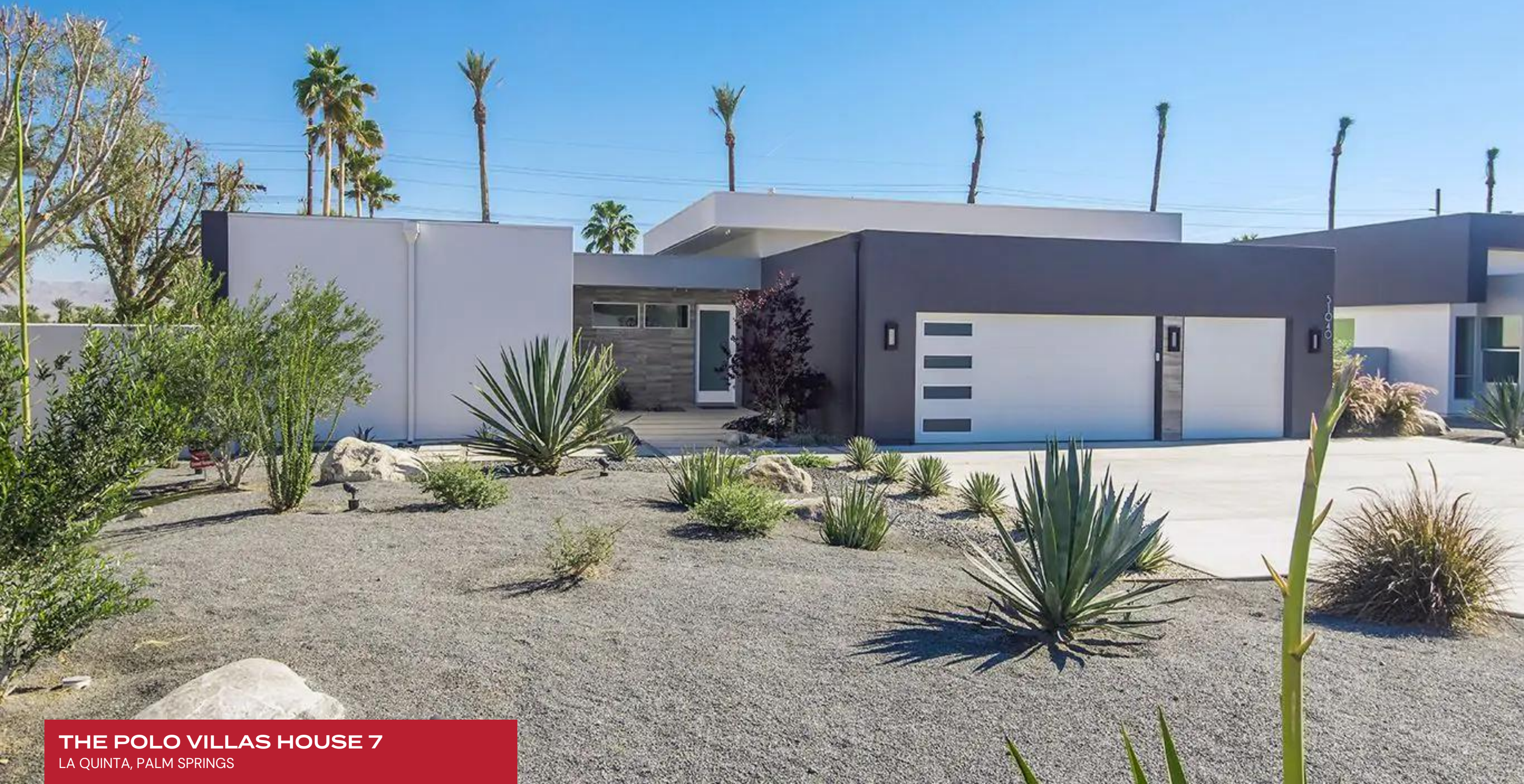
THE POLO VILLAS HOUSE 7 LA QUINTA, PALM SPRINGS