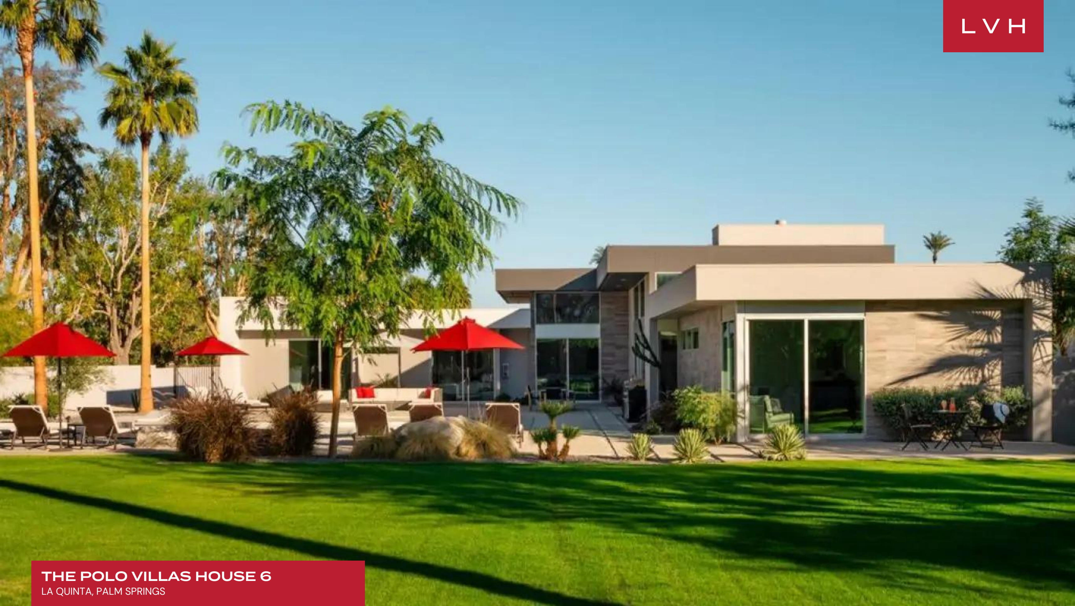
THE POLO VILLAS HOUSE 6 LA QUINTA, PALM SPRINGS