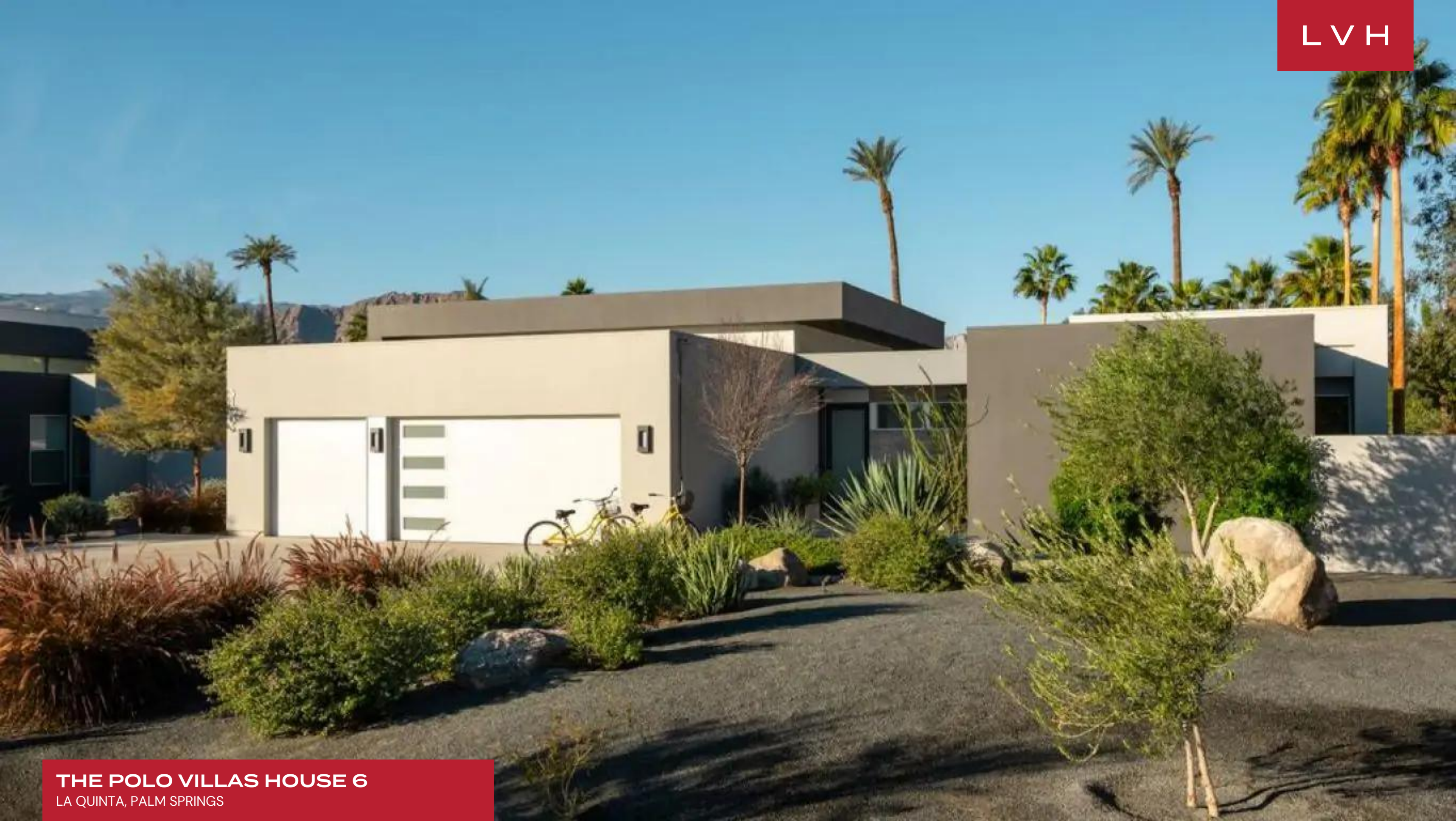
THE POLO VILLAS HOUSE 6 LA QUINTA, PALM SPRINGS