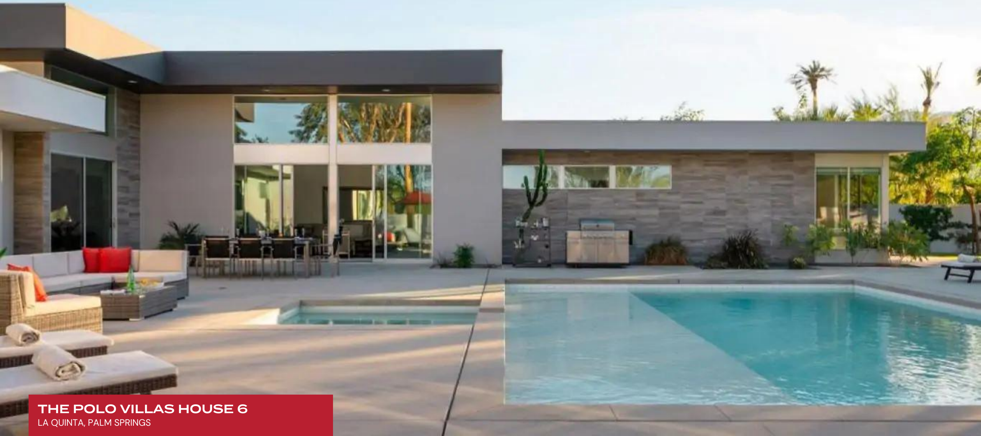
THE POLO VILLAS HOUSE 6 LA QUINTA, PALM SPRINGS