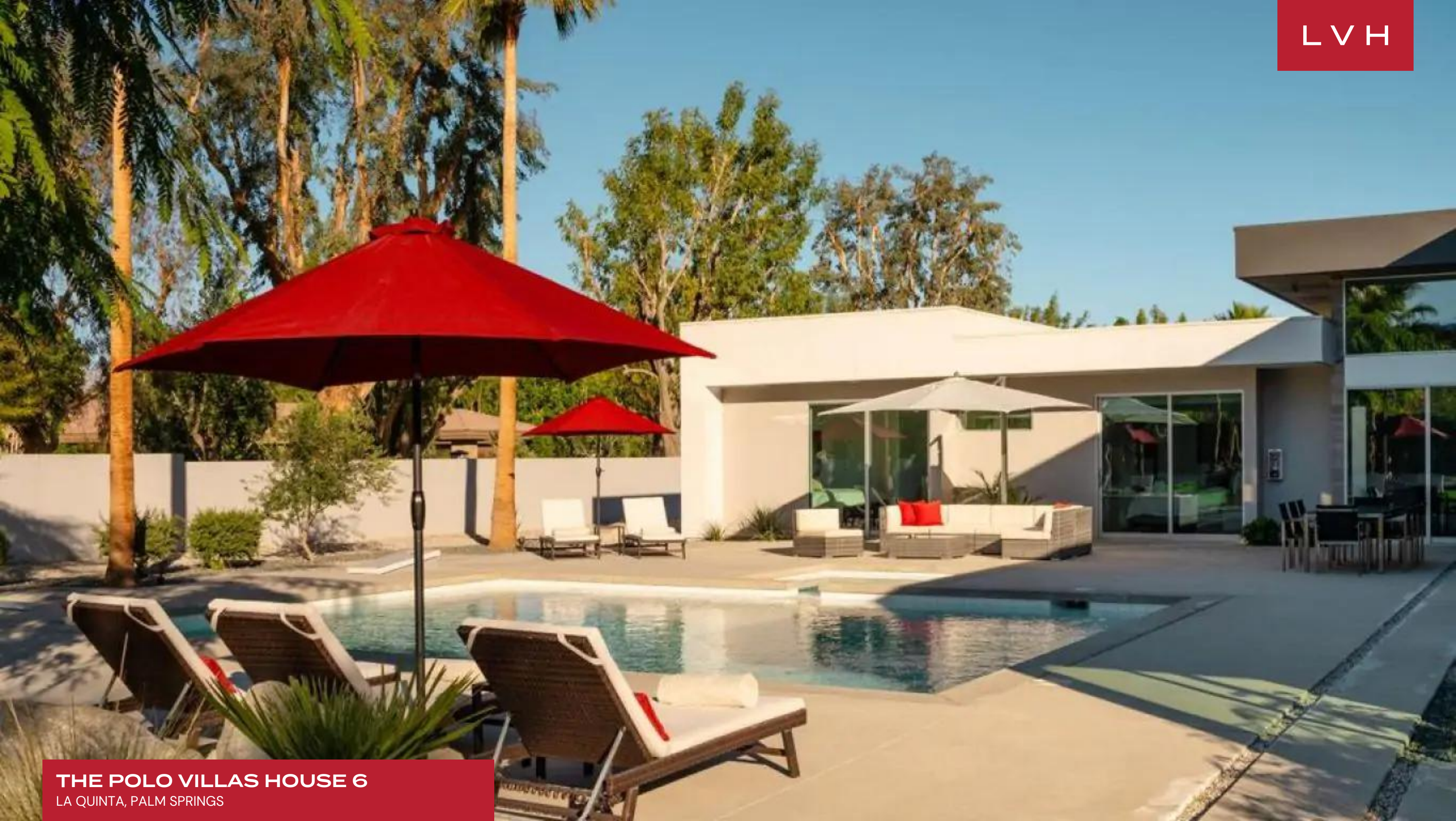
THE POLO VILLAS HOUSE 6 LA QUINTA, PALM SPRINGS