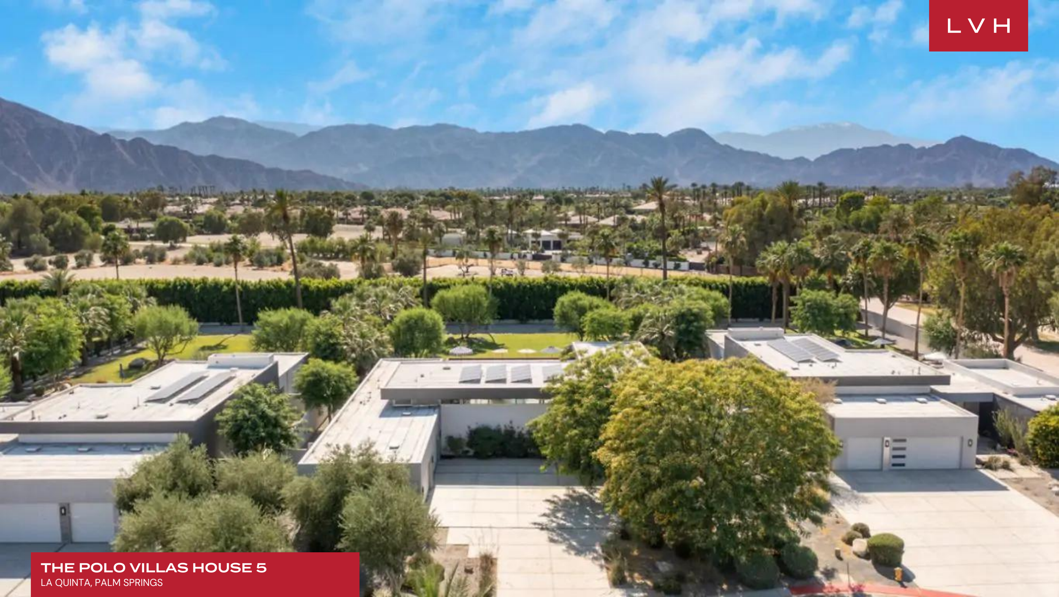
THE POLO VILLAS HOUSE 5 LA QUINTA, PALM SPRINGS