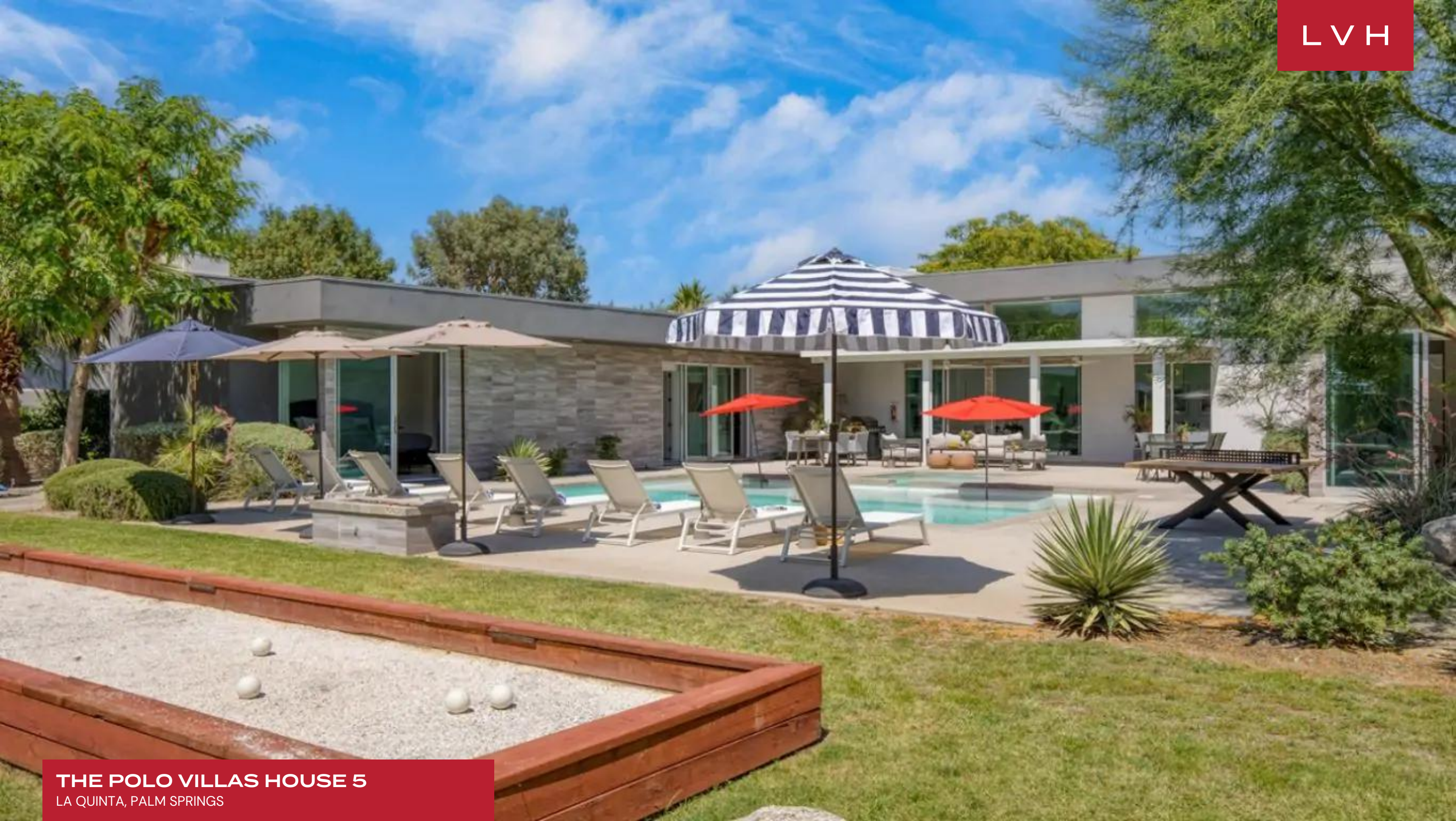
THE POLO VILLAS HOUSE 5 LA QUINTA, PALM SPRINGS