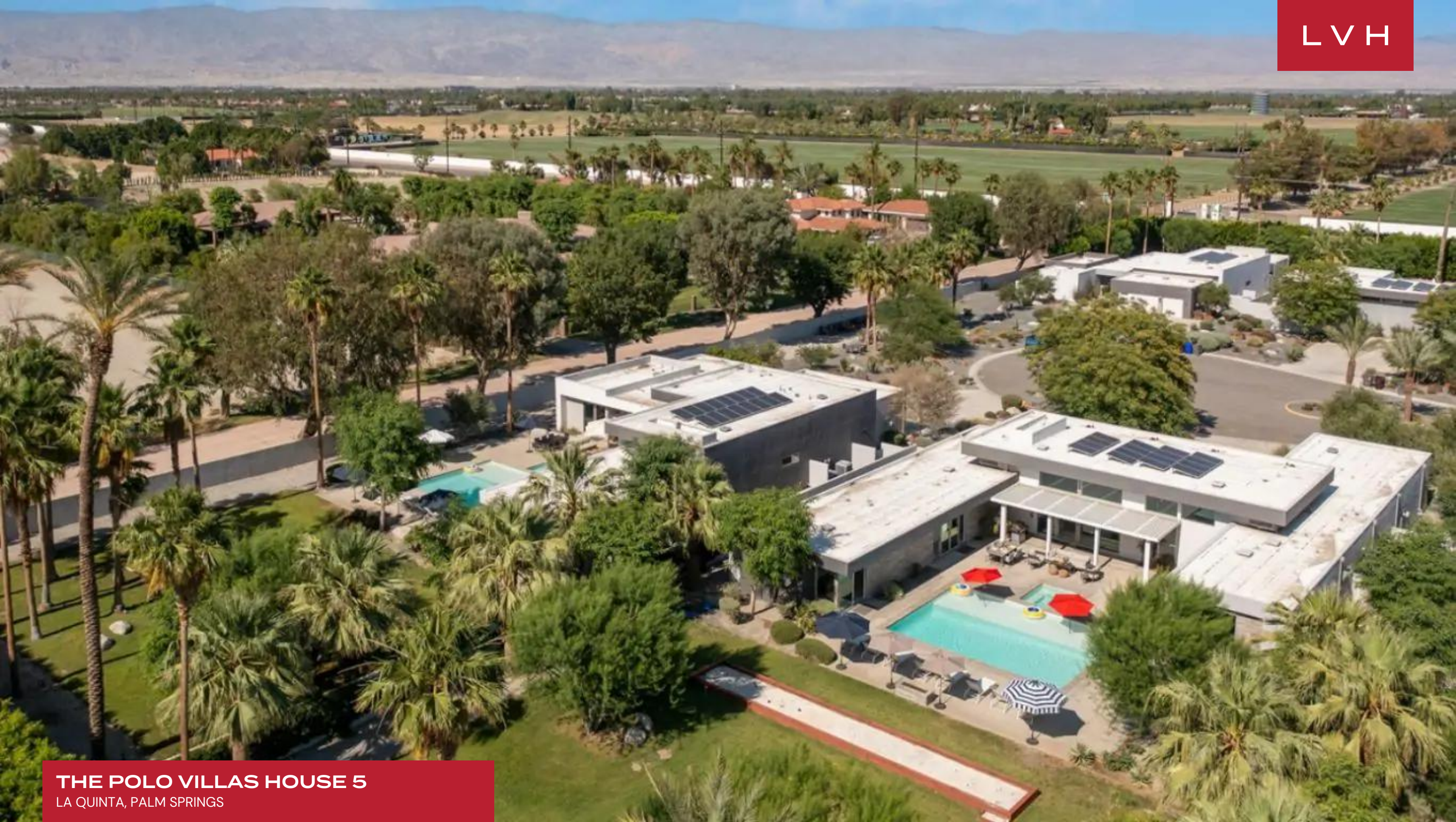
THE POLO VILLAS HOUSE 5 LA QUINTA, PALM SPRINGS