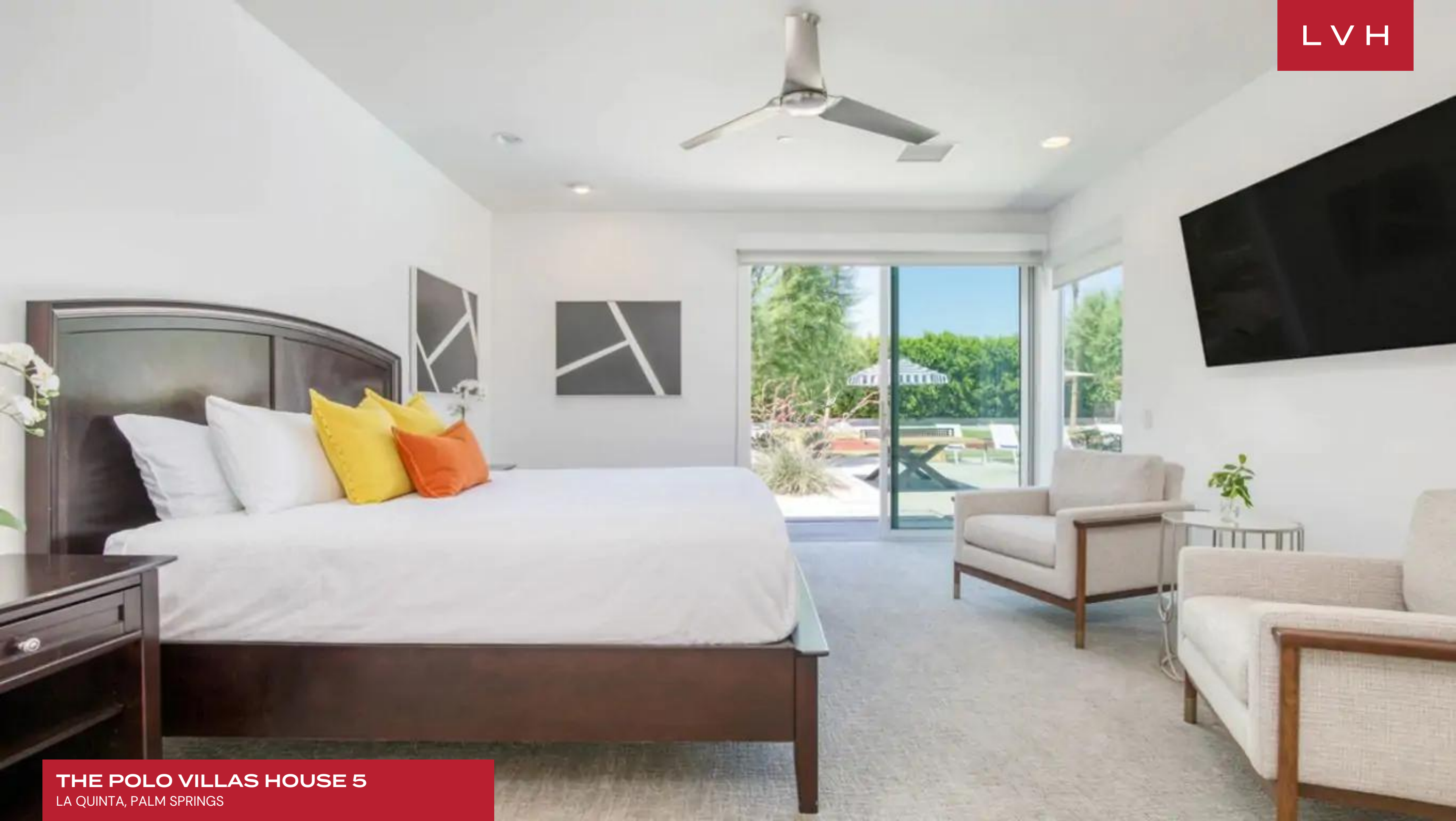
THE POLO VILLAS HOUSE 5 LA QUINTA, PALM SPRINGS