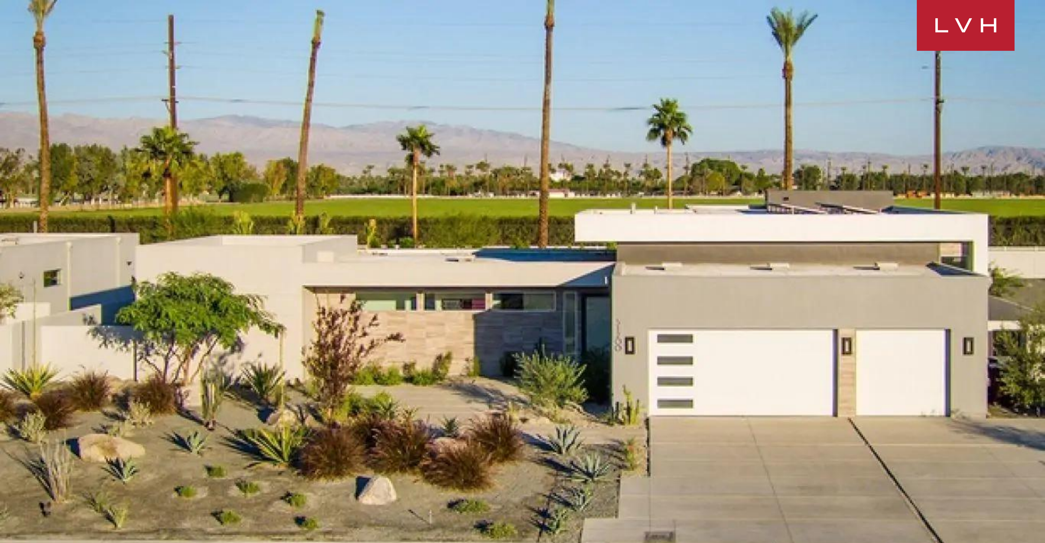
THE POLO VILLAS HOUSE 11 LA QUINTA, PALM SPRINGS