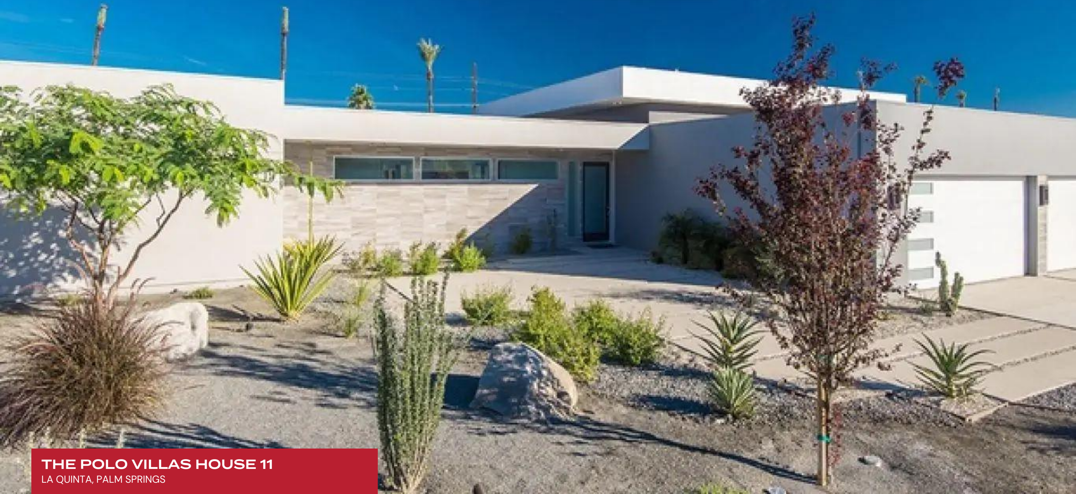
THE POLO VILLAS HOUSE 11 LA QUINTA, PALM SPRINGS