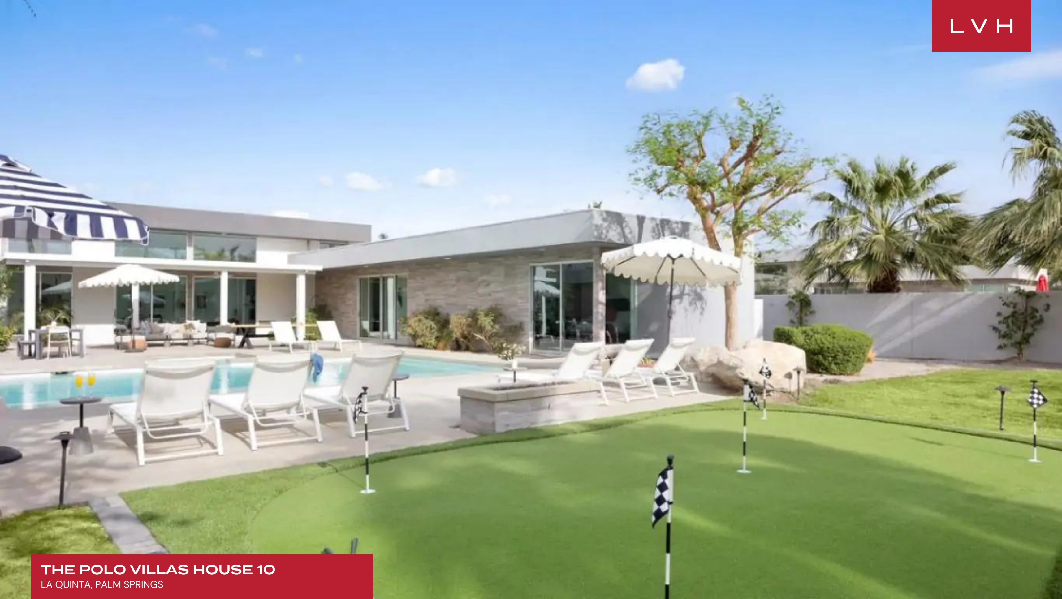
THE POLO VILLAS HOUSE 10 LA QUINTA, PALM SPRINGS