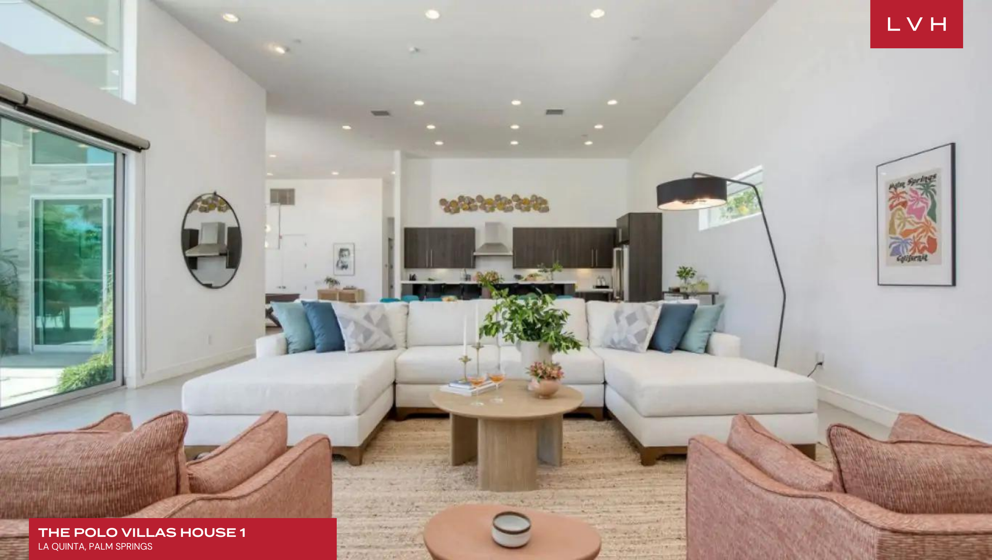
THE POLO VILLAS HOUSE 1 LA QUINTA, PALM SPRINGS