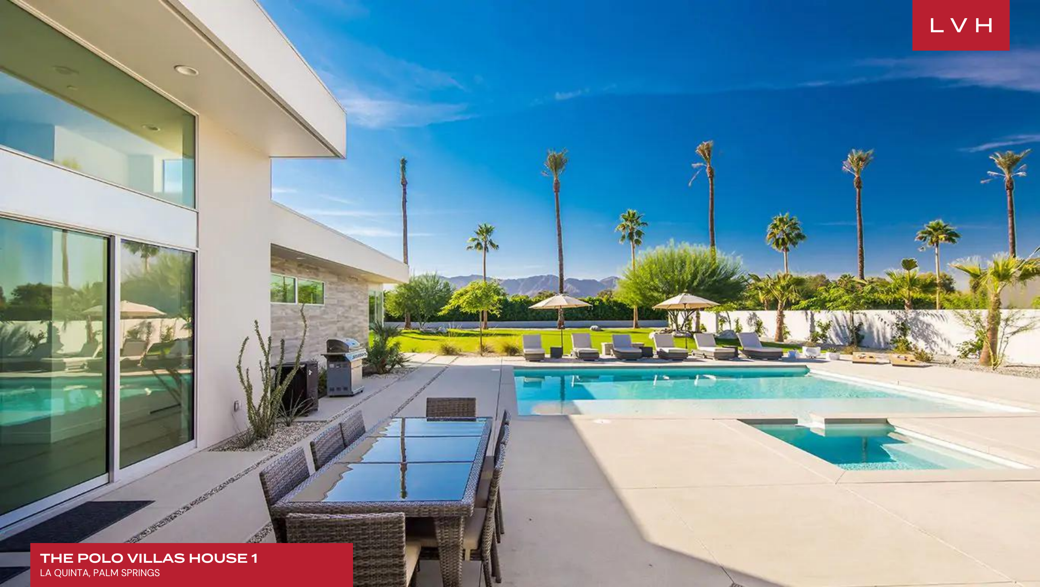
THE POLO VILLAS HOUSE 1 LA QUINTA, PALM SPRINGS