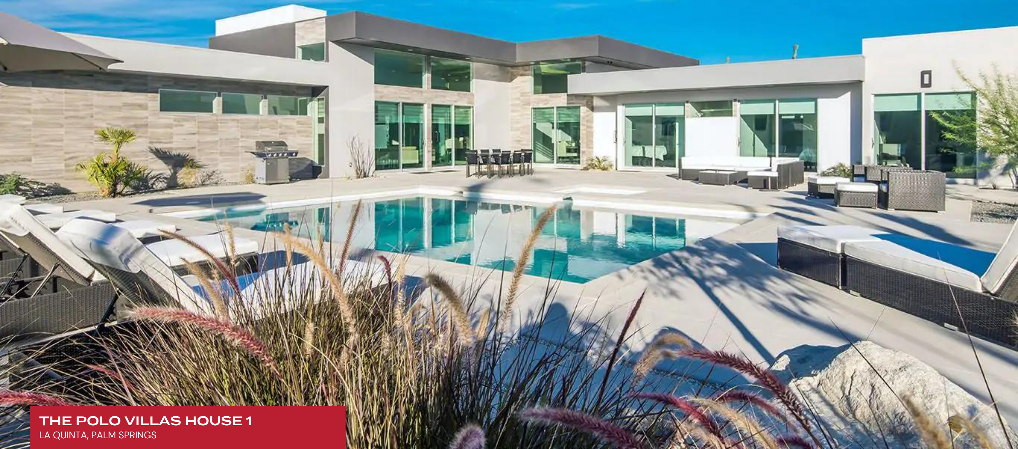
THE POLO VILLAS HOUSE 1 LA QUINTA, PALM SPRINGS