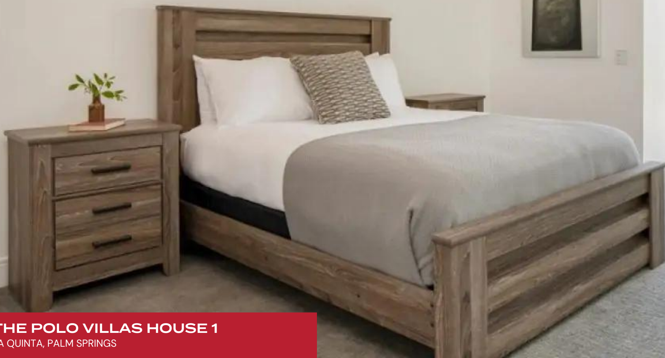
THE POLO VILLAS HOUSE 1 LA QUINTA, PALM SPRINGS