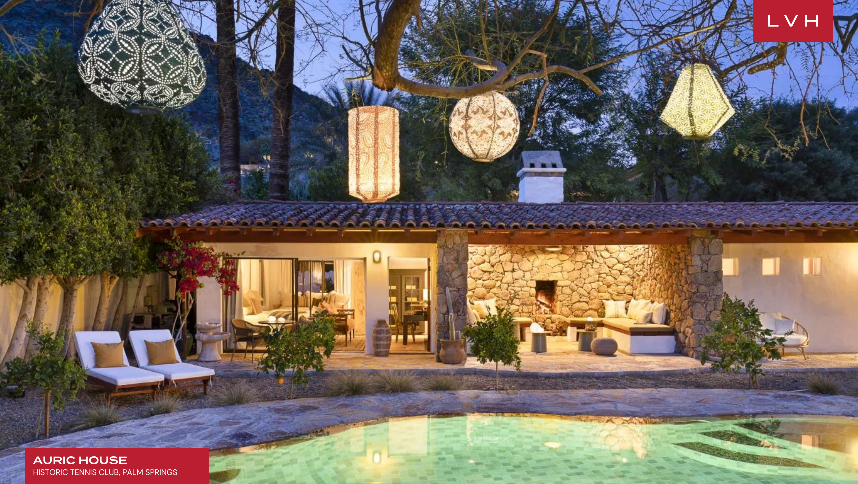
AURIC HOUSE HISTORIC TENNIS CLUB, PALM SPRINGS