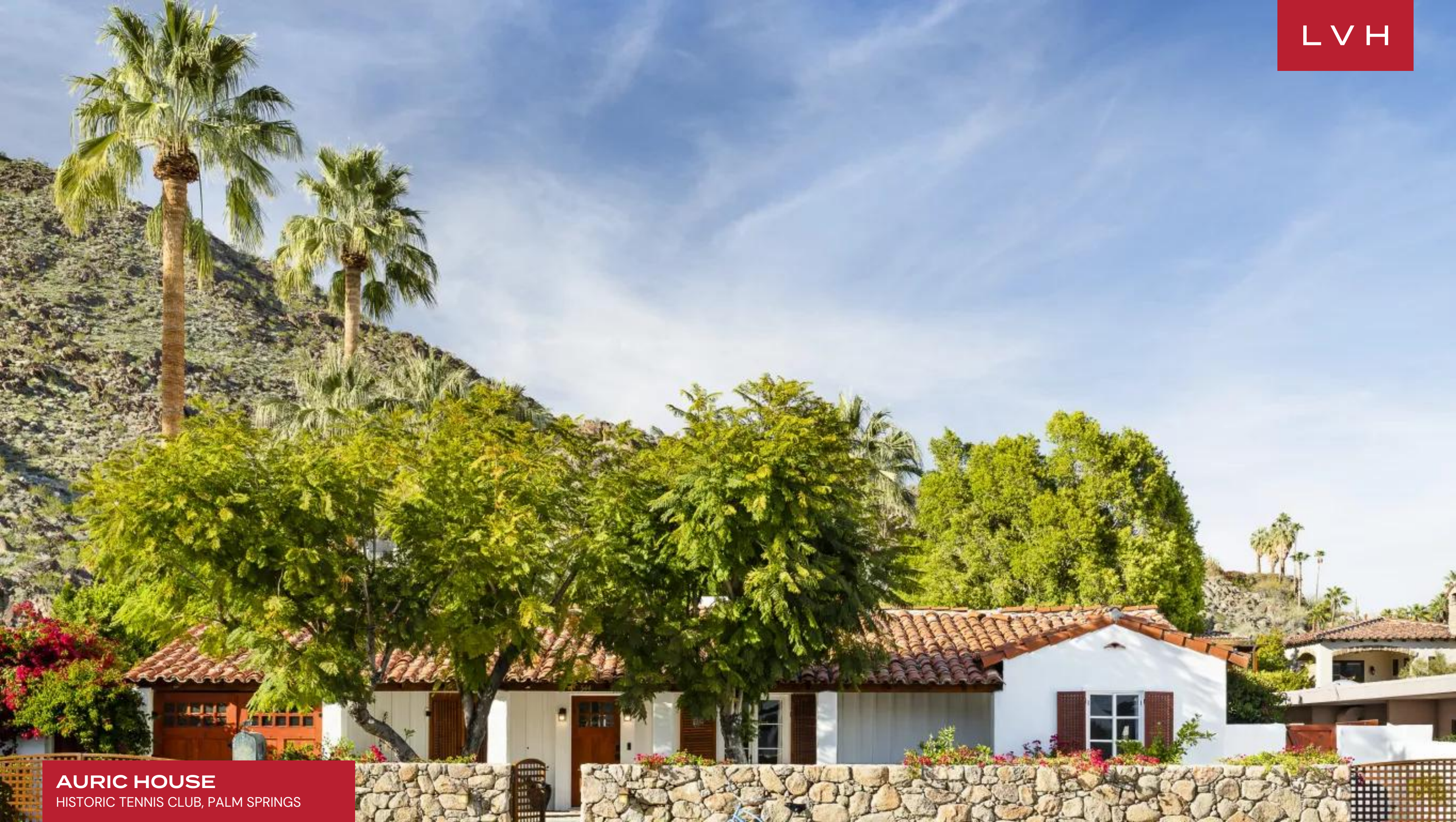
AURIC HOUSE HISTORIC TENNIS CLUB, PALM SPRINGS