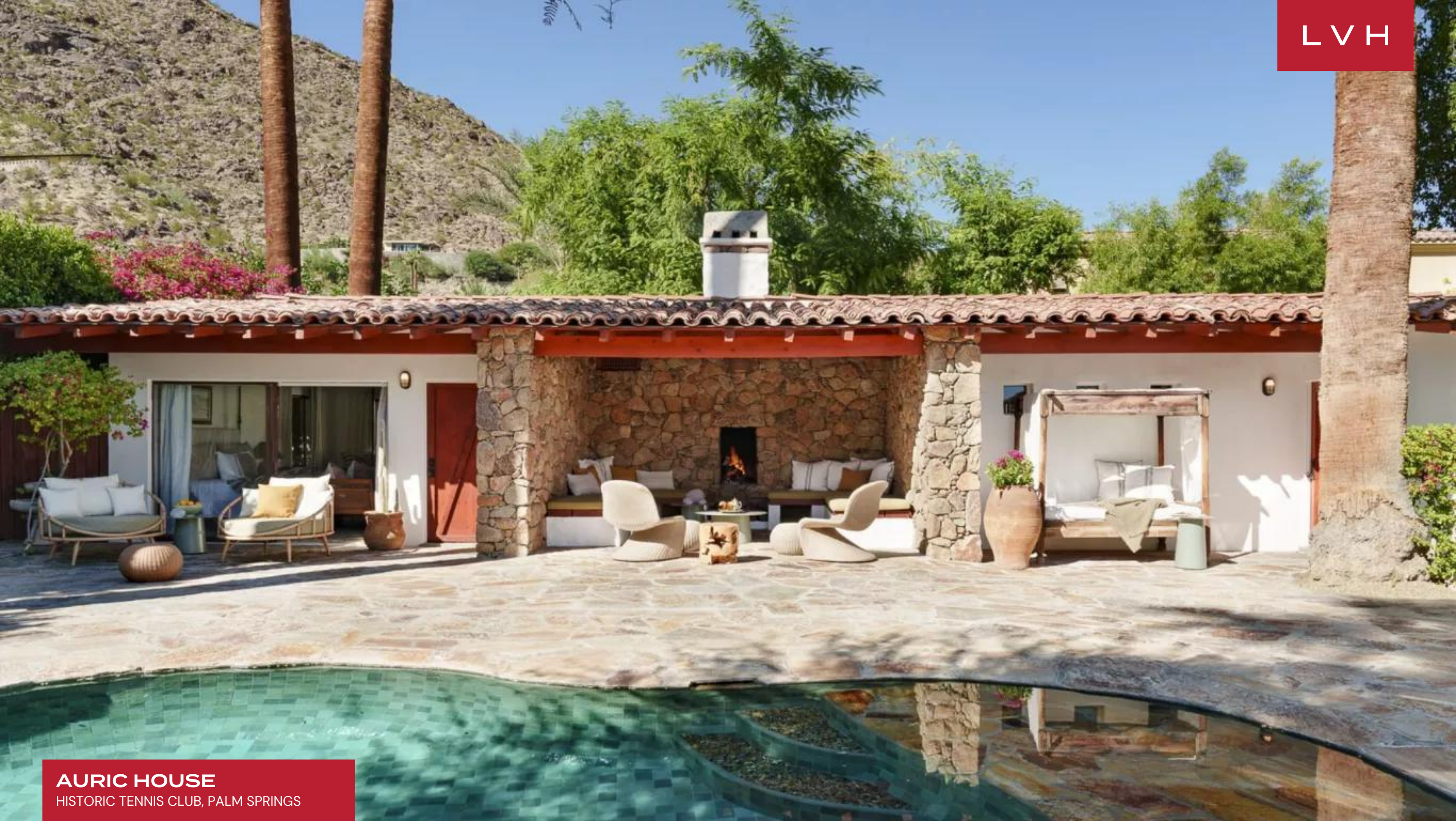
AURIC HOUSE HISTORIC TENNIS CLUB, PALM SPRINGS