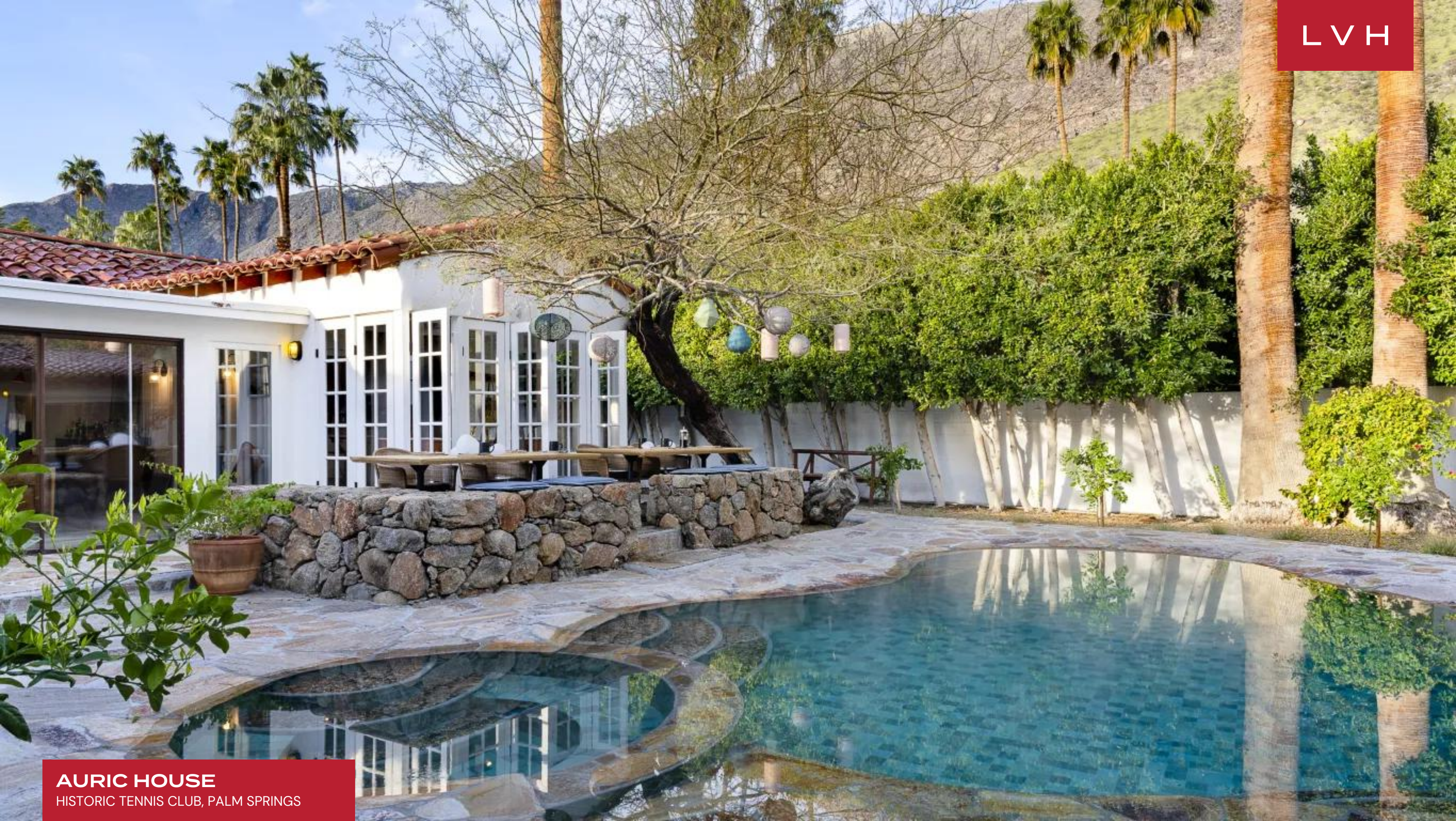
AURIC HOUSE HISTORIC TENNIS CLUB, PALM SPRINGS