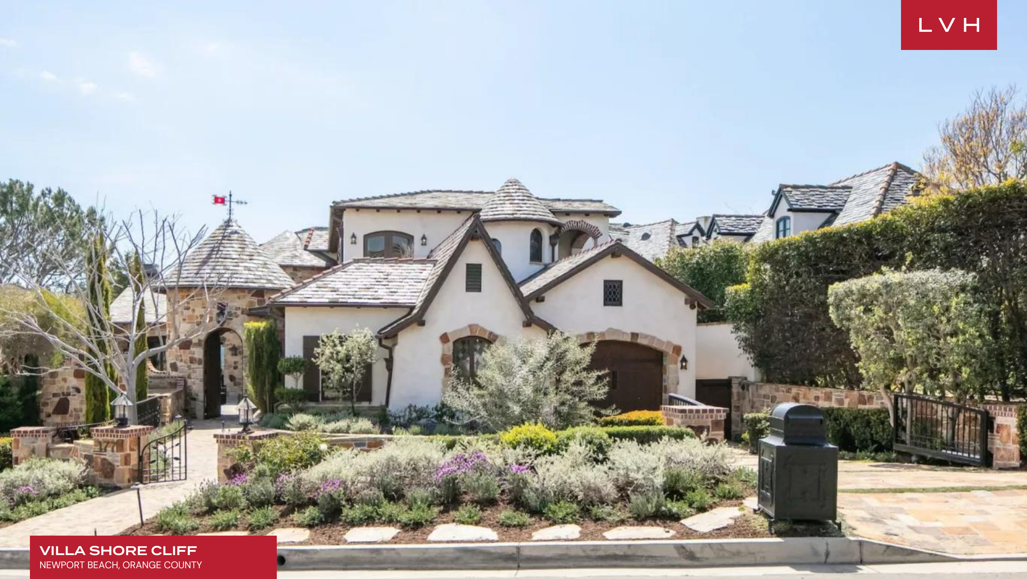
VILLA SHORE CLIFF NEWPORT BEACH, ORANGE COUNTY