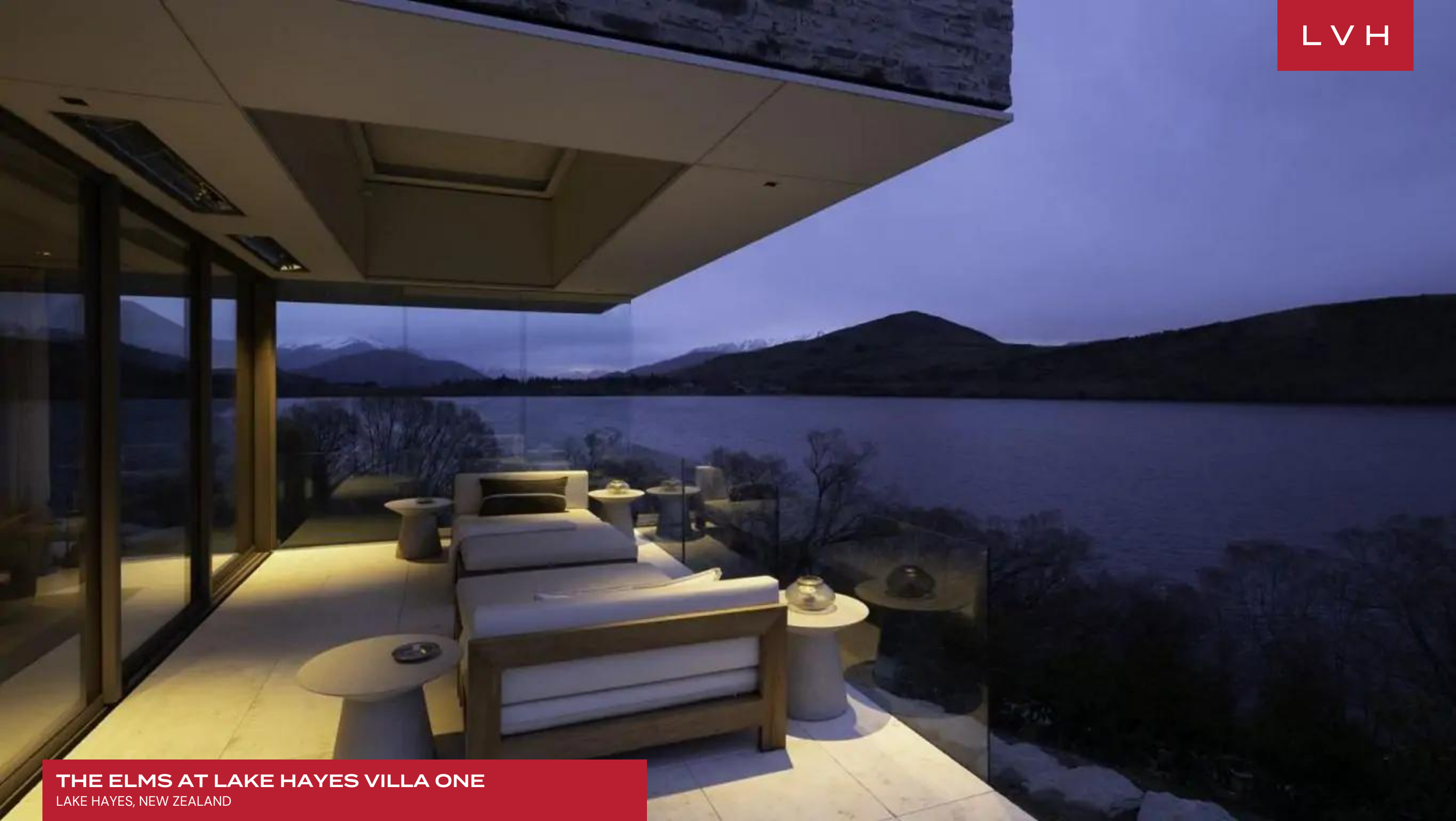
THE ELMS AT LAKE HAYES VILLA ONE LAKE HAYES, NEW ZEALAND