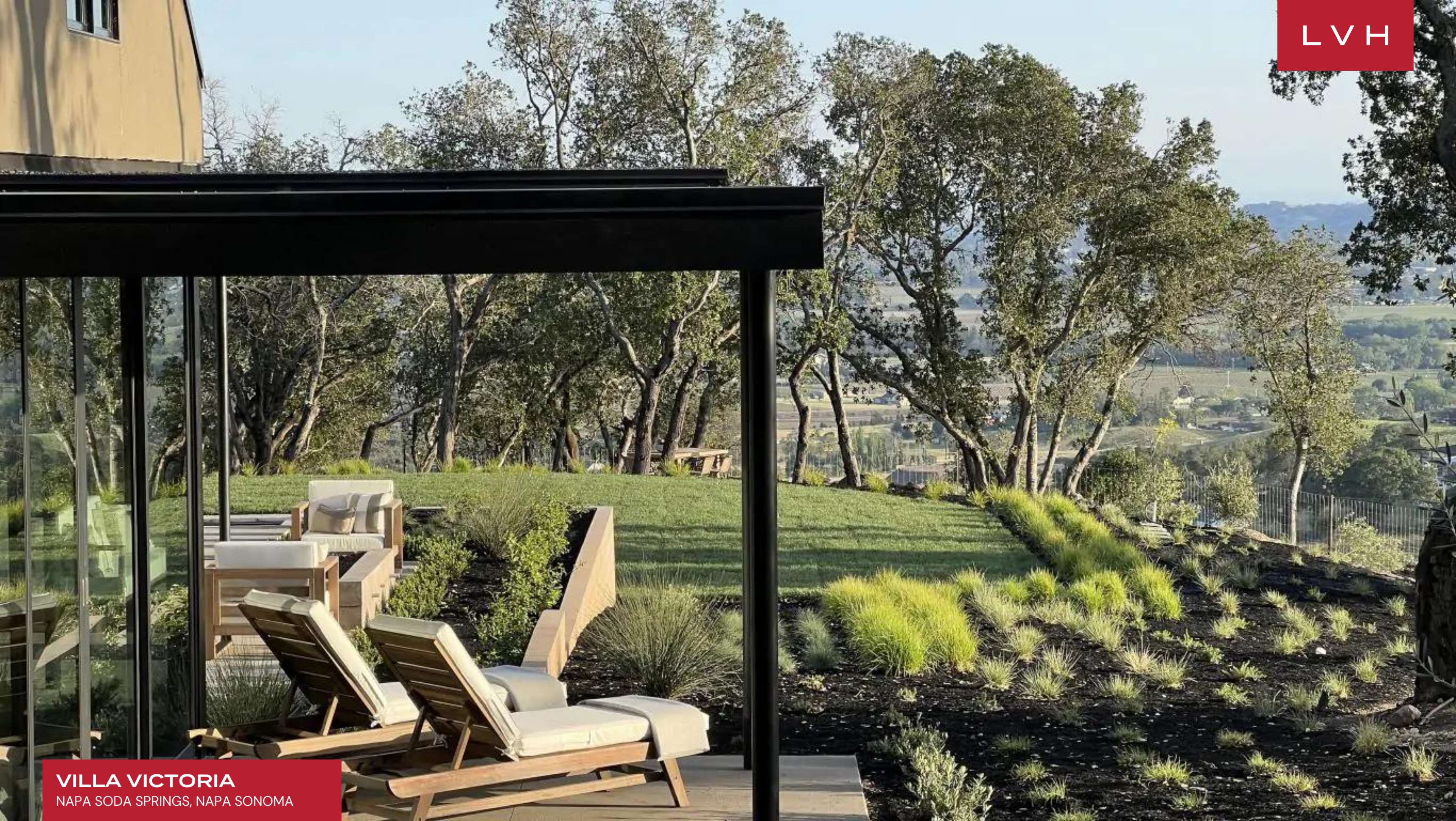
VILLA VICTORIA NAPA SODA SPRINGS, NAPA SONOMA