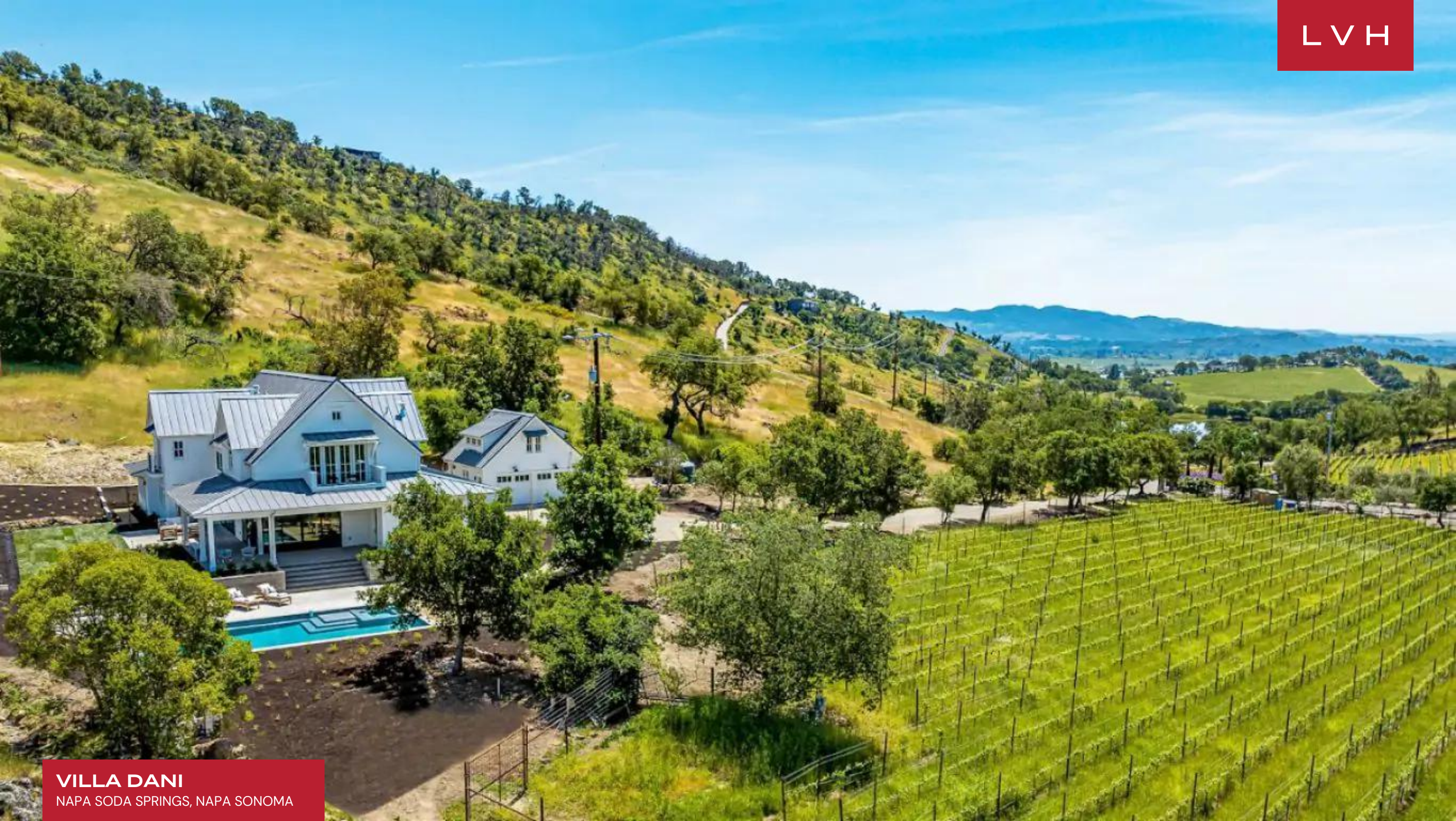
VILLA DANI NAPA SODA SPRINGS, NAPA SONOMA