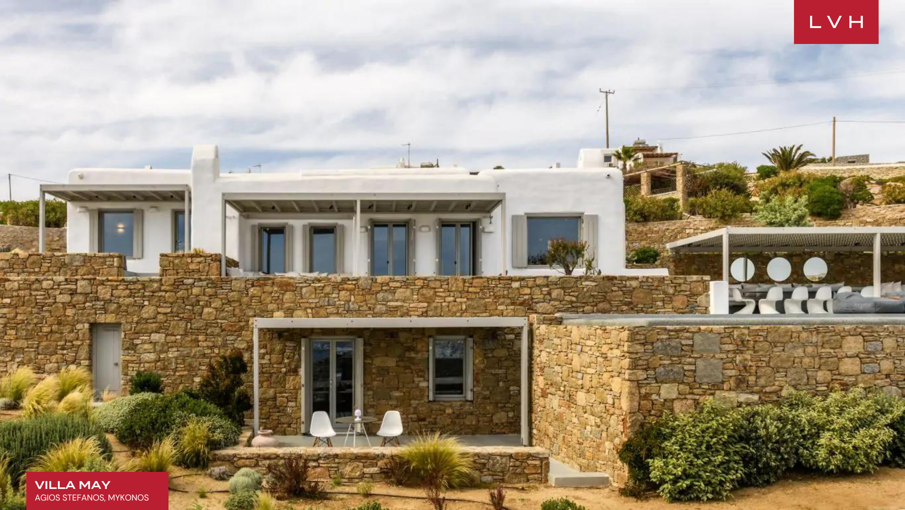
VILLA MAY AGIOS STEFANOS, MYKONOS