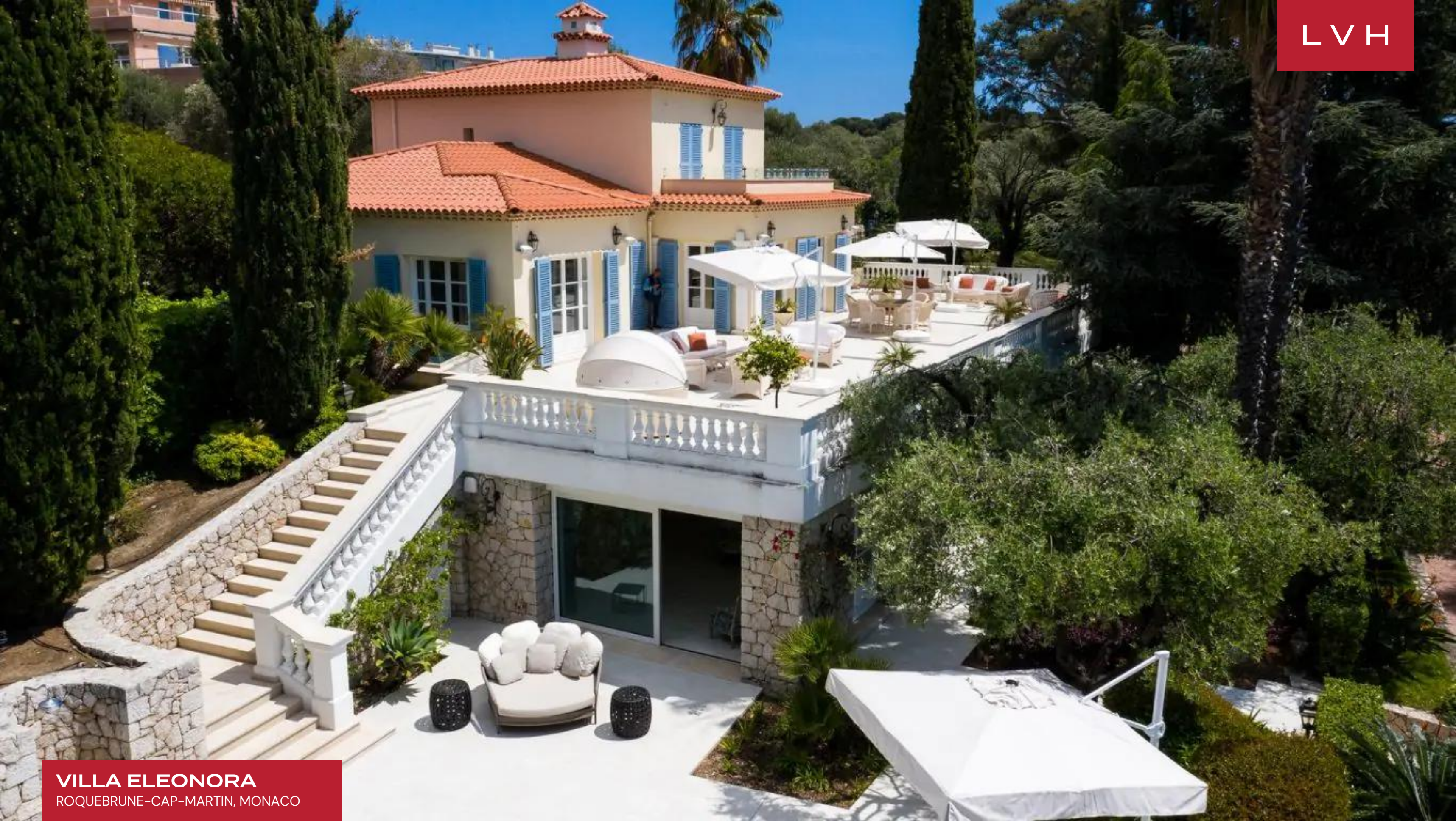
VILLA ELEONORA ROQUEBRUNE-CAP-MARTIN, MONACO